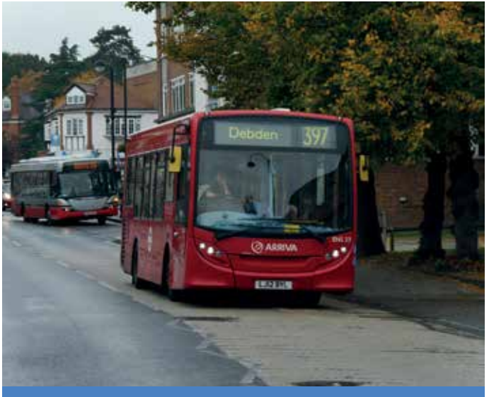
Local bus service

4.93 A number of transport investment opportunities have already been identified within the District. The Council recognises that there is a need to ensure that the implementation of identified schemes and those that may be identified over the course of the Local Plan period, which are needed to support the delivery of future development, the success of the local and wider economy and on the well-being of residents should not be fettered. Consequently, there is a need to ensure that land is protected from development which would impact on the successful delivery of such schemes.