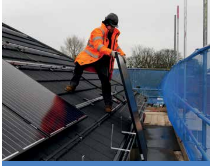
Sustainable energy solar panels