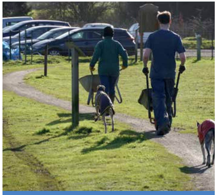
Countrycare volunteers at Bobbingworth