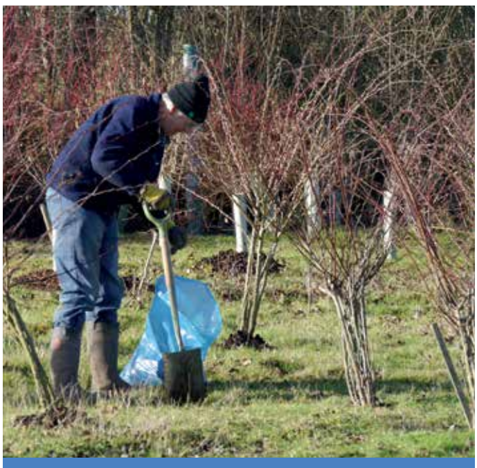
Countrycare volunteers at Bobbingworth