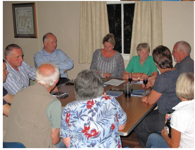
Planning the Knock Strategy