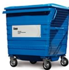
Dimensions in millimetres