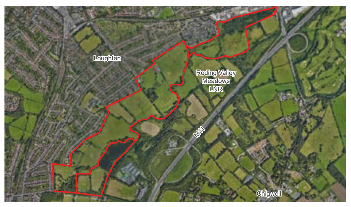
Aerial view of Roding Valley Playing Fields in Loughton

The eastern boundary of the site is defined by the River Roding with views across it to the Roding Valley Meadows in many places.