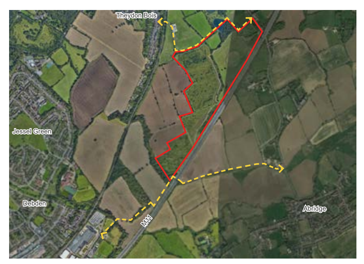
Aerial view of The Woodland Trust Site in Theydon Bois

The land is gently sloping grade III agricultural land immediately west of the M11 near Theydon Bois. It is close to Epping Forest and it is believed may have once formed part of it. A small stream cuts through the site. The entrance to the site is on the Abridge Road, heading out of Theydon Bois just before the M11 motorway flyover and parts of the site are very visible from it. Public Rights of Way outside of the site provide links into it from both Theydon Bois and Debden. There is a good network of paths through the wood, including two linked public rights of way and a surfaced path. Part of the site has been kept free from planting in order to retain important views from the site across London.