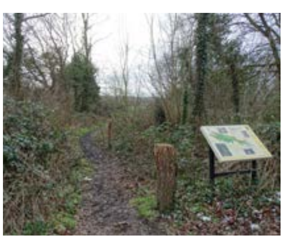
Entrance from Oakwood Hill