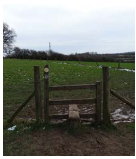
PRoW access from Theydon Bois

The site provides a unique resource for local residents. The development of the site has linked two previously disconnected parts of the ProW network. However, the links from both Theydon Bois and Debden are, for the main part, of a poor quality and wayfinding and signage is poor. In order to provide for access to it to support its use as a natural green space the PRoW network from both Theydon Bois and Debden into the site require enhancements in terms of surfacing, improving its accessibility for all and enhanced signage. Improvements of links within Debden itself to the site will also be explored.