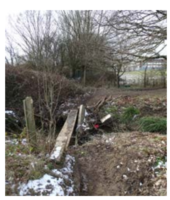
PRoW access from Debden