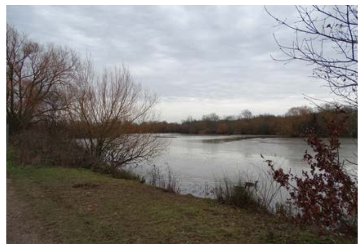
Roding Valley Lake

The costs are noted as 'dependent upon exact size and nature of scheme.'