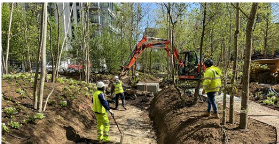
New tree planting in urban 'Forest' by Spacehub

£86-390 (depending on specification of tree and planting density)