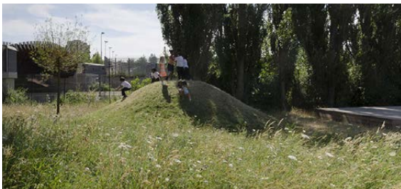
Drapers Field, Waltham Forest by Kinnear Landscape Architects