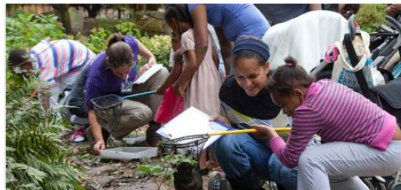
Warpole Park, Ealing by J&L Gibbons