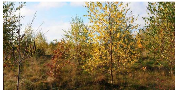
New woodland creation at Heartwood Forest, Hertfordshire