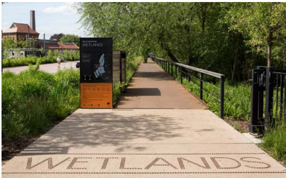
Walthamstow Wetlands by Kinnear Landscape Architects