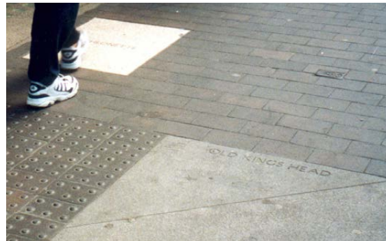
Borough Highstreet by East Architecture