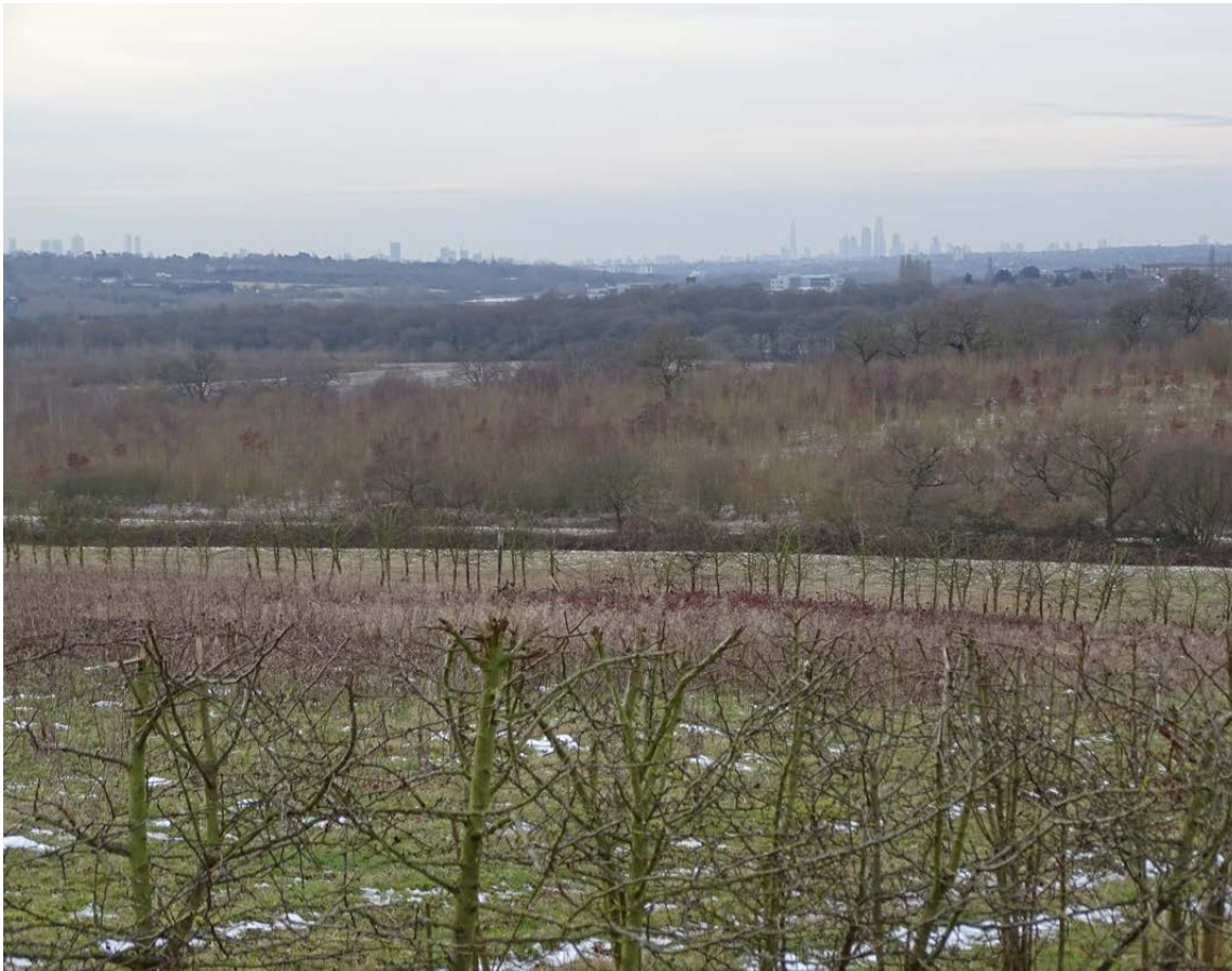
Views to Central London across the site

Information on visiting Theydon Bois Wood can be found here . The Management Plan 2017-2022 can be found here .