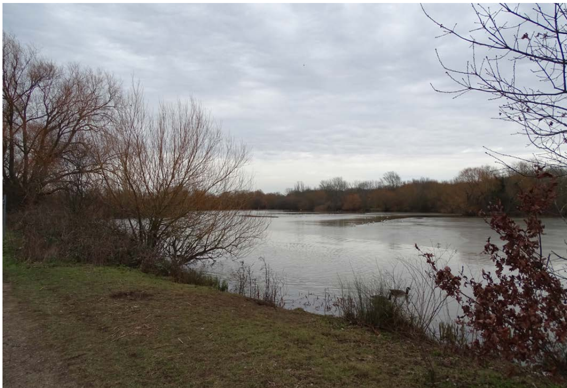
Roding Valley Lake

The costs are noted as 'dependent upon exact size and nature of scheme.'