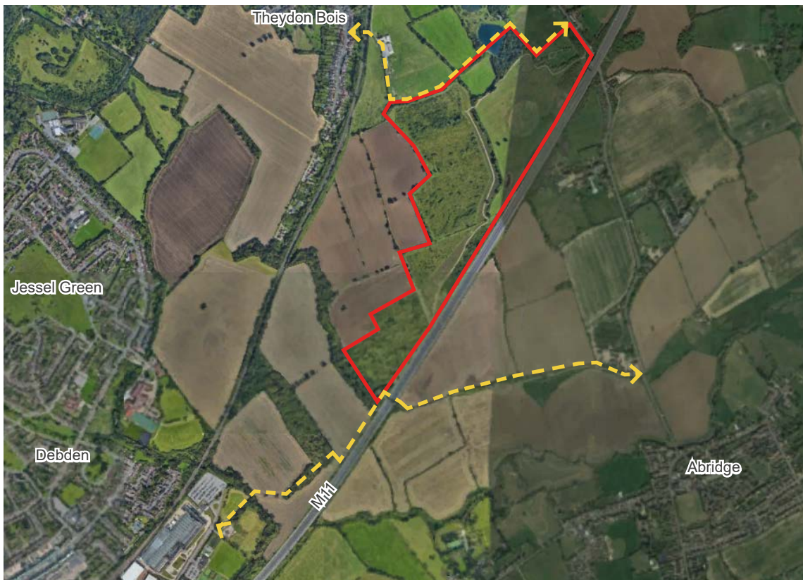
Aerial view of The Woodland Trust Site in Theydon Bois

The land is gently sloping grade III agricultural land immediately west of the M11 near Theydon Bois. It is close to Epping Forest and it is believed may have once formed part of it. A small stream cuts through the site. The entrance to the site is on the Abridge Road, heading out of Theydon Bois just before the M11 motorway flyover and parts of the site are very visible from it. Public Rights of Way outside of the site provide links into it from both Theydon Bois and Debden. There is a good network of paths through the wood, including two linked public rights of way and a surfaced path. Part of the site has been kept free from planting in order to retain important views from the site across London.