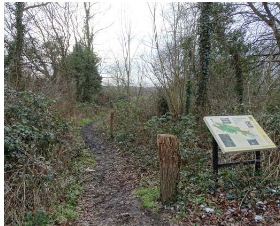
Entrance from Oakwood Hill