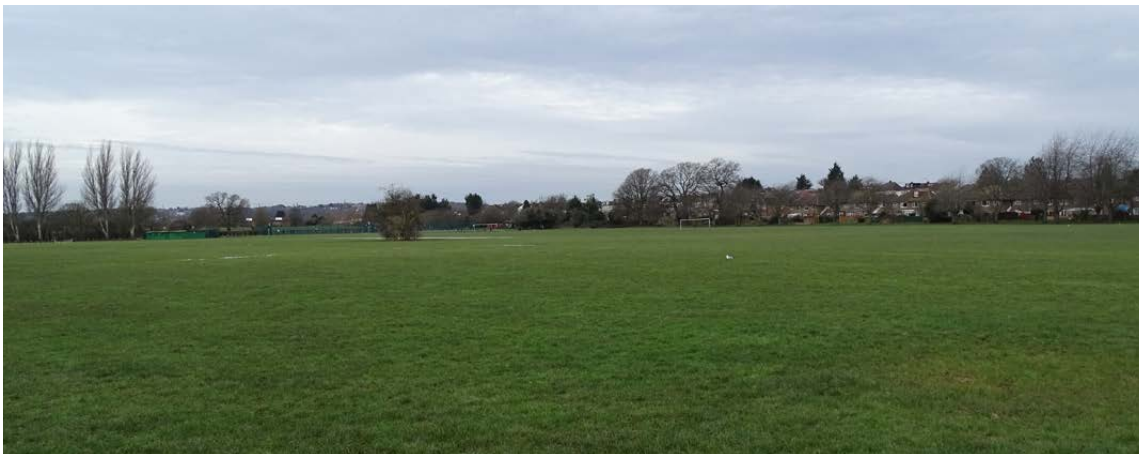
View over the Recreation Ground

Enhancements across the Recreation Ground part of the Project site would help to create more visual interest, increase biodiversity and enhance its usability. This could be achieved without impacting on the formal sports pitches and would enhance their context – building on the ‘Best Kept Pitches in Essex’ award made to Loughton Town Council in 2018.