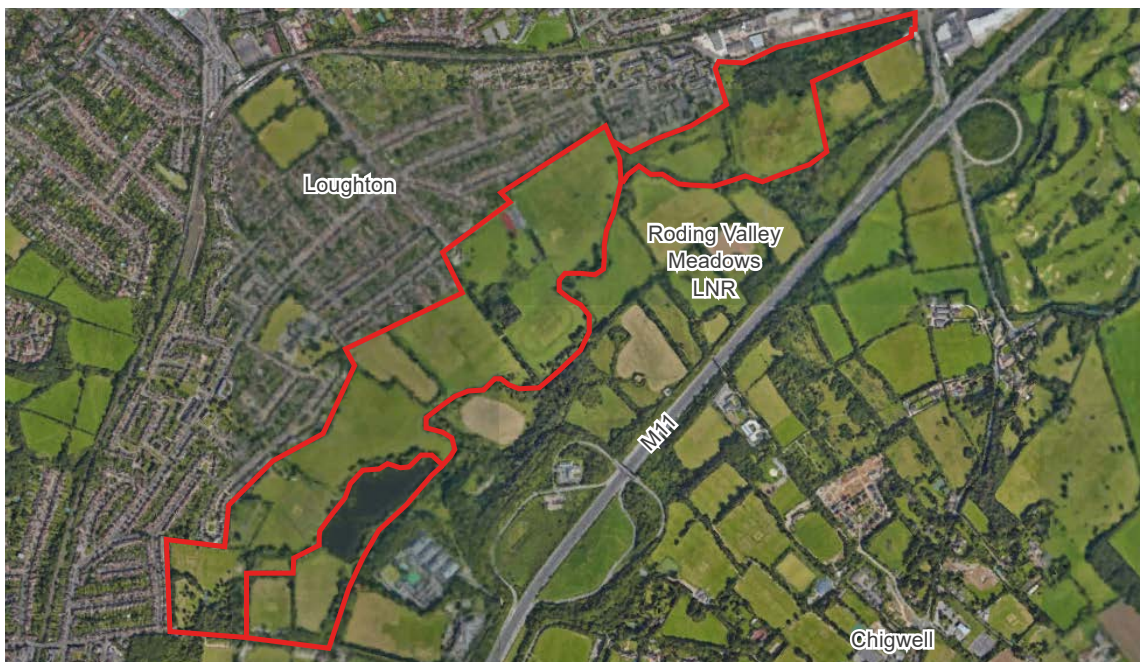
Aerial view of Roding Valley Playing Fields in Loughton

The eastern boundary of the site is defined by the River Roding with views across it to the Roding Valley Meadows in many places.