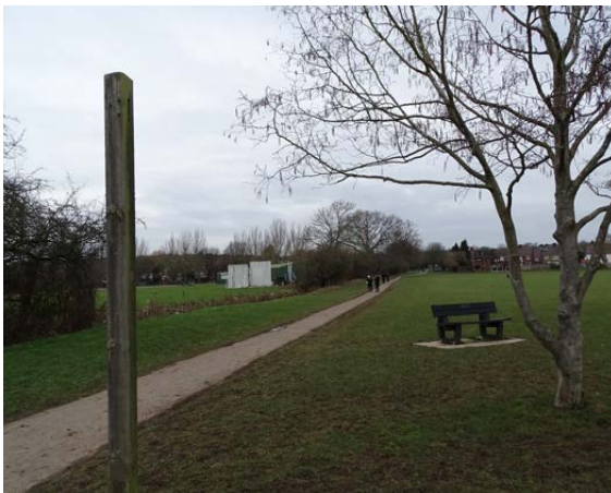
Signpost within the Recreation Ground