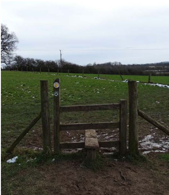
PRoW access from Theydon Bois

The site provides a unique resource for local residents. The development of the site has linked two previously disconnected parts of the ProW network. However, the links from both Theydon Bois and Debden are, for the main part, of a poor quality and wayfinding and signage is poor. In order to provide for access to it to support its use as a natural green space the PProW network from both Theydon Bois and Debden into the site require enhancements in terms of surfacing, improving its accessibility for all and enhanced signage. Improvements of links within Debden itself to the site will also be explored.