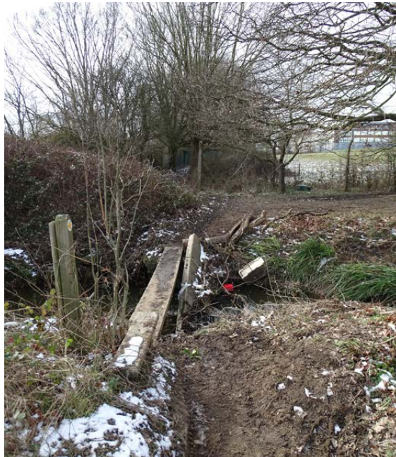
PRoW access from Debden