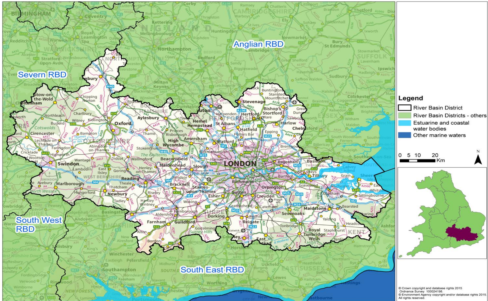
Figure 1: Map of the Thames river basin district