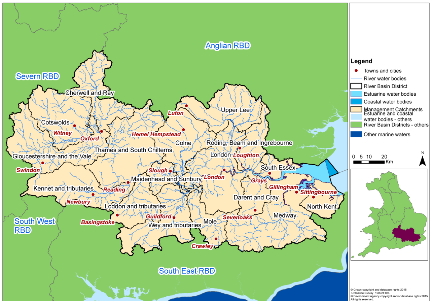
Figure 2: Management catchments within the Thames river basin district

Each catchment partnership is committed to working collaboratively to share evidence, develop common priorities and carry out work on the ground. Many partnerships are producing catchment plans that will detail local actions related to the measures in this plan. Partnerships are at different levels of maturity, so while some may have a detailed plan for measures in their catchment, others may be newly formed and may not have such a detailed view at this stage.