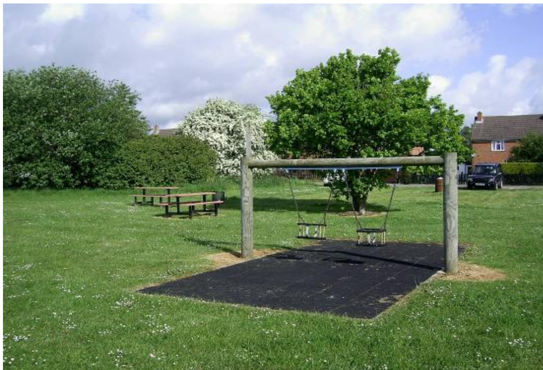
(Land To The Rear Of Horsecroft, Site RG1)