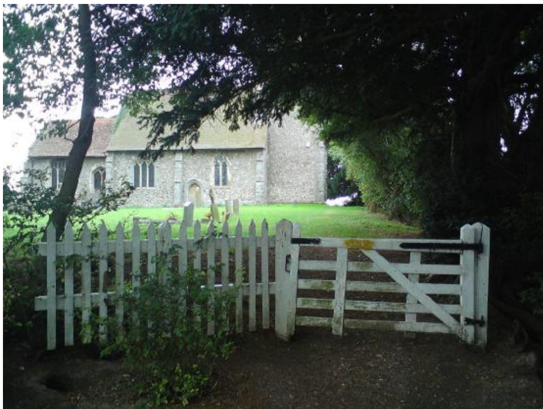
St Botolph's Church, Site CG1