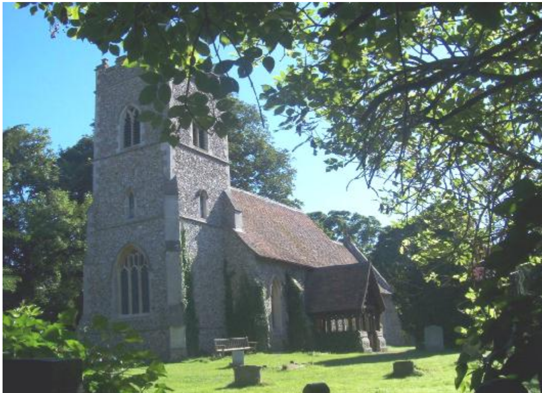
St Edmund's Church, Site CG2