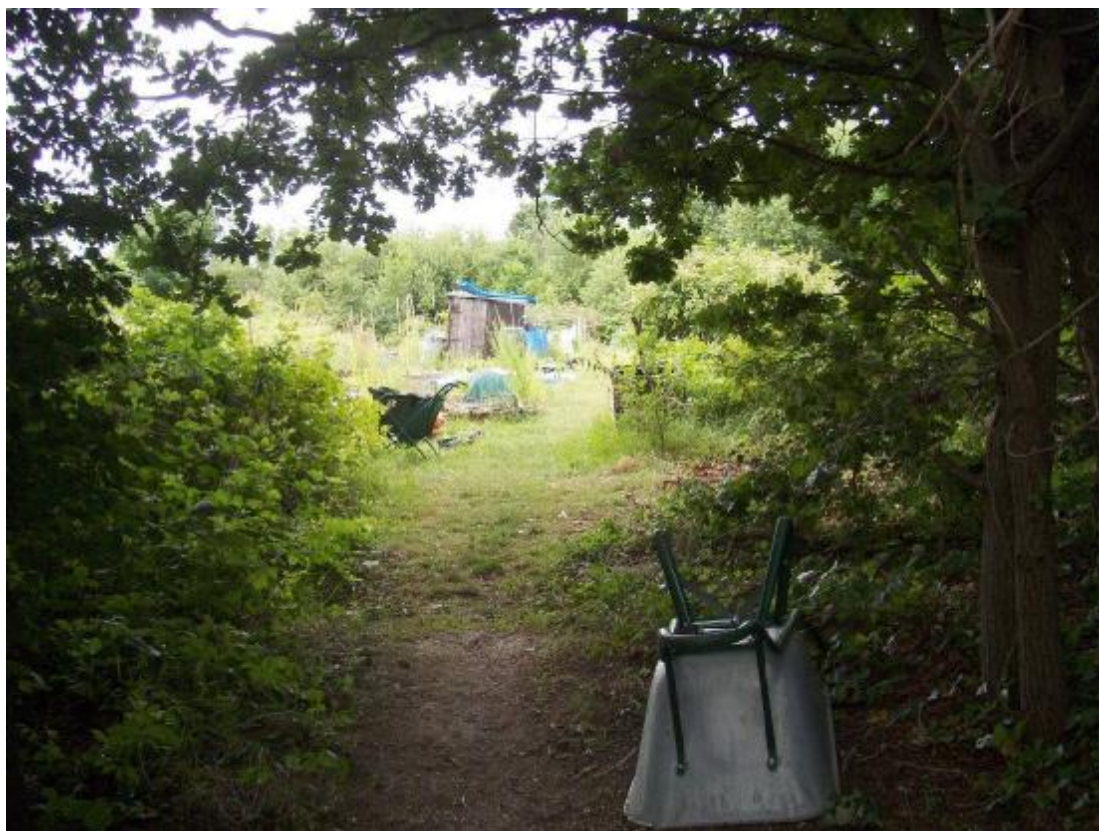
Forest Edge Allotment, Site AT1