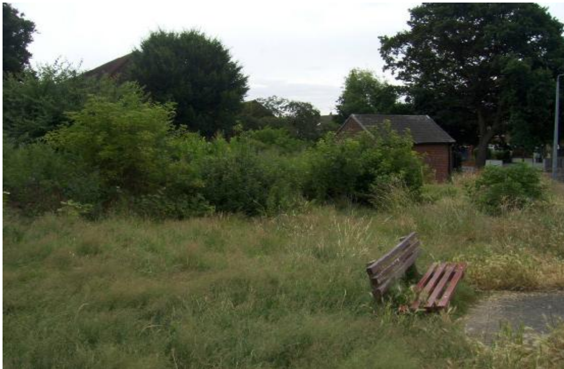
Land between the junction of Chestnut Avenue and Hornbeam Road, Site MO5

10.5 The site appears well maintained and is attractive in appearance. It is clean, despite the absence of litter bins. The trees and bushes which flank the footpath add significantly to the amenity value. Being an important access route, however, this site requires adequate lighting to encourage pedestrians to use both during the night and the day. The lighting along the path is currently minimal, making it a rather unattractive to use at night. The information signs at each end are very worn and need to be replaced.