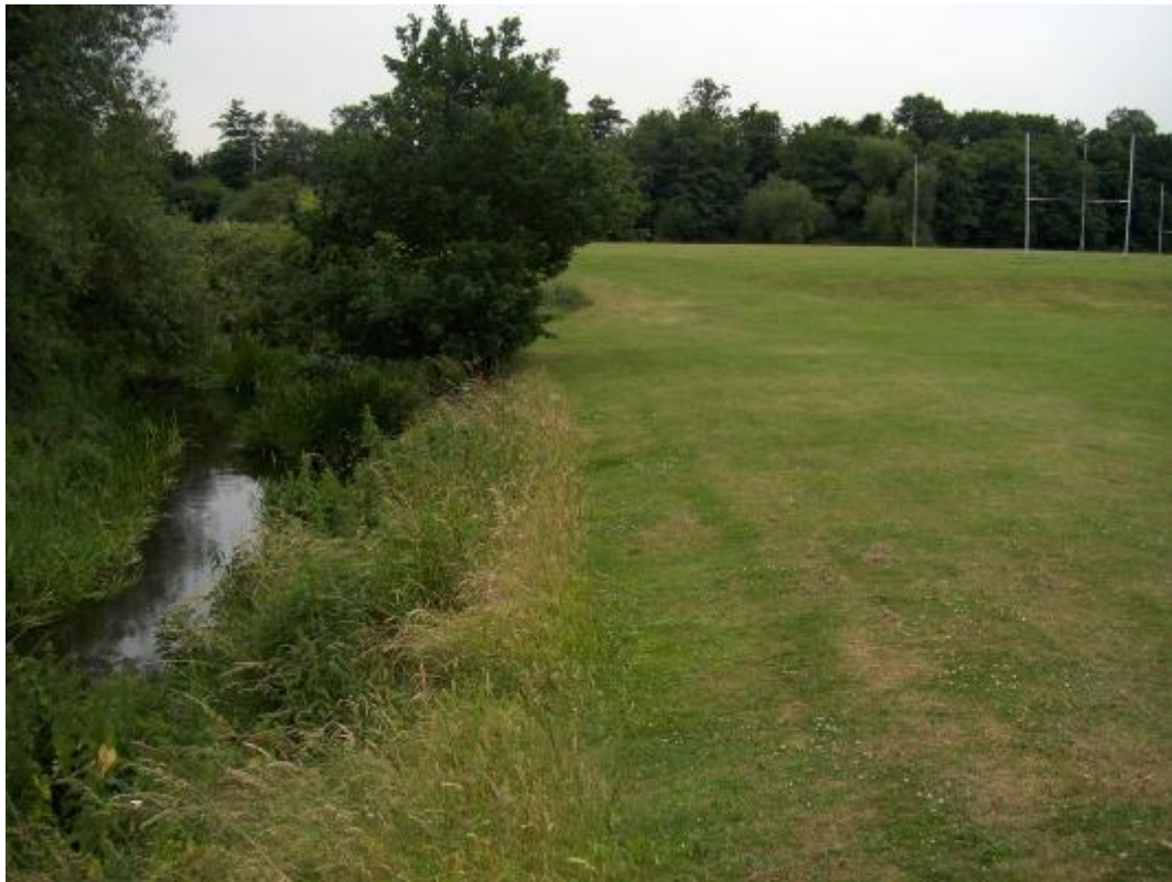
Loughton Rugby Ground, Site FP7