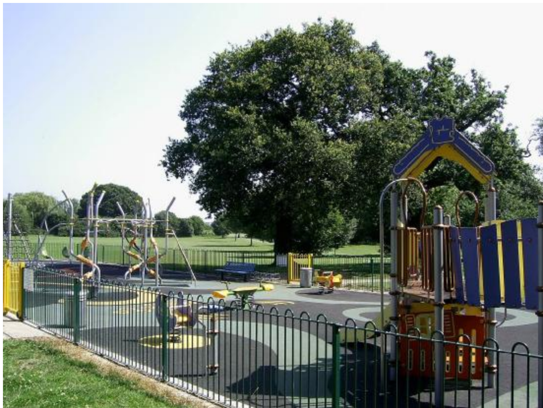
Roding valley Playing Fields Playground North, Site CY1