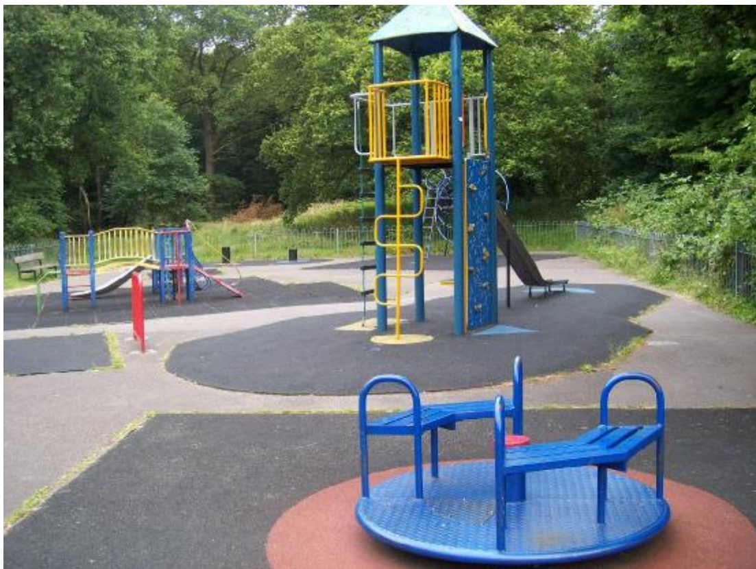
Kings Place Playground, Site CY3