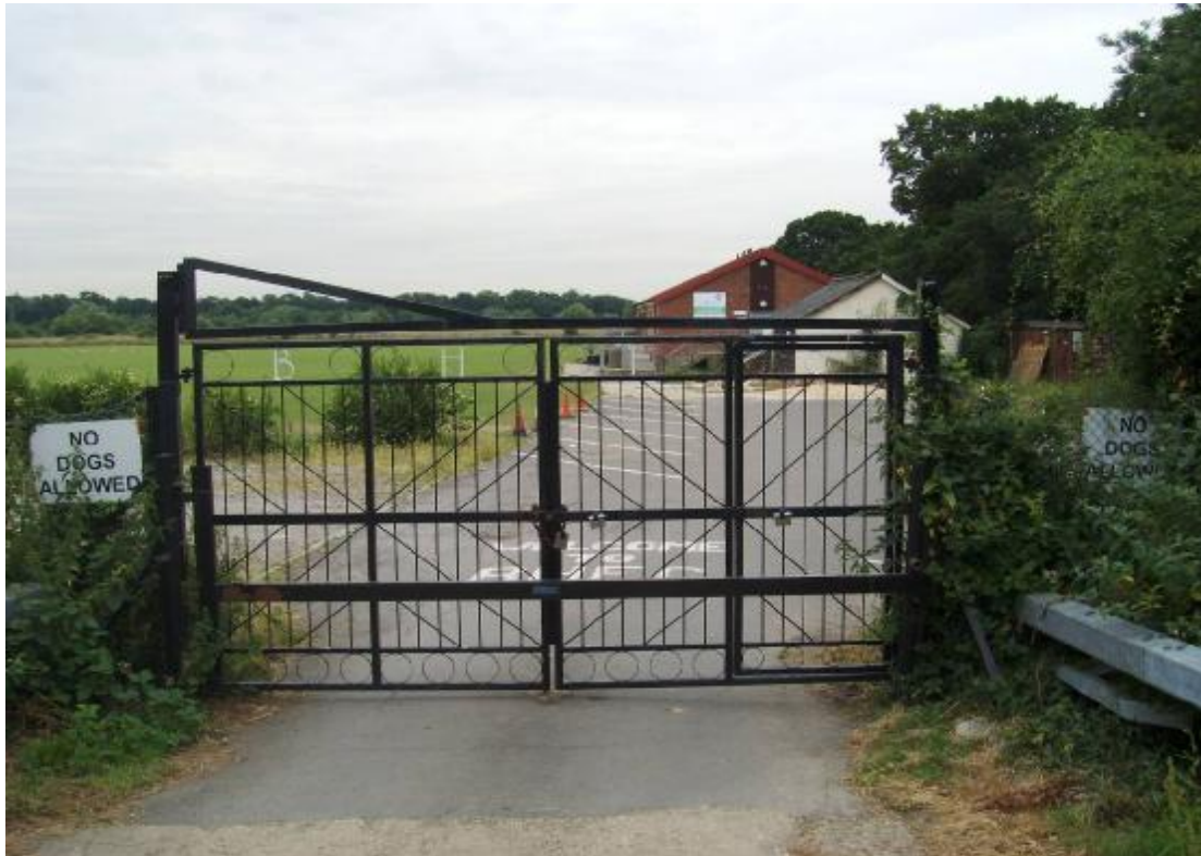
Buckhurst Hill Football Club, Site FP5

attractive views of the surrounding countryside. The site appears to be very well looked after, with no evidence of litter or vandalism.