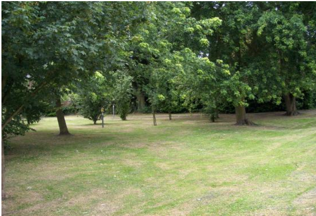
Land between Roebuck Lane and Russell Road, Site MO3