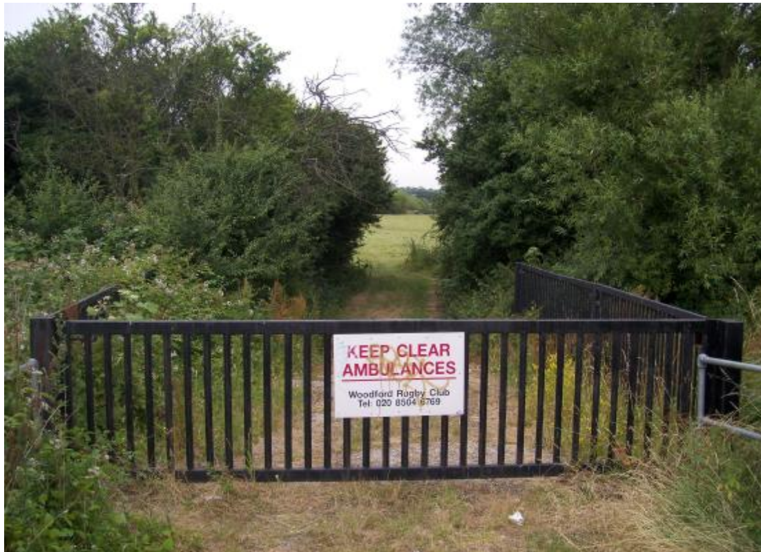
Roding Valley Playing Fields, Site FP2