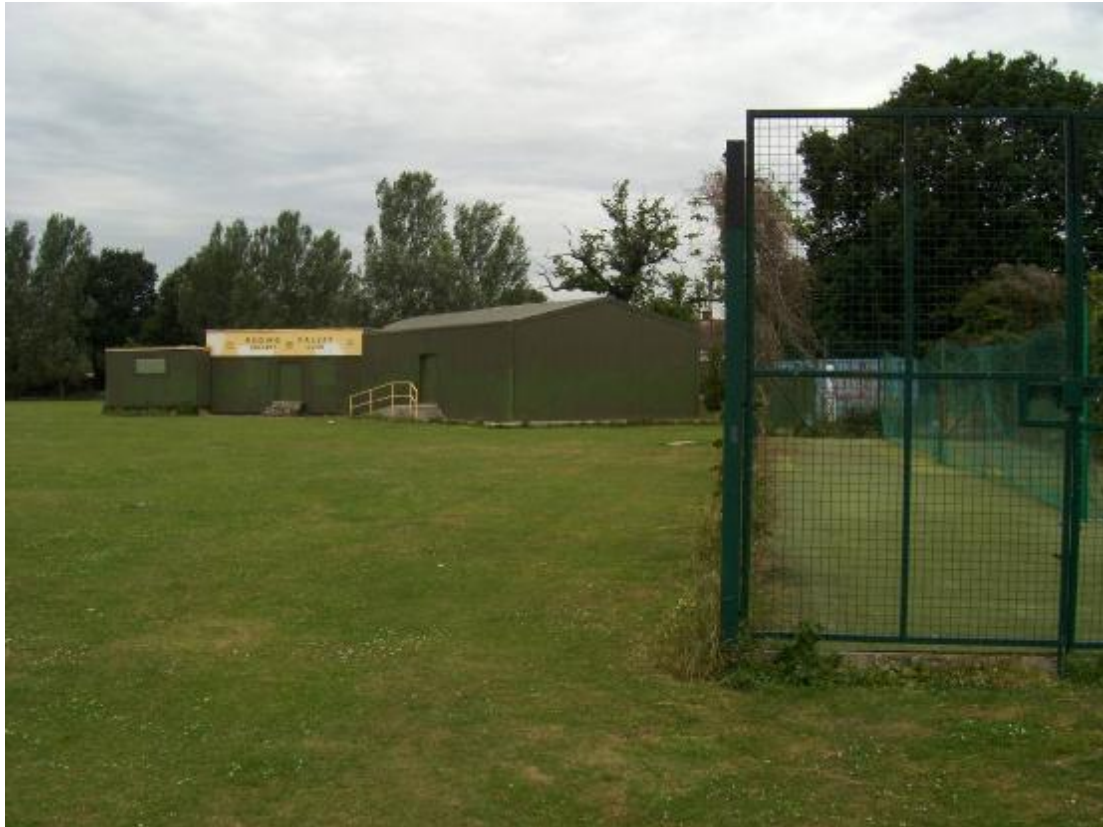
Roding Valley Cricket Club, Site FP1