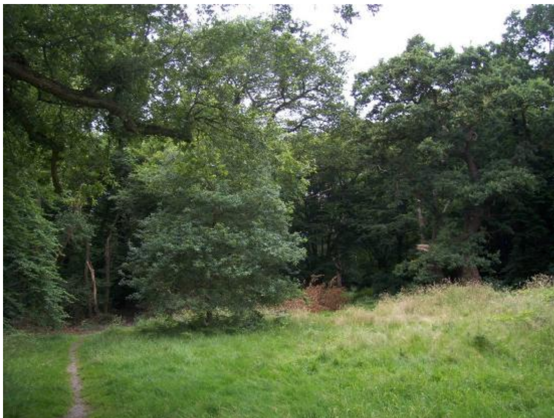
Epping Forest, Site SO1