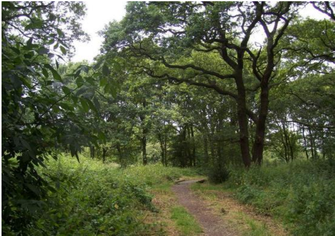
Linder's Field Local Nature Reserve, Site SO2