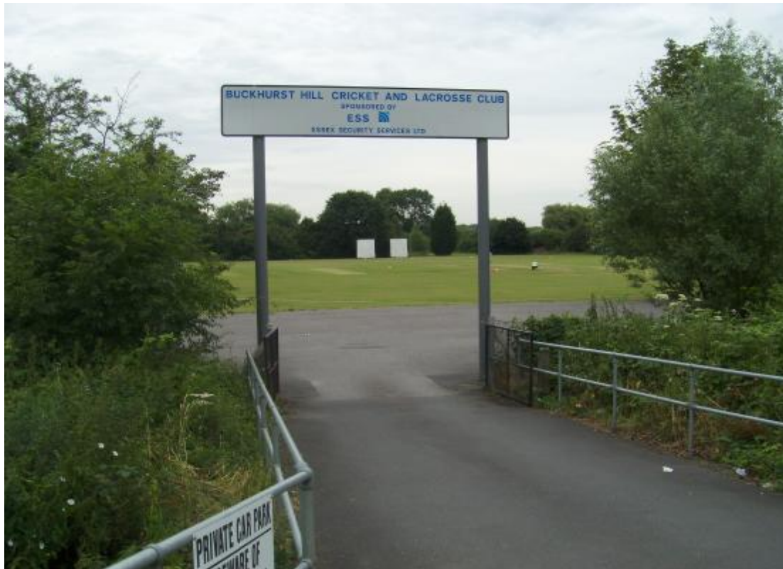
Buckhurst Hill Cricket and Lacrosse Club, Site FP3