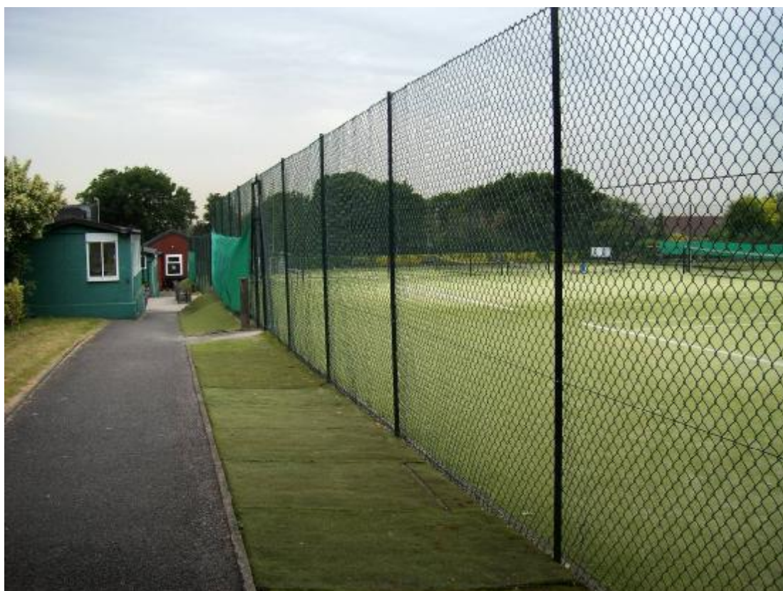
Buckhurst Hill Bowling and Lawn Tennis Club, Site AS1