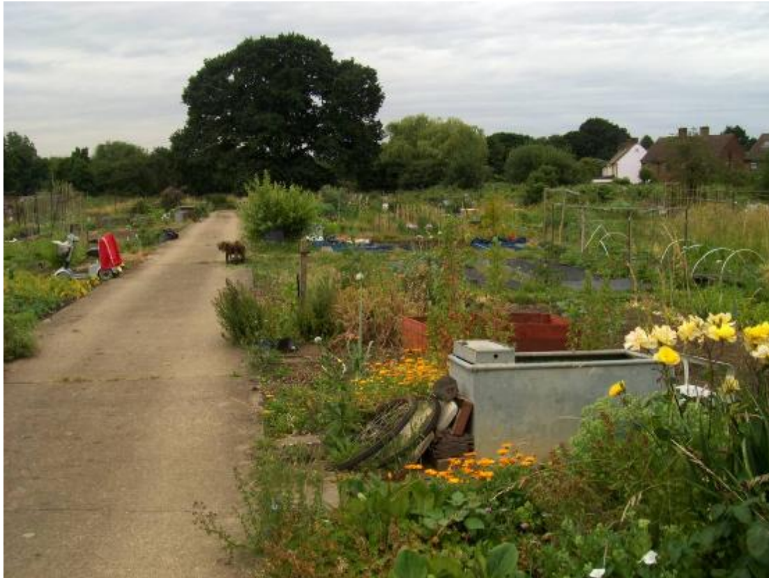
Boxted Close Allotment, Site AT5