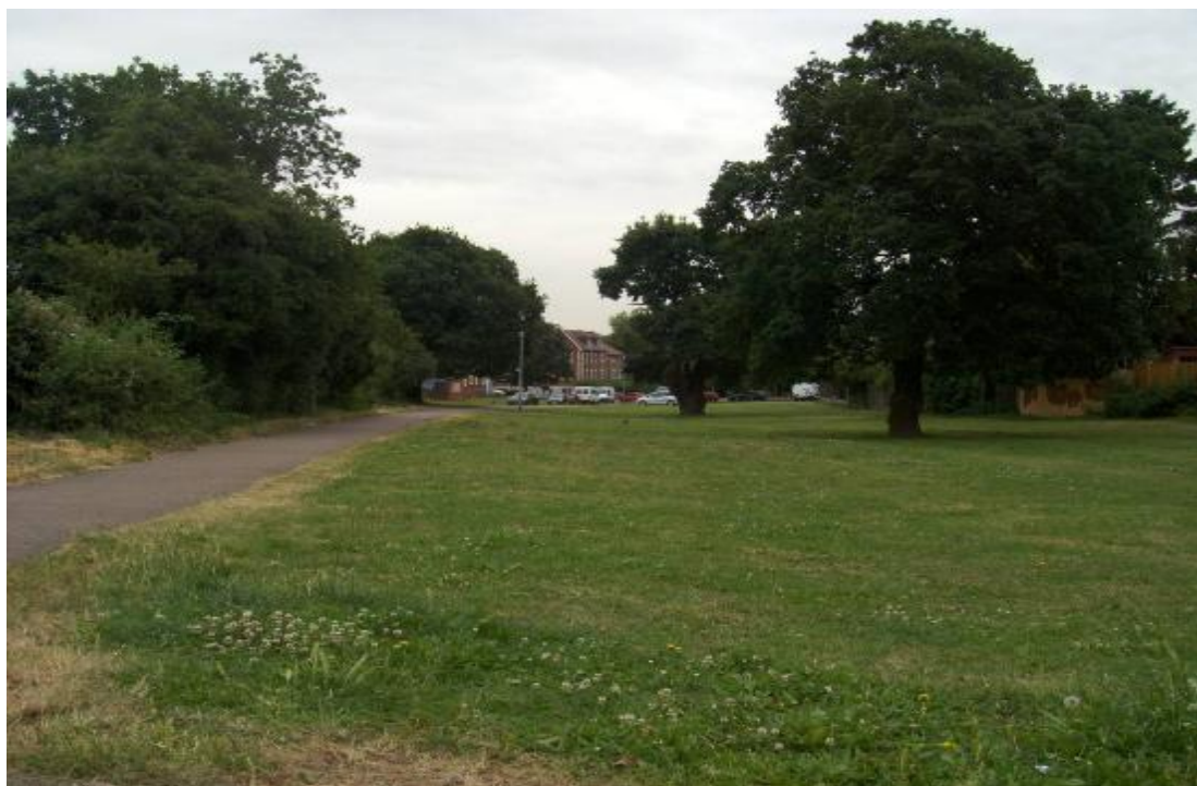
Land between Felstead Road and Loughton Way, Site MO1