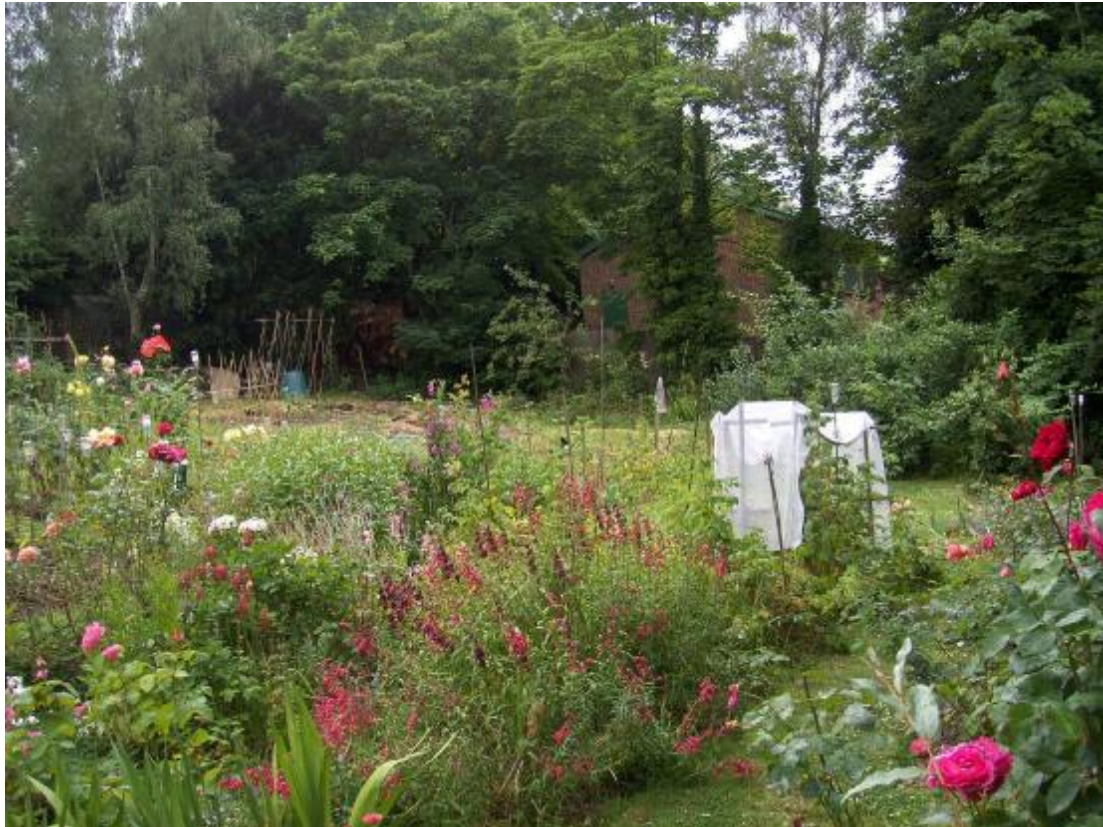
Palace Gardens Allotment, Site AT6