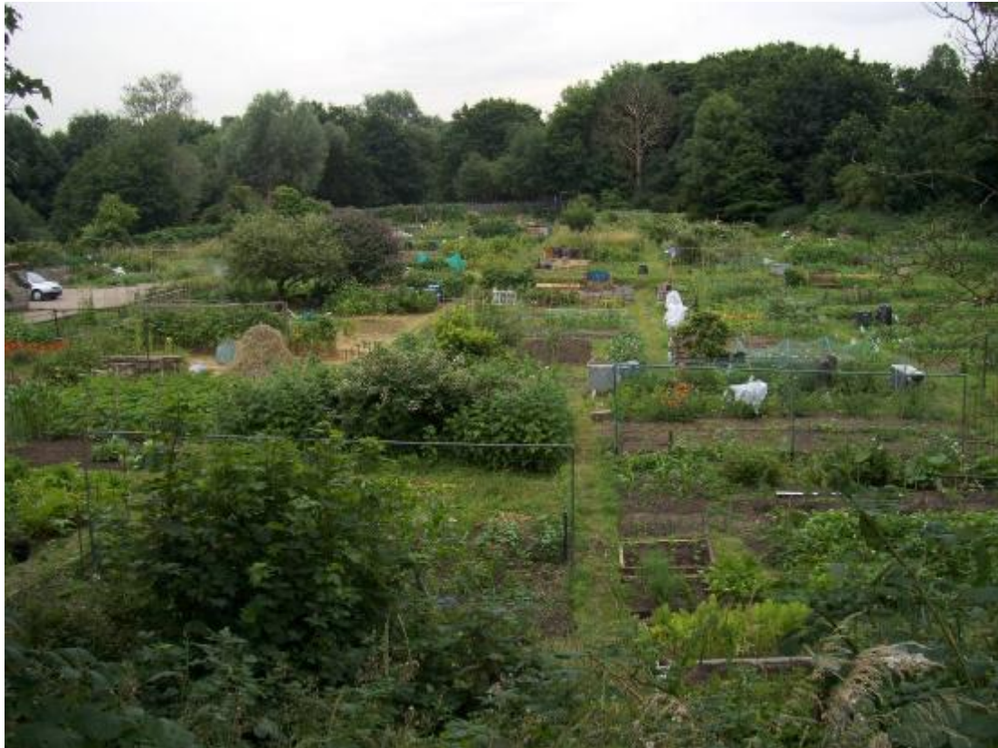
Lower Queens Road Allotment, Site AT4