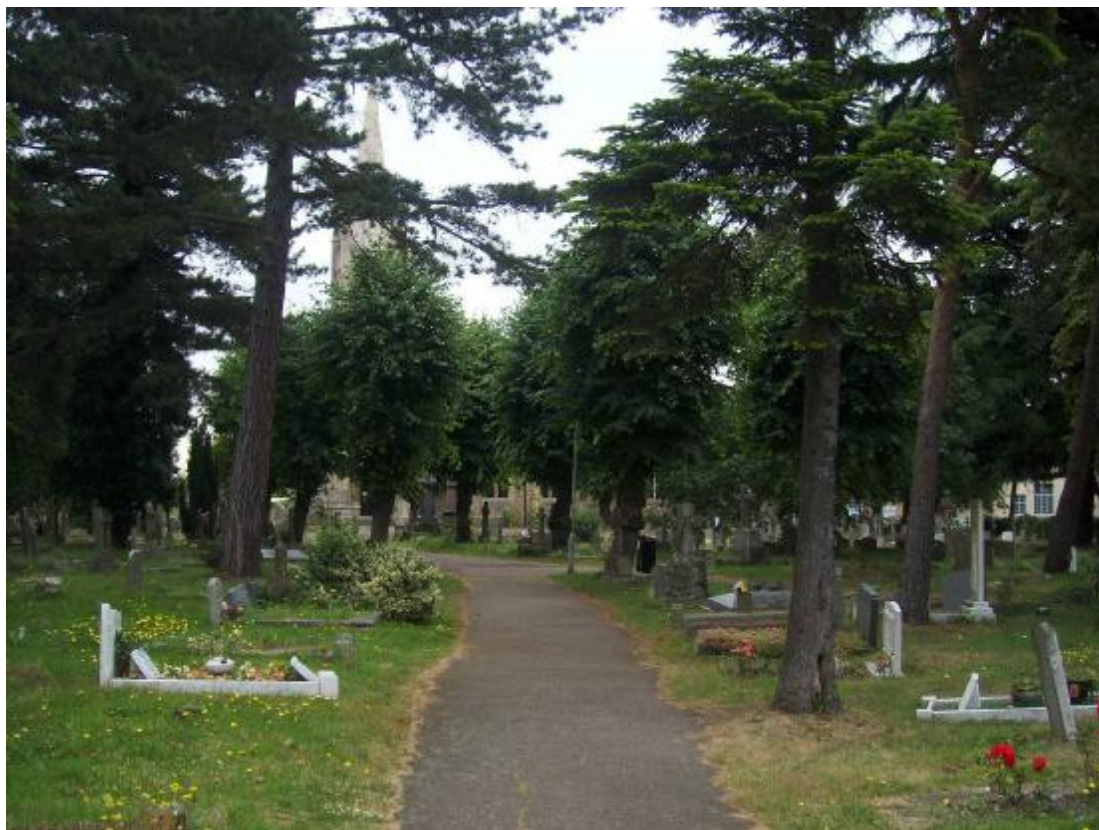
St John The Baptist Church, Site CG1