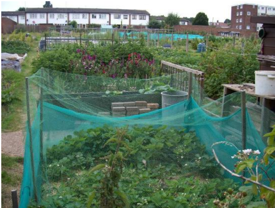
Hornbeam Road Allotment, Site AT2