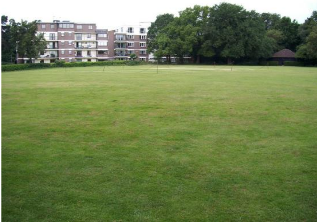
Buckhurst Hill Cricket Ground, Site FP8