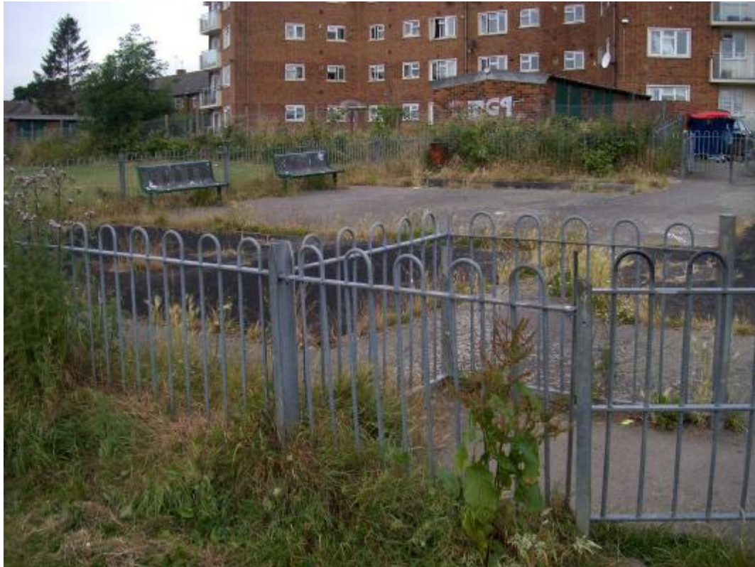
Roding Valley Playing Fields Playground South, Site CY2