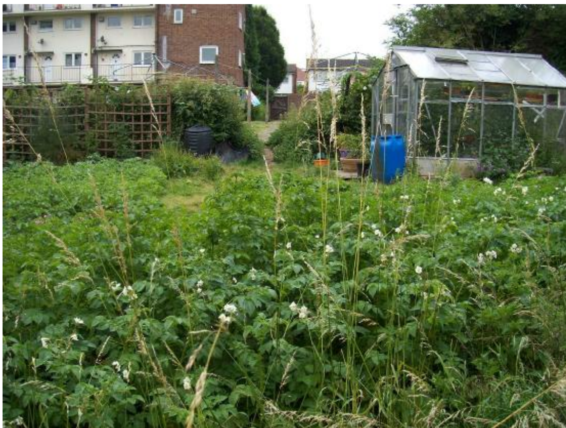
Hornbeam Close Allotment, Site AT3