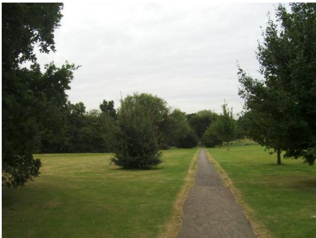
Roding Valley Playing Fields, Site RG1