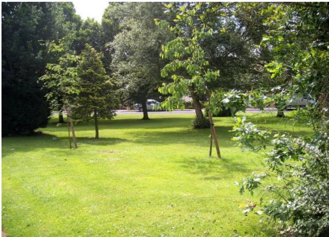
Land Surrounded By Brook Rise, Site MO11

10.15 This is an attractive area of amenity green space, which is clean and tidy, and is clearly very well preserved. It is entirely surrounded by Brook Rise, with houses situated beyond the road. It is predominantly grass land, featuring a significant quantity of medium sized trees and bushes.