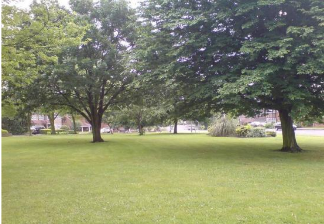
Land surrounded by Lee Grove, Site MO3

trees and a number of planted areas spread all over, adding significantly to its visual amenity. Two metal benches can be found to the south, facing Chigwell Rise, although no bins have been provided with them. Overall, the site is clean, tidy, smart in appearance, and evidently very well looked after.