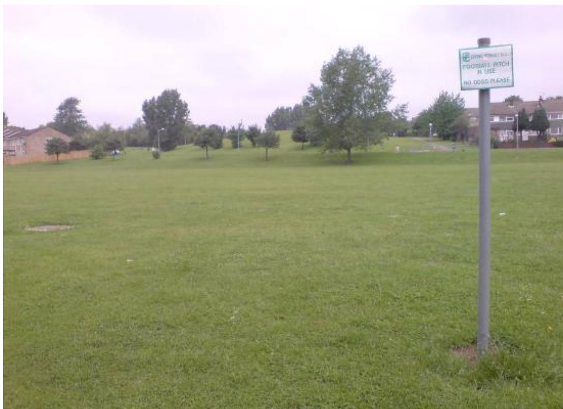
Land to the south of Copperfield, Site FP1