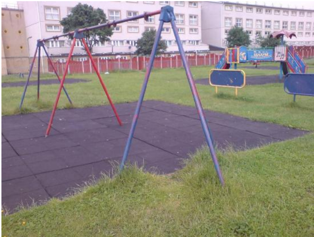
Limes Farm Playground, Site CY2