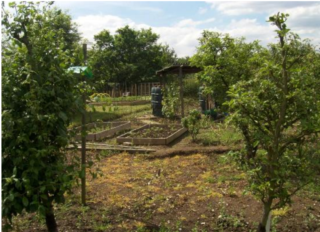
Gravel Lane Allotment, Site AT2