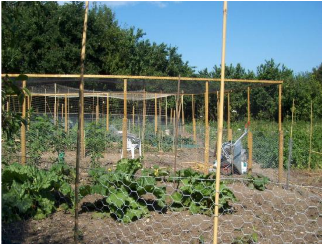
Vicarage Lane Allotment, Site AT3

Vicarage Lane would highlight the presence of the site to outsiders and increase the risk of people trespassing onto the site.