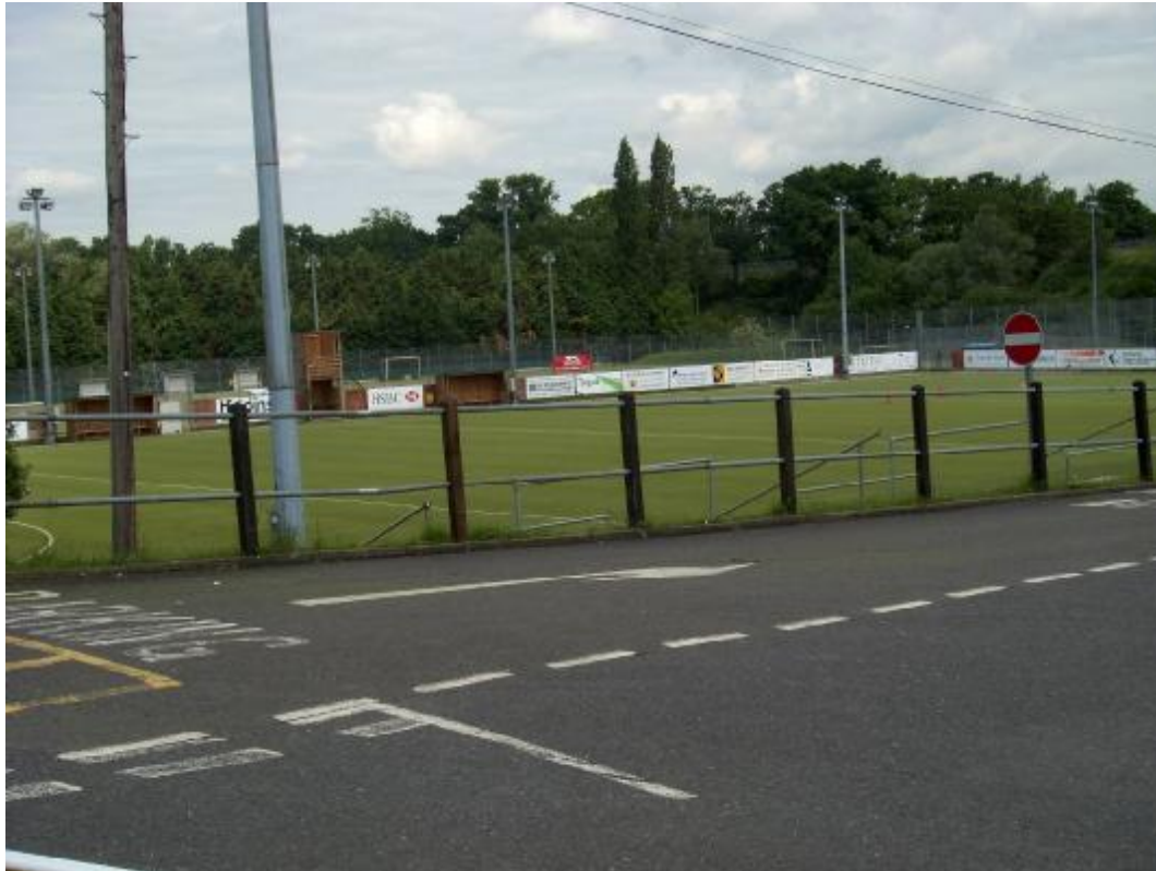
Old Loughtonians Hockey Club, Site FP3