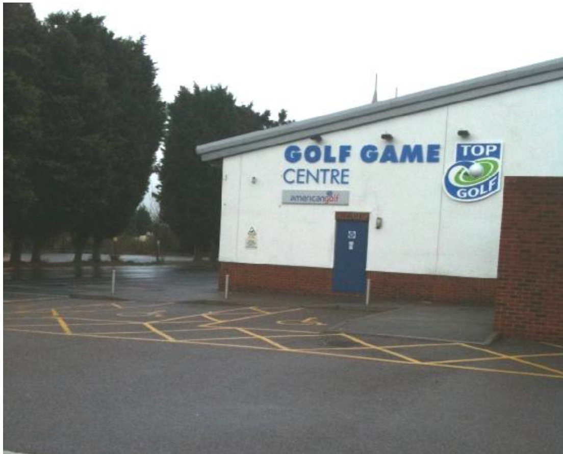
Top Golf, Site AS6