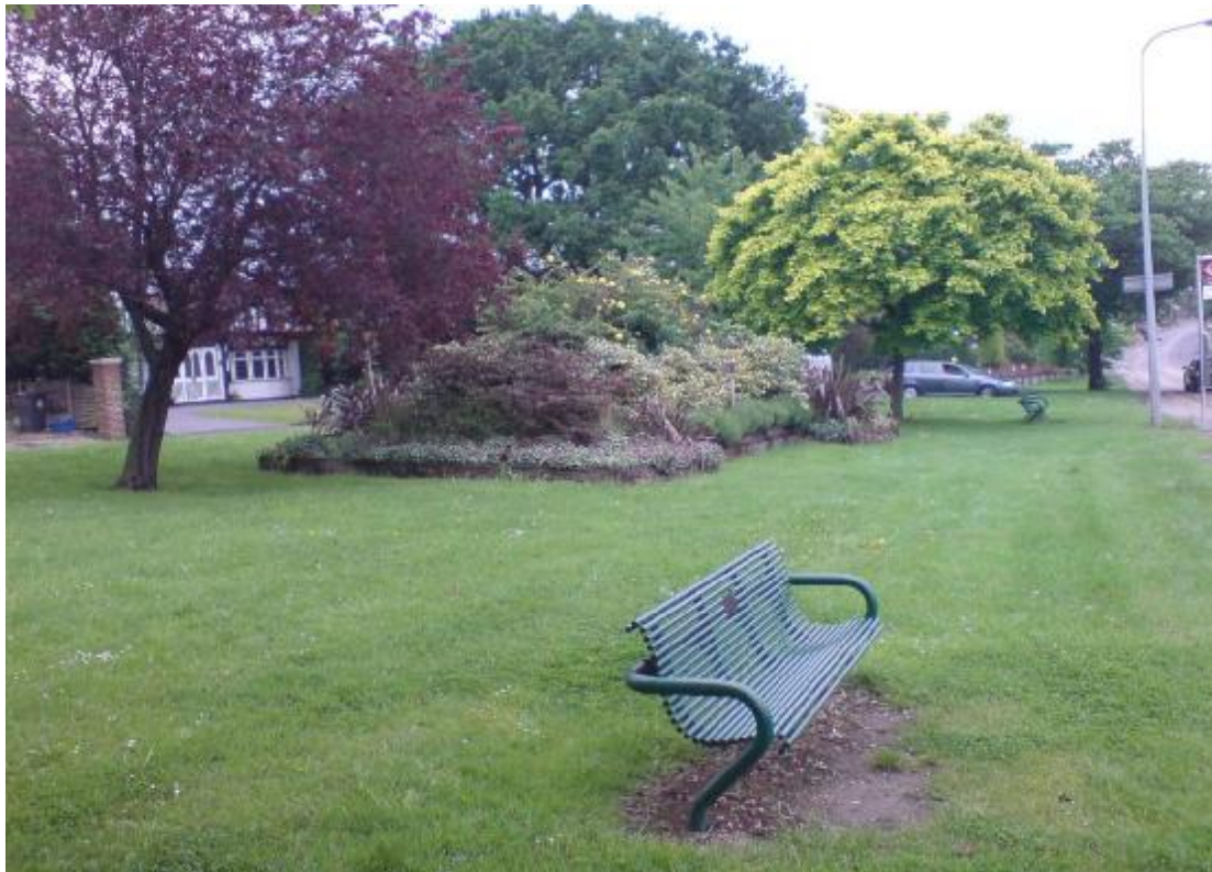
Land east of the junction between Manor Road and Hainault Road, Site MO7