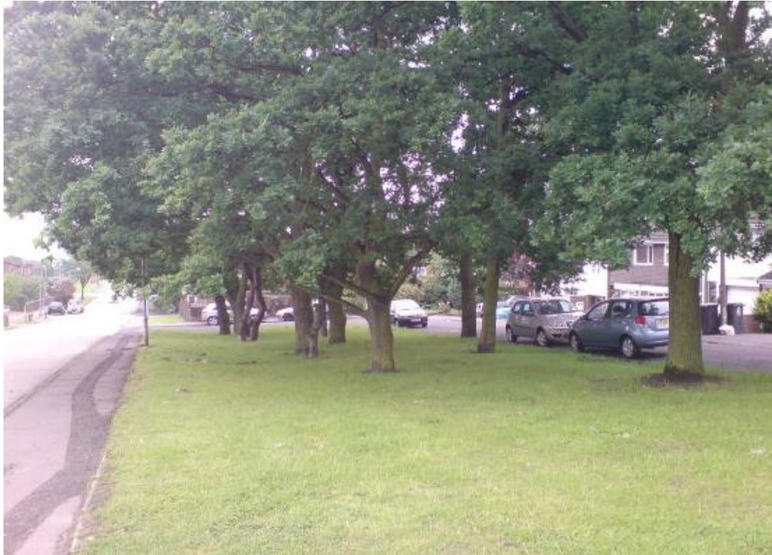
Land Surrounded By Limes Avenue, Site MO7