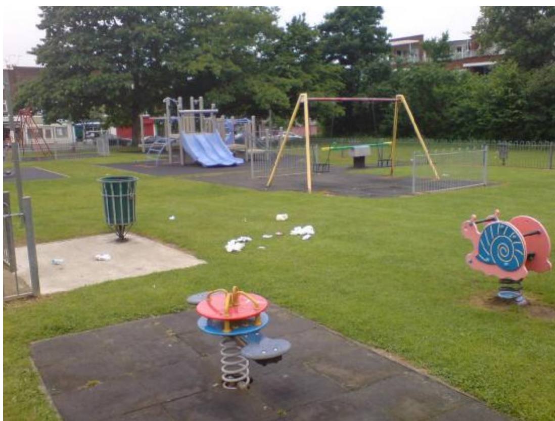
Chigwell Station Green Playground, Site CY1