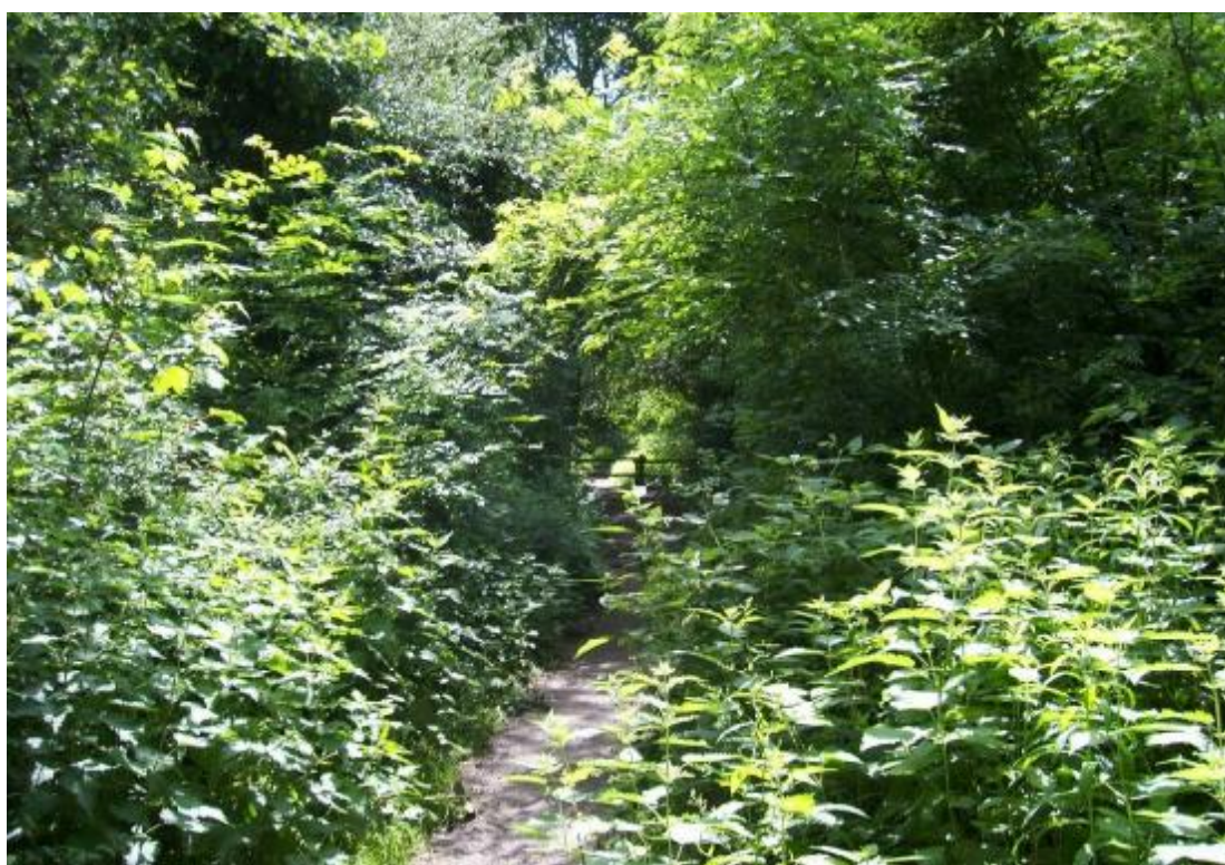
Chigwell Row Wood, Site SO1