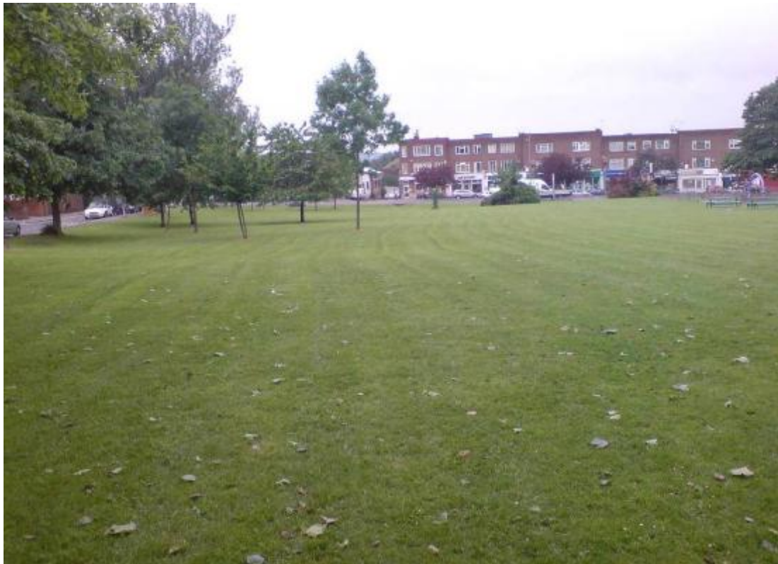
Chigwell Station Green, Site MO1