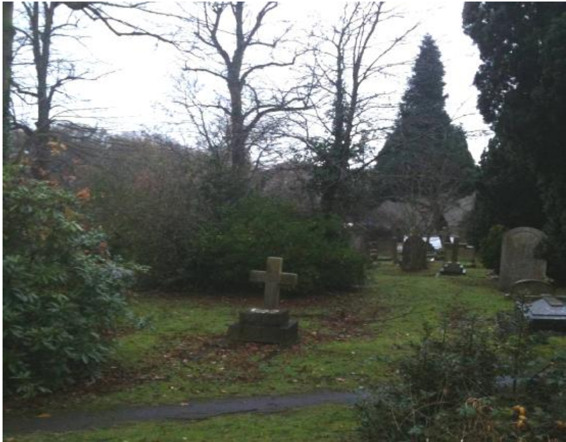
All Saints Church, Site CG3