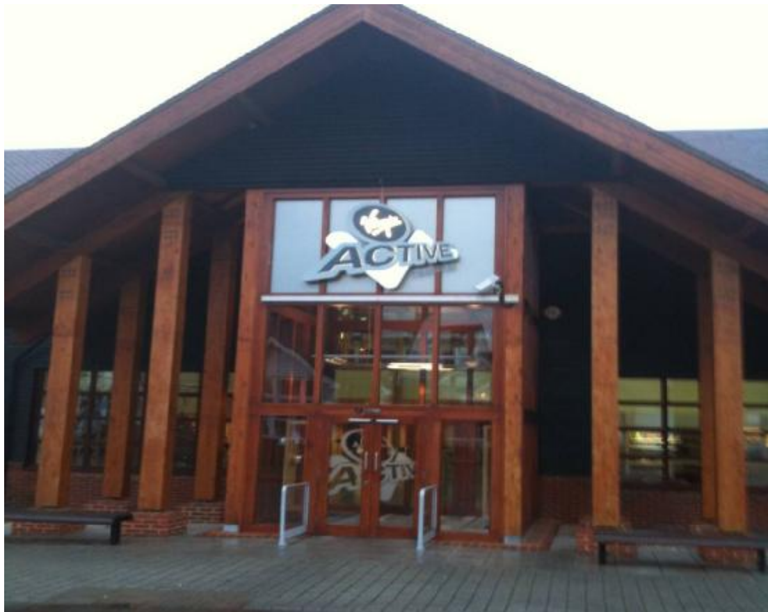
Virgin Active Health Club, Site IF2