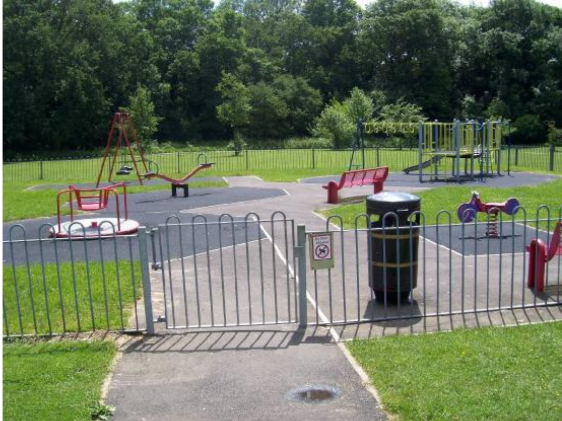
Chigwell Row Recreation Ground Playground (CY3)

need of removal or replacement. No seating is provided, and the two bins present are very worn. Evidence of litter and graffiti can be seen all over the playground, detracting further from its overall visual amenity, which is already relatively poor.