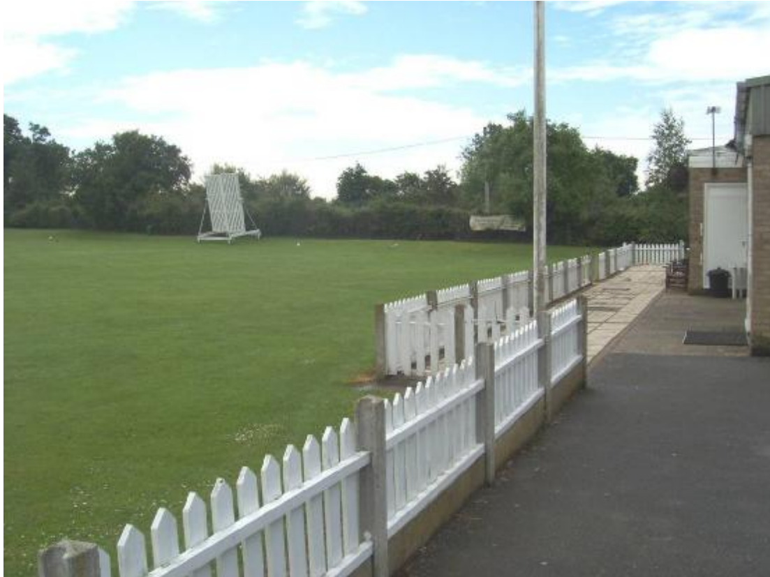
Fives and Heronians Cricket Club, Site FP2

reasonably high amounts of litter and dog excrement which are present. This issue is exacerbated further by the fact that all of the bins along the site's border with Copperfield have been badly vandalised and are in need of replacement.