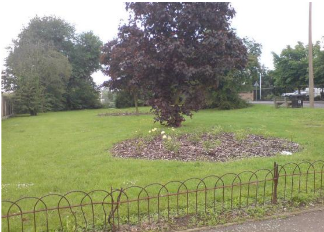
Land south of the junction between Manor Road and Millwall Crescent, Site MO10