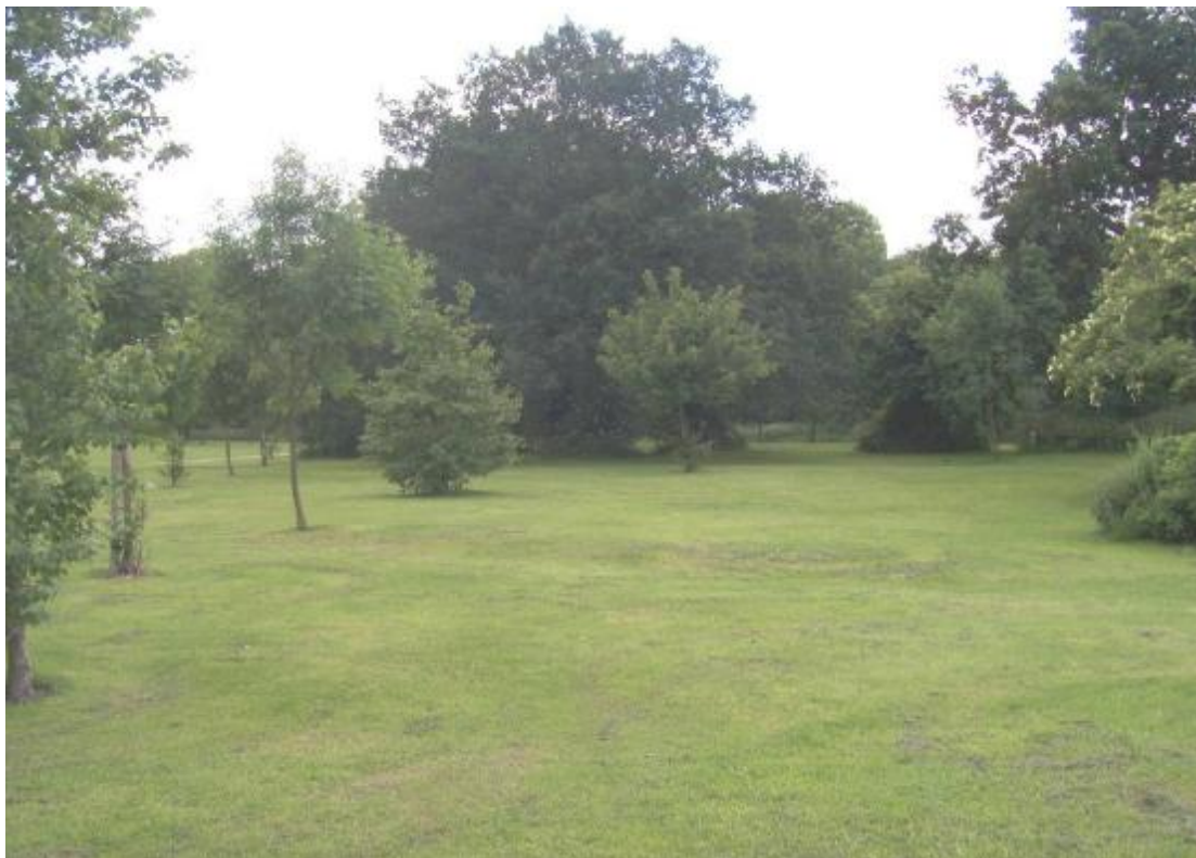
Chigwell Row Recreation Ground, Site FP5