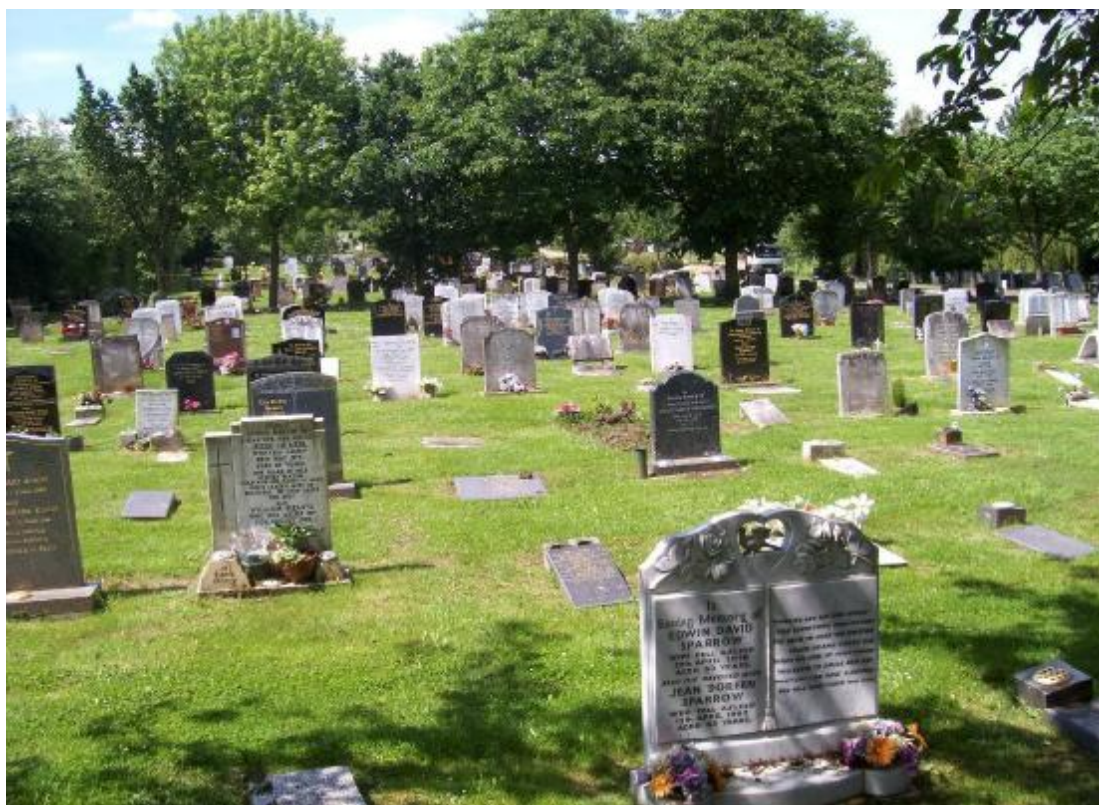
Chigwell Cemetery, Site CG1