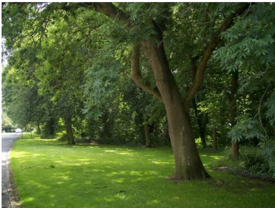
Land between Brook Way and Barnaby Way, Site SO2