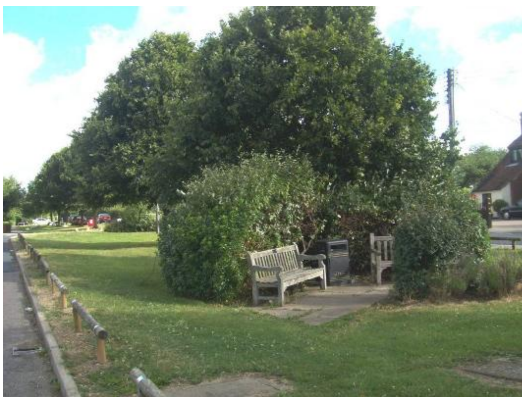
Epping Green Village Green, Site MO1