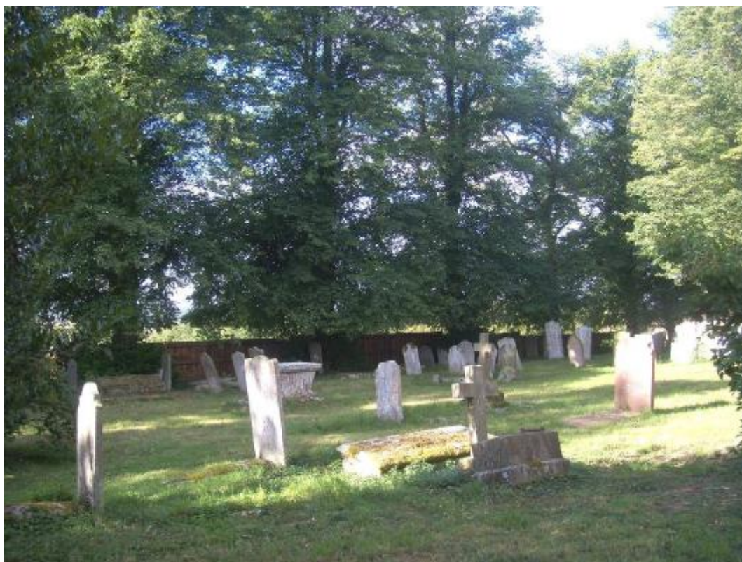
Epping Upland All Saints Church, Site CG1