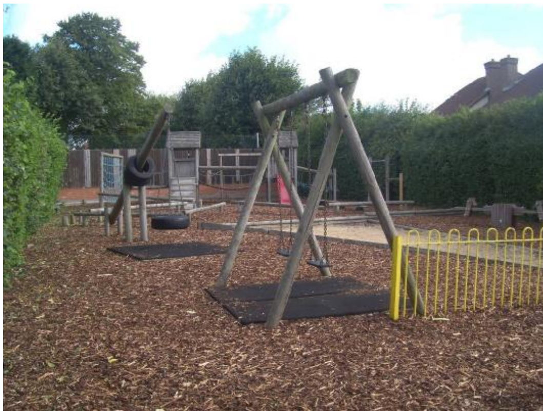
Epping Upland Playground, Site CY1