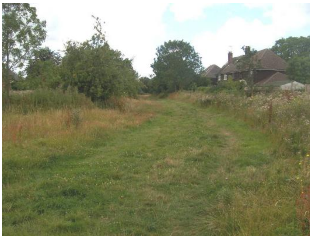
Epping Forest (Long Green), Site SO1