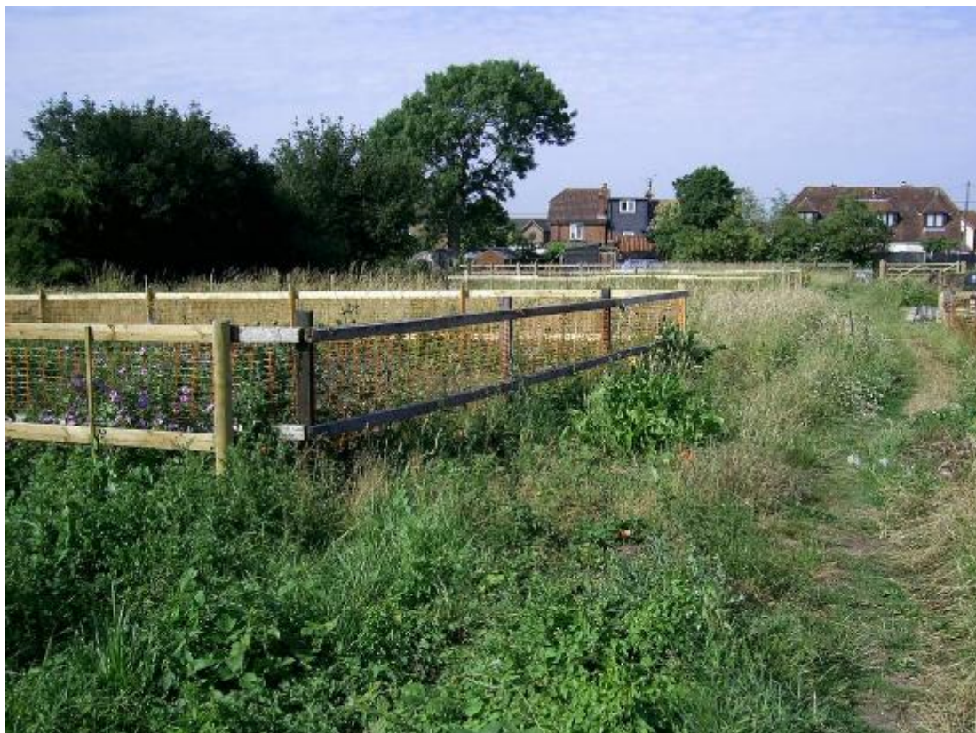
Epping Green Allotment, Site AT1