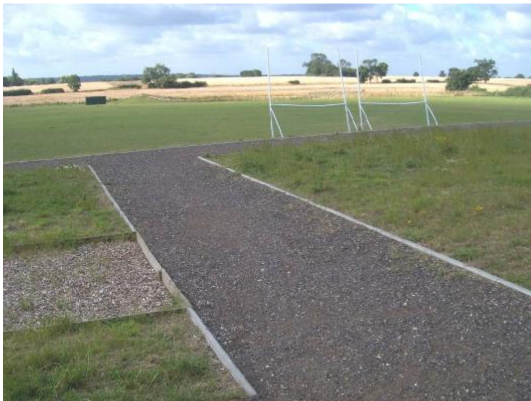
Doorstep Green, Site FP1