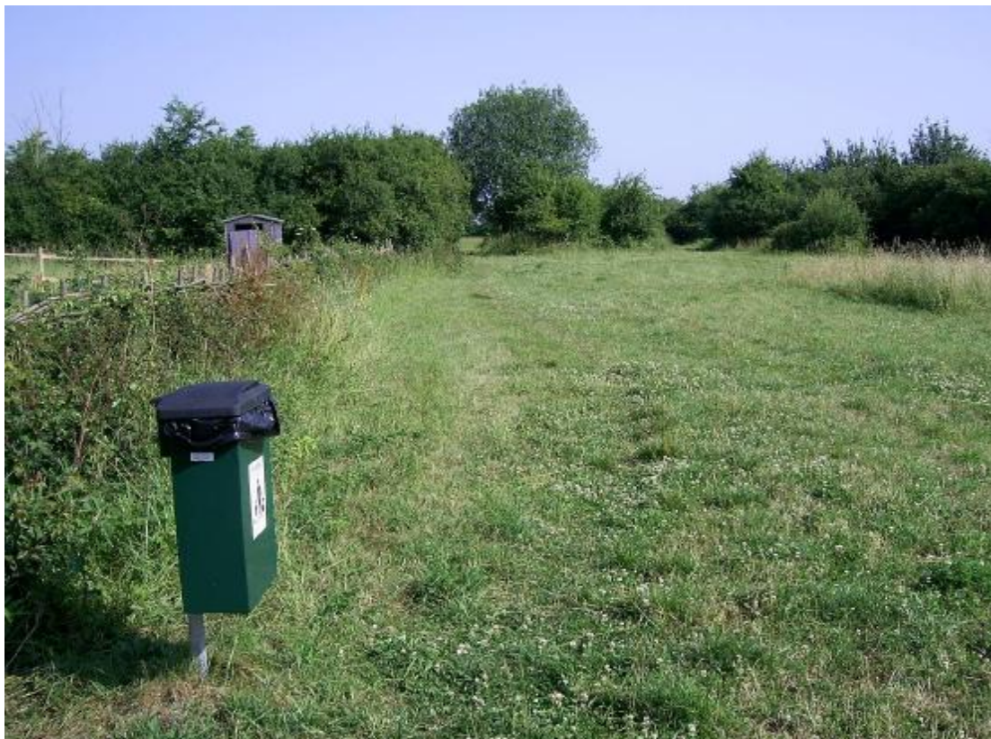
Millennium Garden, Site SO2