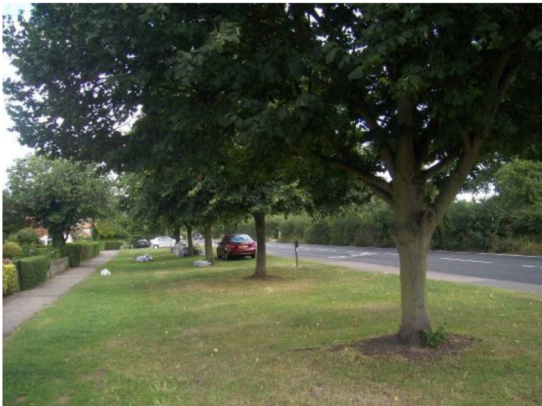
Land to the south east of Elm Close, Site MO2