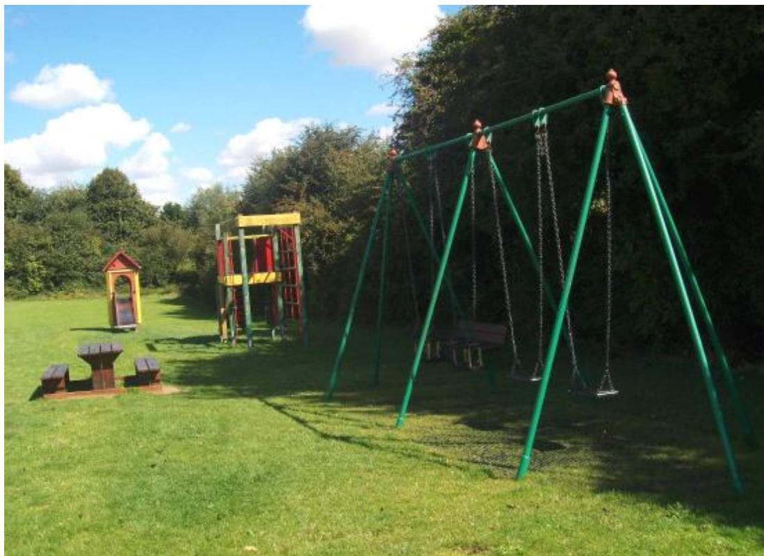
Fyfield Sports Field Playground, Site CY1