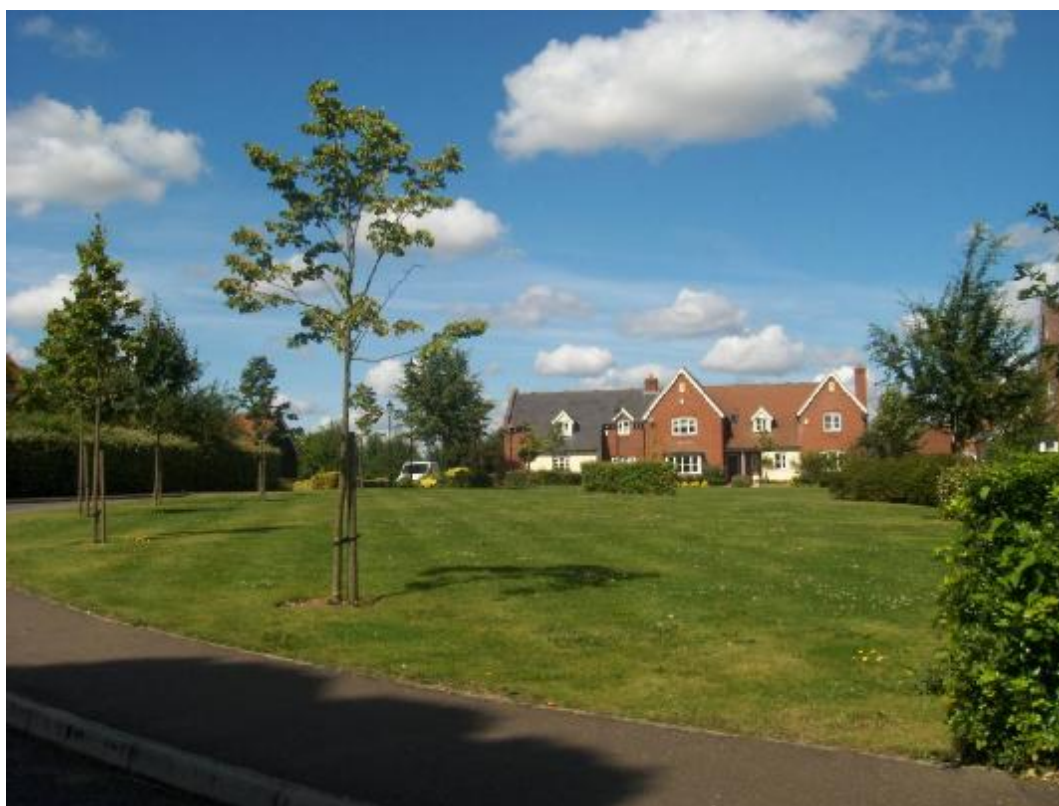
Land to the north of Elmbridge Hall, Site MO1

10.0 This area of amenity green space lies along Forest Drive to the north of Elmbridge Hall. It is predominantly grassy, with a number of young trees lining the southern perimeter. A few small hedgerows are scattered throughout, predominantly to the north and centre. The site is easily accessible, thanks to several hard surfaced pathways which surround and bisect it. The site is tidy, clean and clearly well maintained, although given its relatively small size and proximity to the roadside, it is only really suitable for informal use. It is nonetheless, a very pleasant area to look upon.