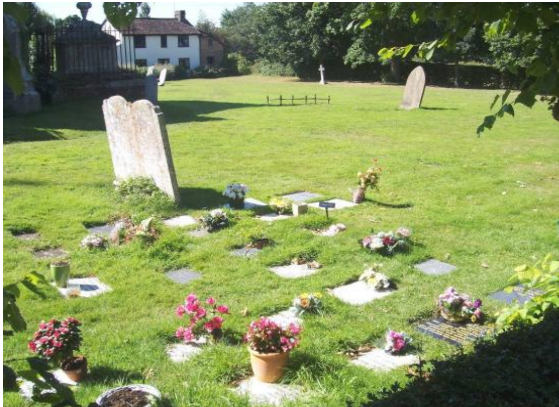
St Nicholas's Church, Site CG1