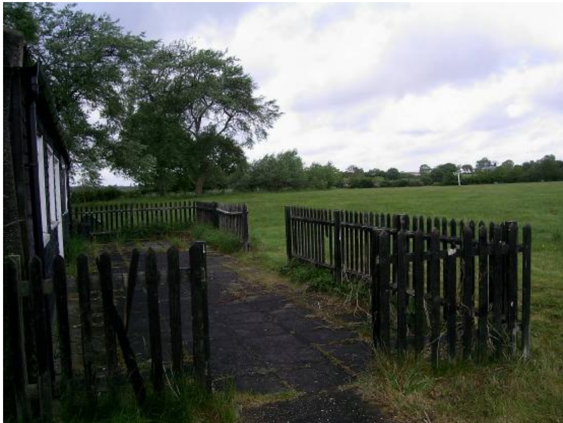
Elmsbridge Open Space, Site RG1