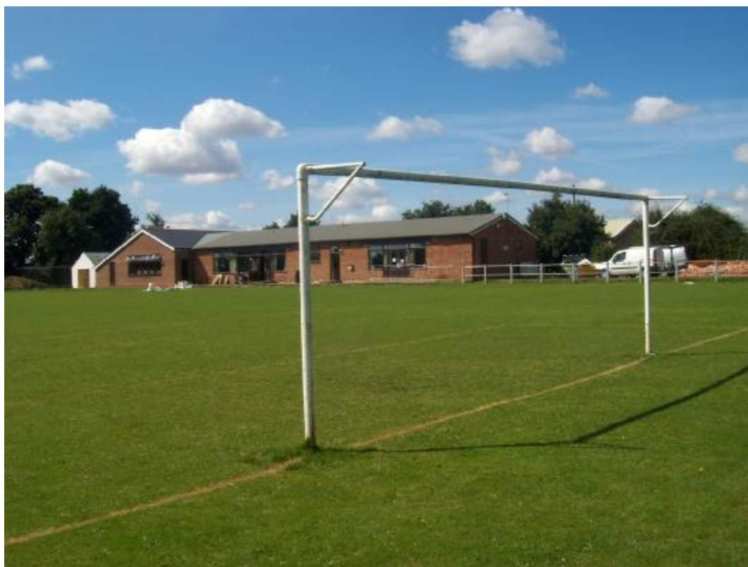
Fyfield Village Hall, Site CV1