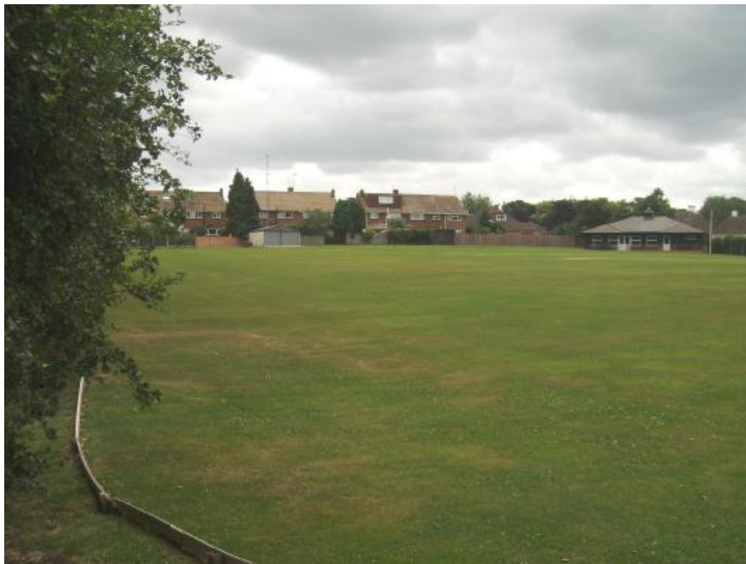
Abridge Cricket Club, Site FP1