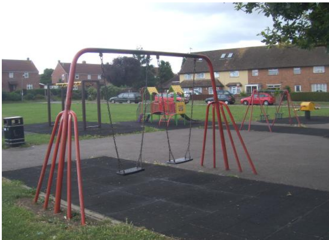
Abridge Playground, Site CY1