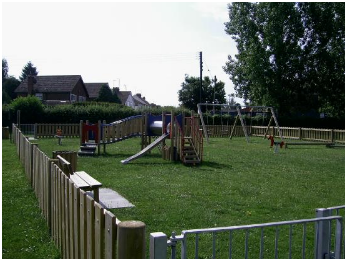
Abridge Village Hall Playground, Site CY2