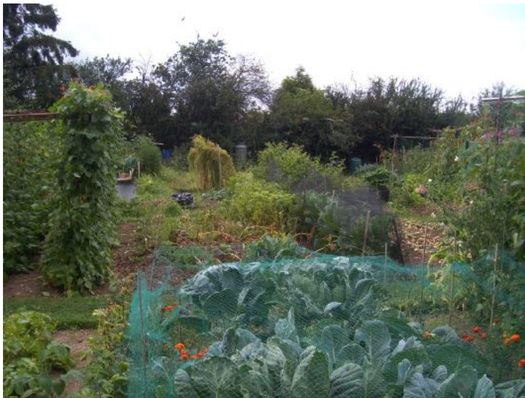
London Road Allotment, Site AT1