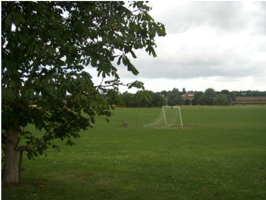
Abridge Playing Field, Site FP2