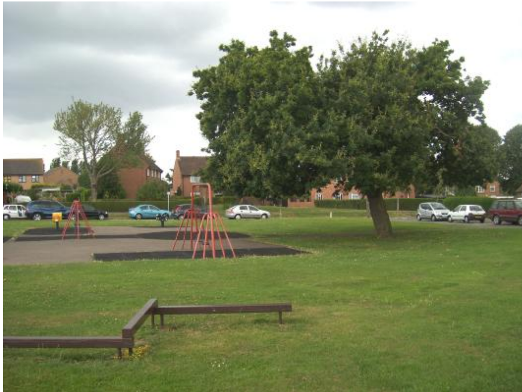
Land Surrounded by Pancroft, Site MO1