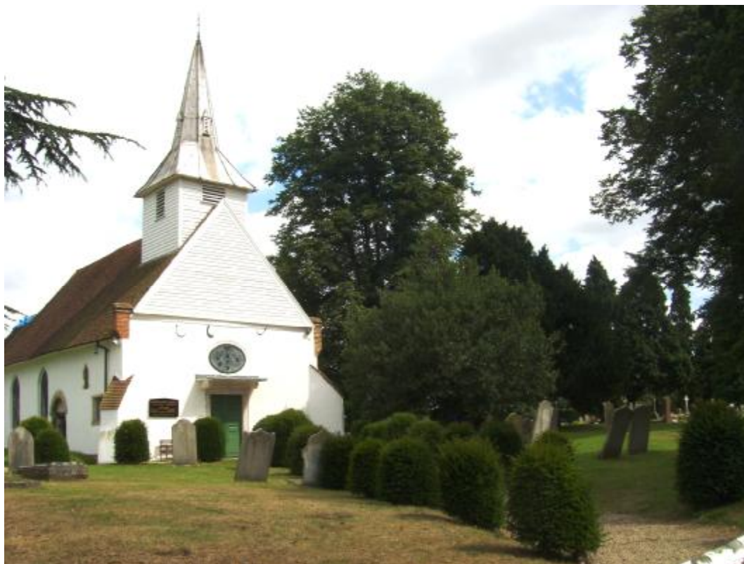
St Mary and All Saints Church, Site CG1