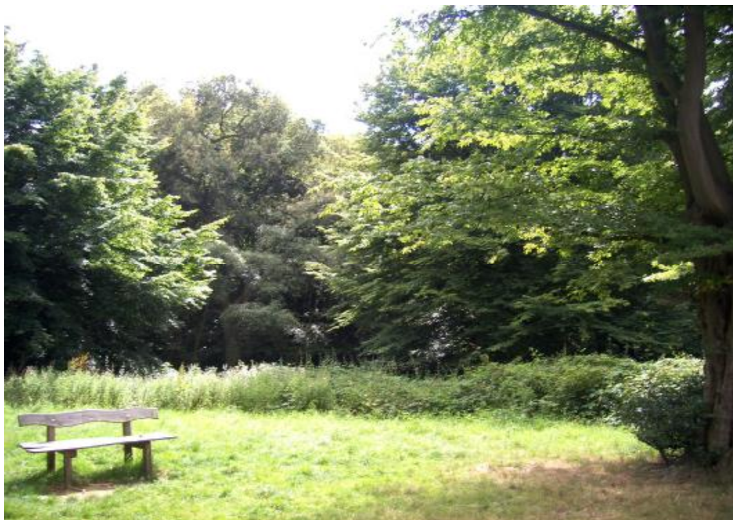
Hainault Forest Country Park, Site SO1