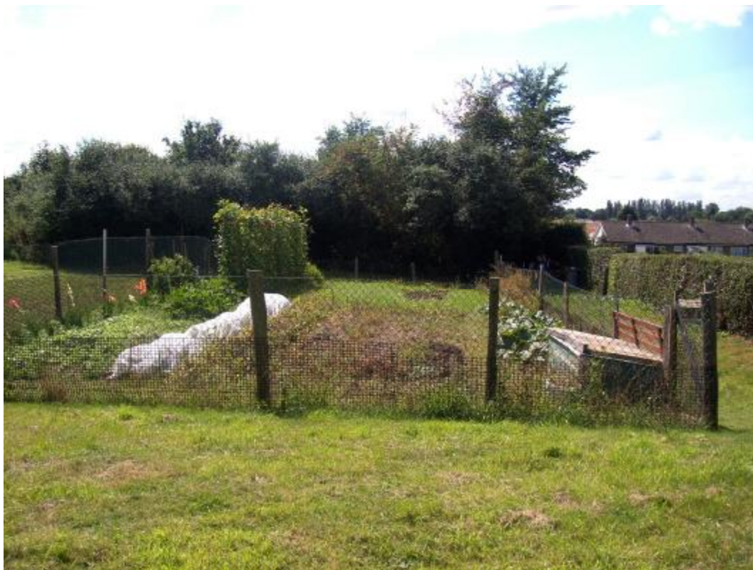
Garden Field, Site AT1