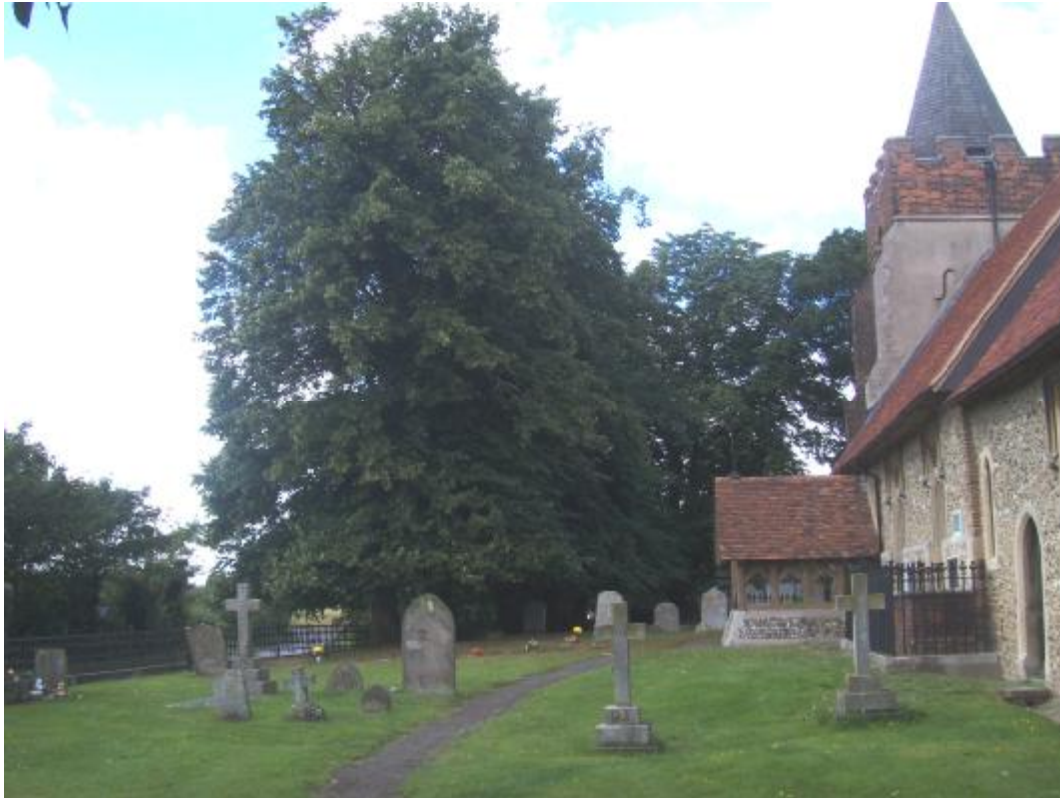
All Saint's Church, Site CG3