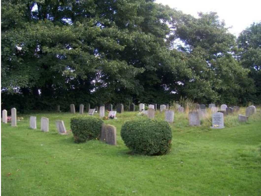
St Mary Magdalen's Church, Site CG4