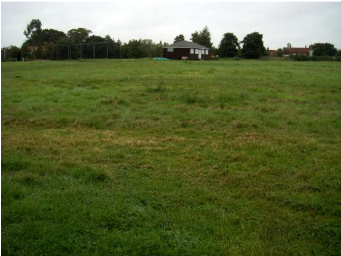
Matching Green, Site MO2

10.3 These vehicle movements are clearly having a degrading effect on the site as some of its edges have been very badly cut up. Managing this issue seems potentially difficult however as there appears to be little room around the green for locals and site users to park their cars. As a result therefore, finding a solution to this issue may be potentially difficult.