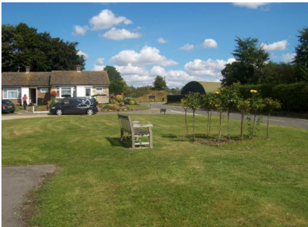
Land to the east of the Hoppitt, Site MO1