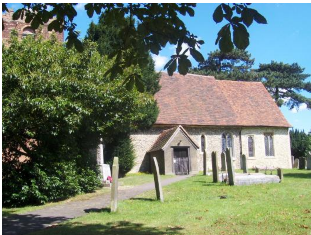
St Mary's Church, Site CG1