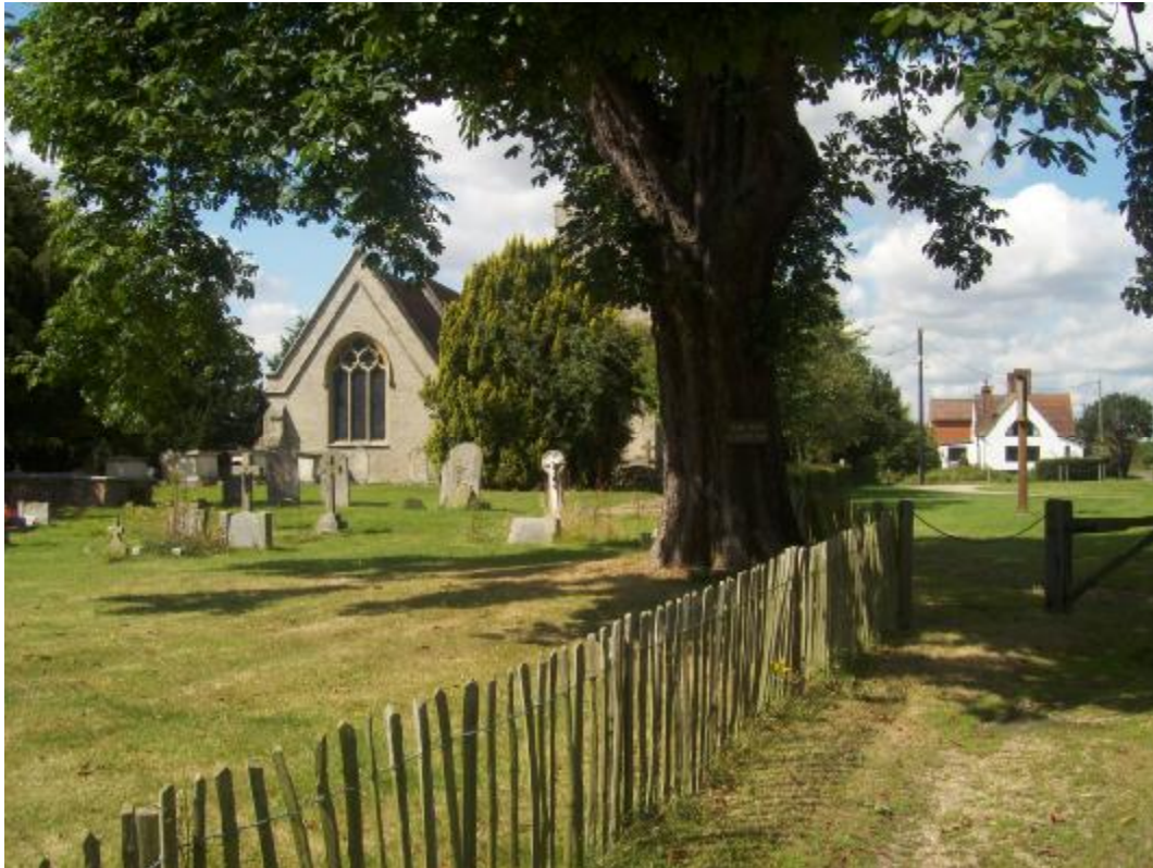
St Germain's Church, Site CG2