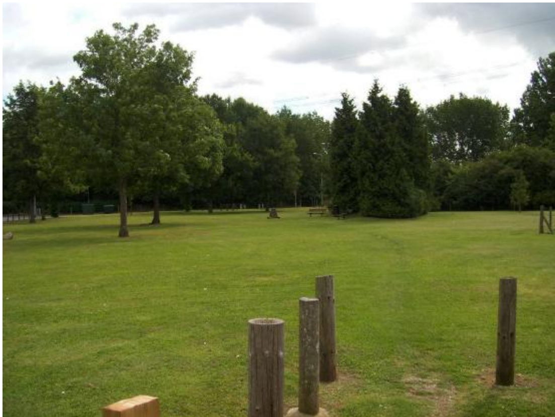
Land to the south of the Junction between Old Nazeing Road and Nazeing New Road, Site MO5