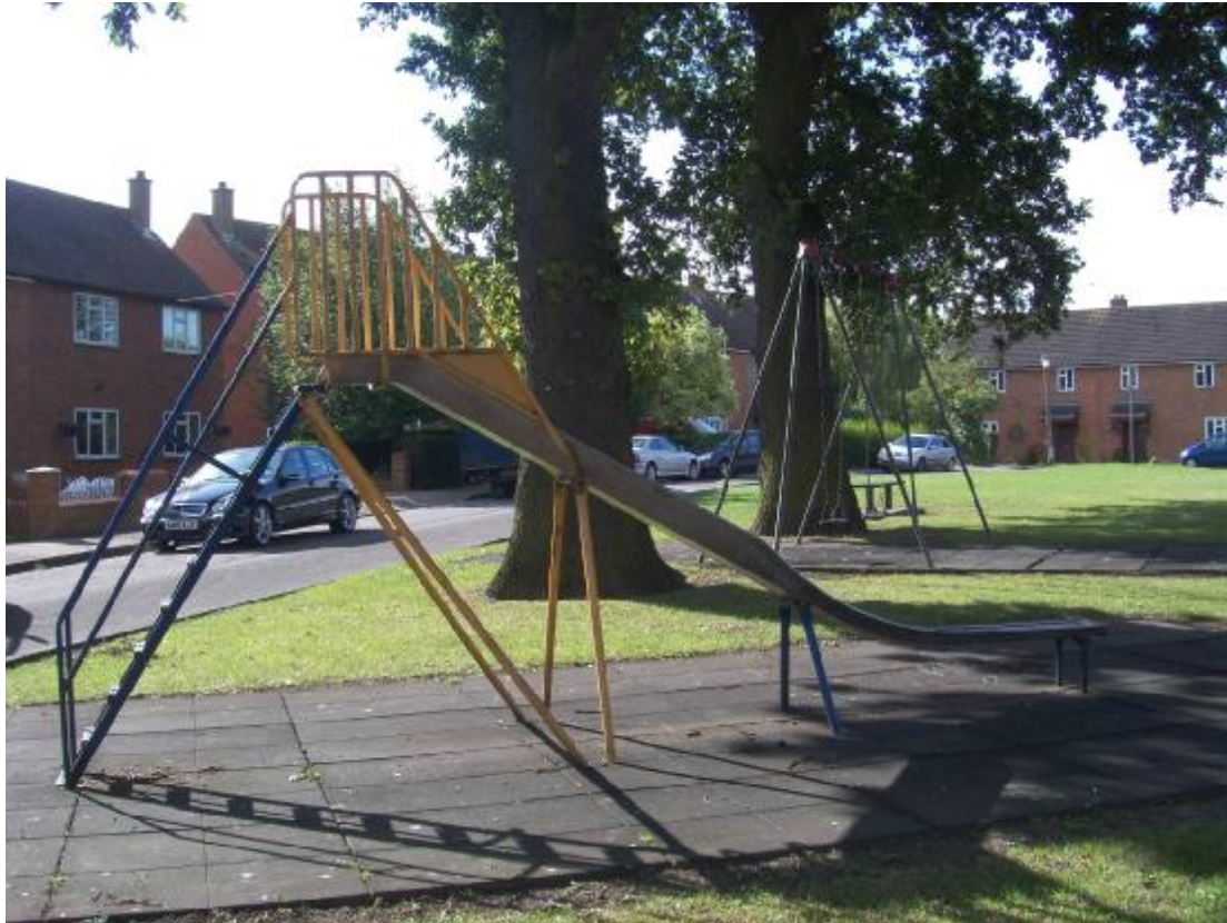
Pound Close Playground, Site CY3

some repainting. A number of trees beyond the eastern perimeter overlook the site, very much adding to the pleasant setting.