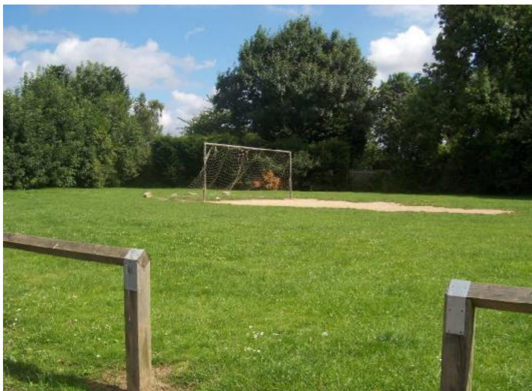
Hoe Lane Recreation Ground, Site RG1