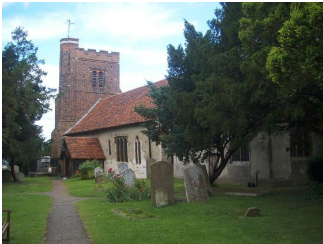
All Saints Church, Site CG1