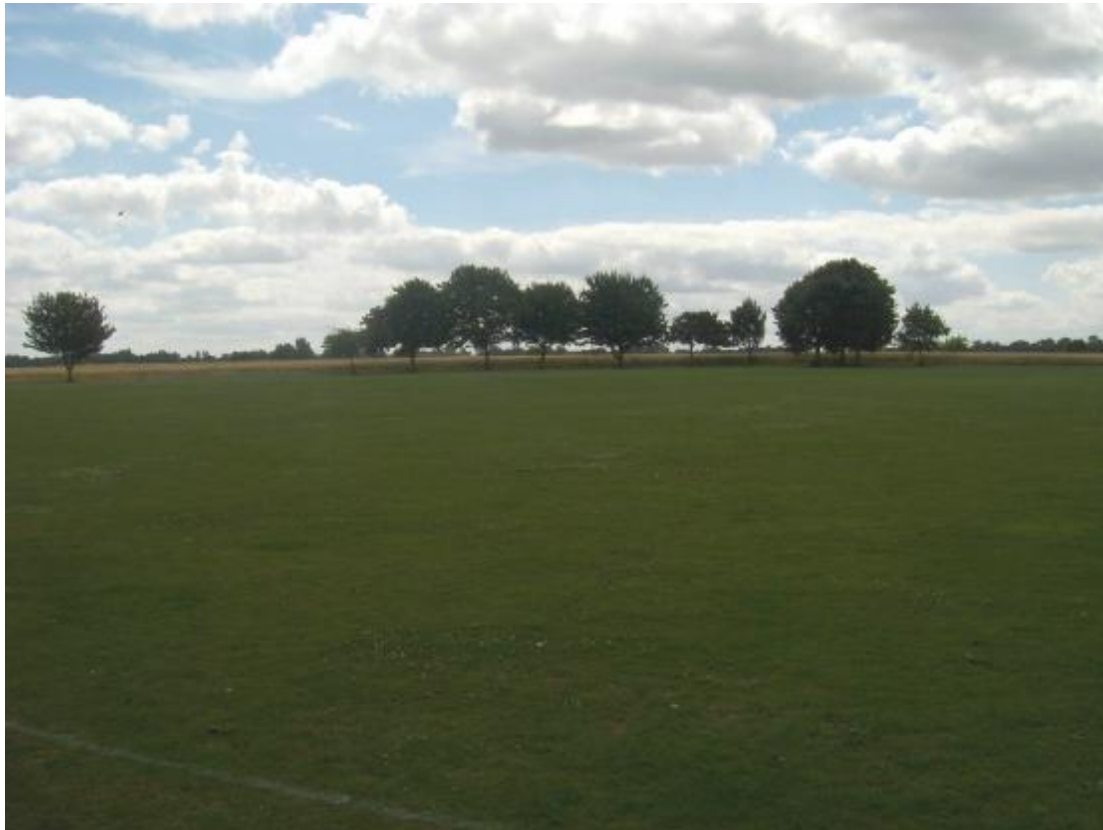
Nazeingwood Common, Site SO2

large quantity of grassland. Originally a part of Waltham Forest, the Common was subsequently deforested for pasture in the 13 th century. Up until 1940 the Common was still used for grazing as well as for recreational purposes, especially for playing golf. During the Second World War, the land was ploughed and used for growing food, as part the war effort. Today, all of these uses continue in some form, apart from golfing. There is now a separate golf club directly to the west (Nazeing Golf Club). The north western corner of the of the Common now hosts Nazeingwood Cricket Club.