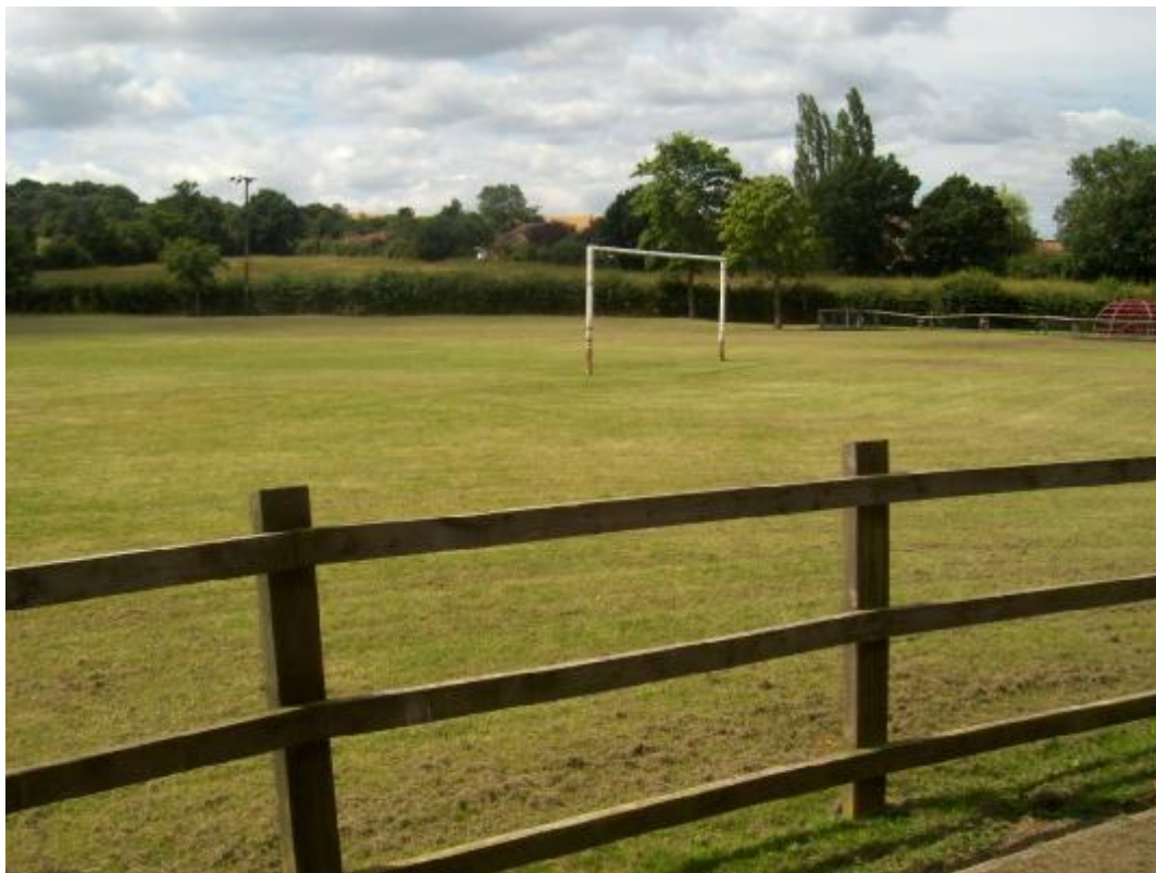
Nazeing Leisure Centre, Site FP2