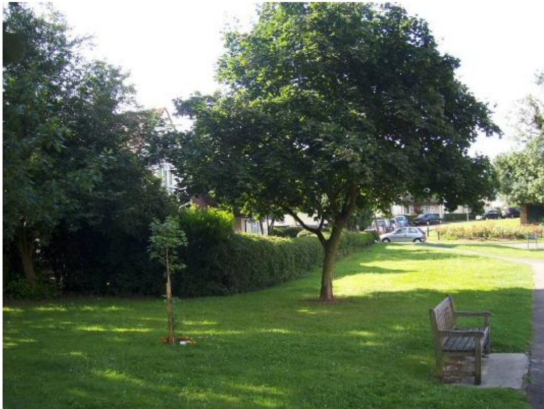
Land to the South East of Nazeing Road and St Leonards Road, Site MO2