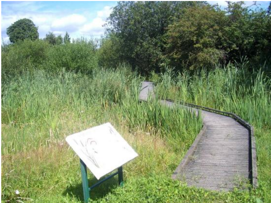
Nazeing Triangle Local Nature Reserve, Site SO6