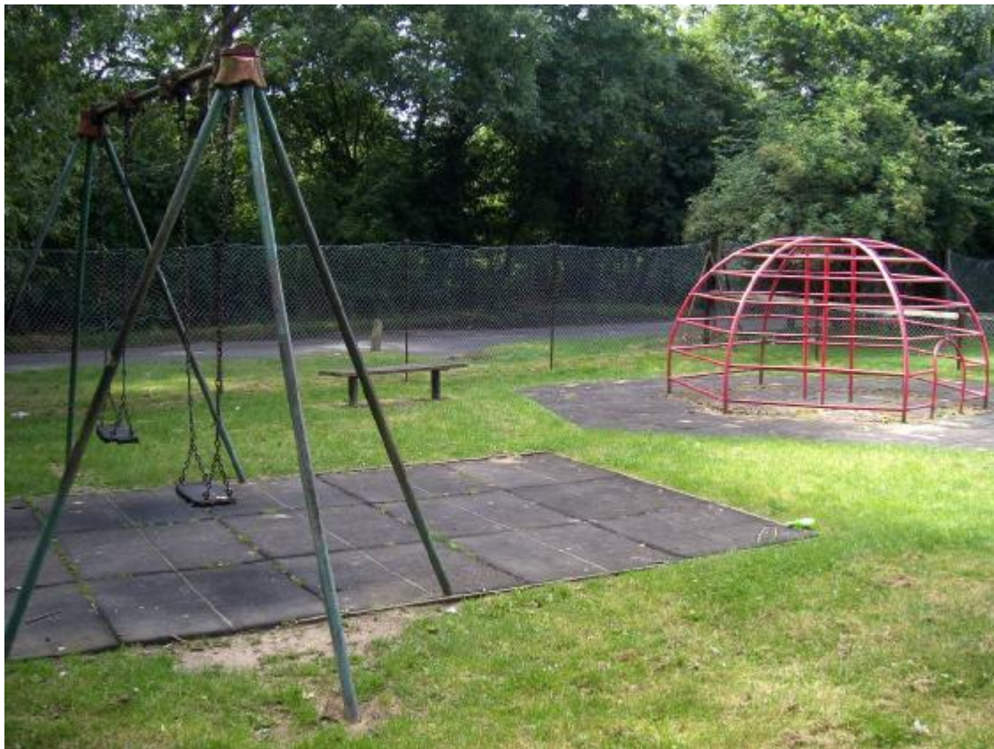
Hoe Lane Recreation Ground, Site CY2