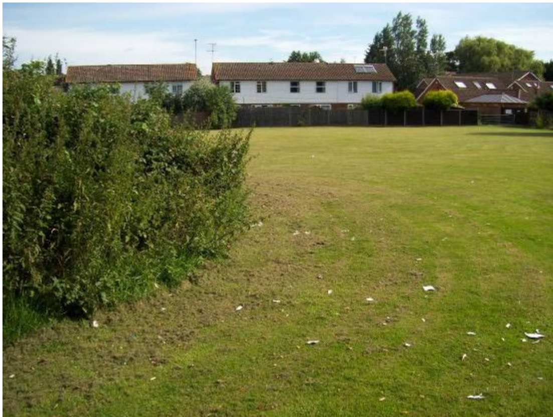
Lower Nazeing Recreation Ground, Site RG2