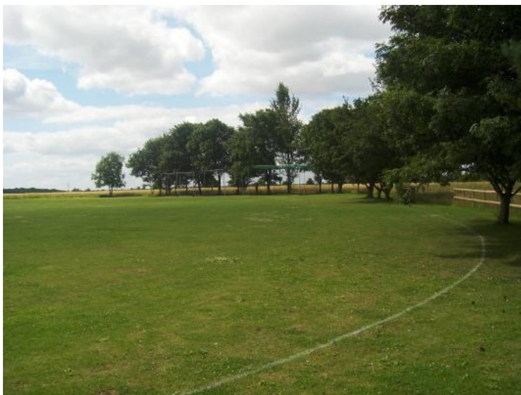
Nazeing Common Cricket Club, Site FP1