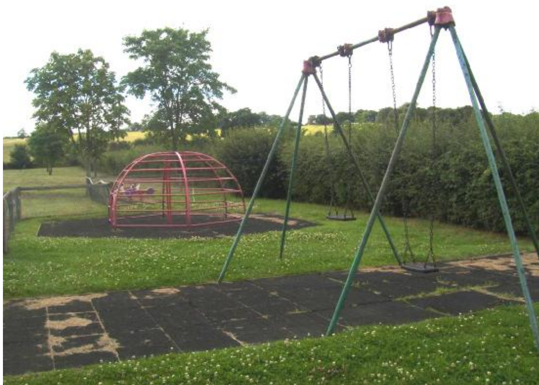
Nazeing Leisure Centre Playground, Site CY1