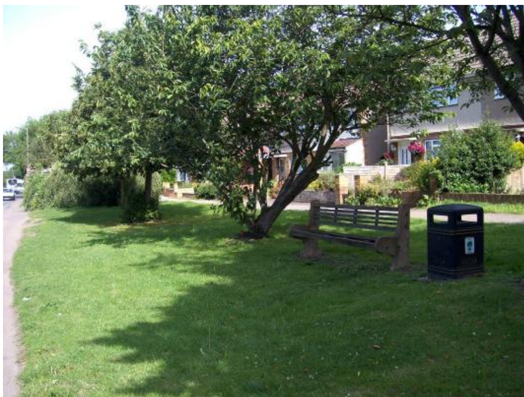
Land to the North of Nazeing Road, Site MO1