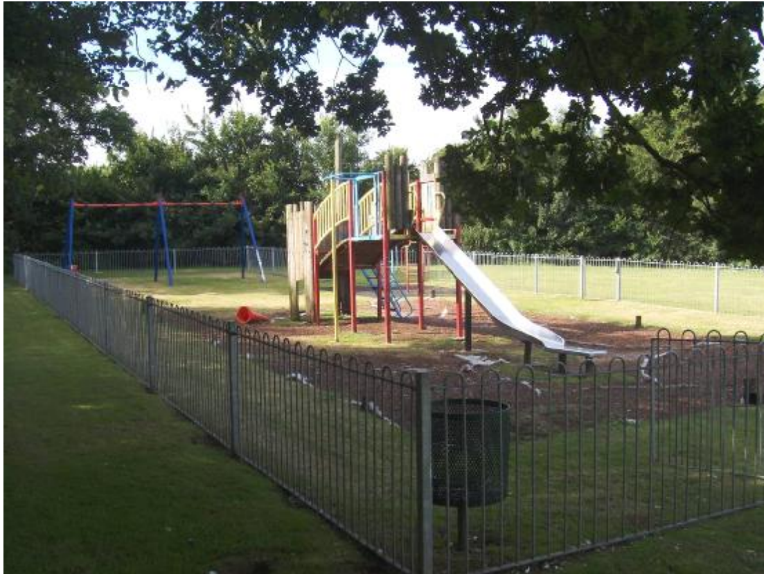
Lower Nazeing Recreation Ground Playground, Site CY4