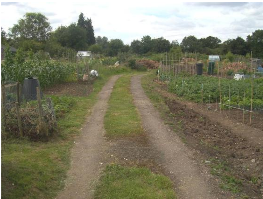
Middle Street Allotment, Site AT1