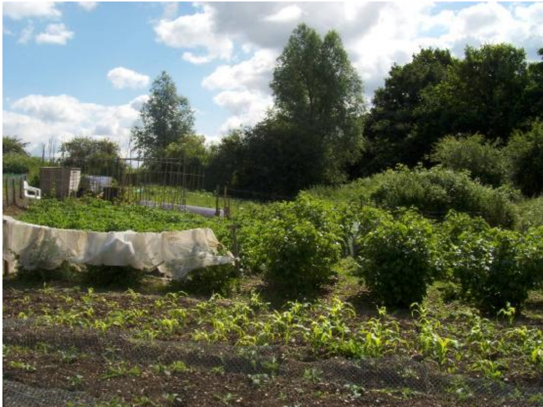
Castle Street Allotment, Site AT3