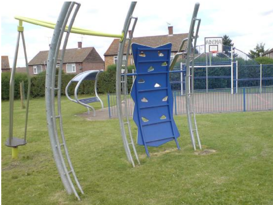
Shelley Park, Site RG2

cameras that have been installed here. The site as a whole is clearly very well tended, and plenty of seating, litter bins and dog waste bins have been provided. Clear and instructive information signs are present at the entrance. One small issue, however, regards the fact that the site is used by both children and dog walkers, this therefore is potentially dangerous and both groups must therefore both remain vigilant to avoid any potential accidents.