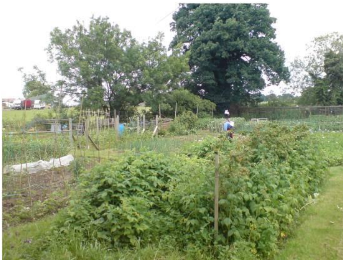
Moreton Road Allotment, Site AT1