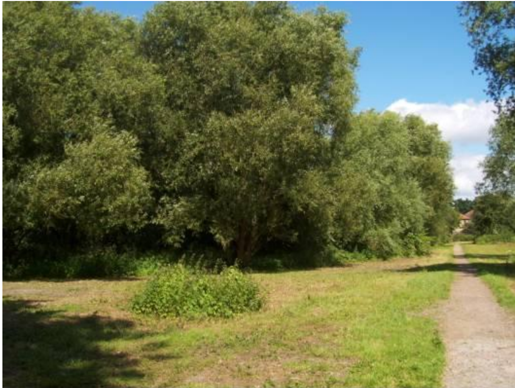
Cripsey Brook Nature Reserve, Site SO5