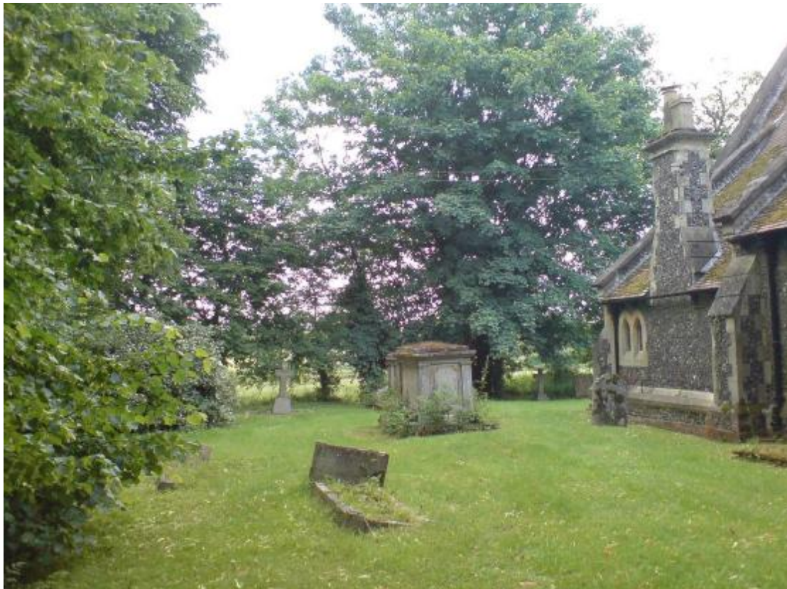
St Peter's Church, Site CG2