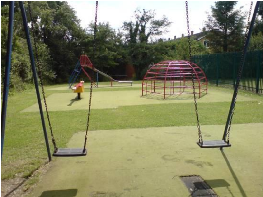
Greensted Road Playground (CY3)