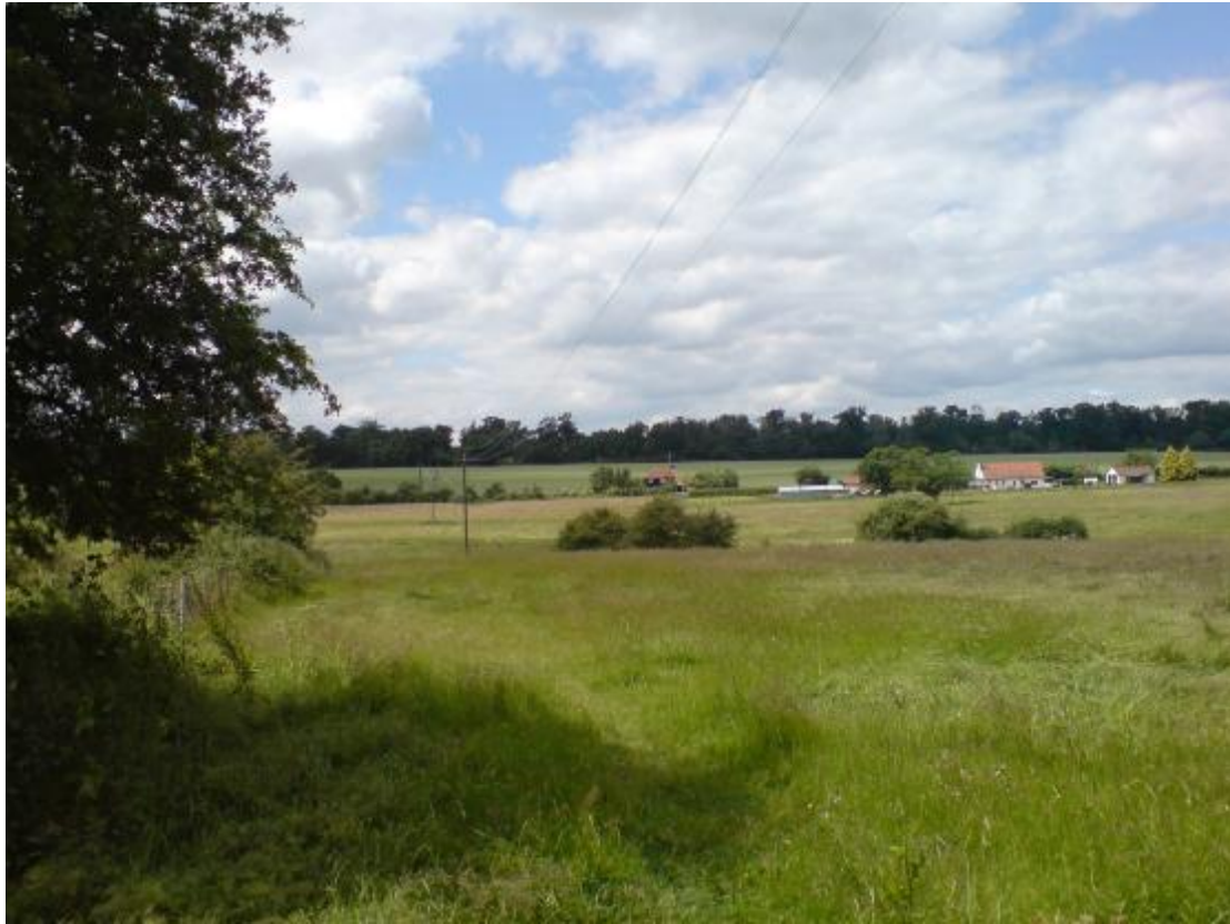
Shelley Common, Site SO1