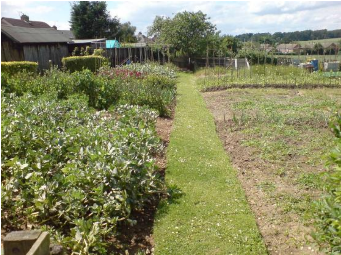
Moreton Road Private Allotment, Site AT2