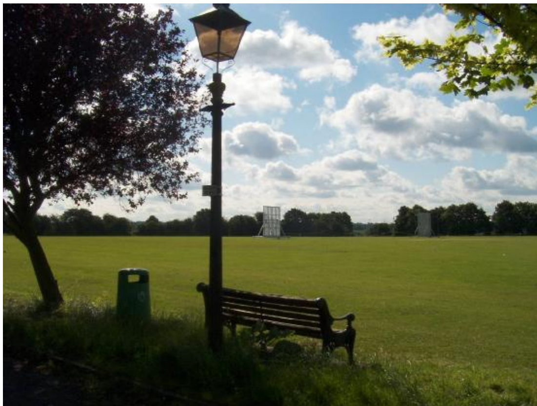
Ongar Sports and Social Club Sports Field, Site FP1