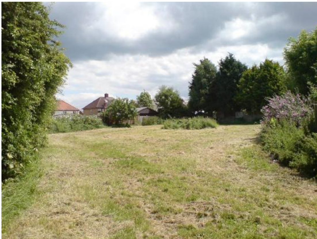
Land to the North of St Peter's Avenue, Site MO2