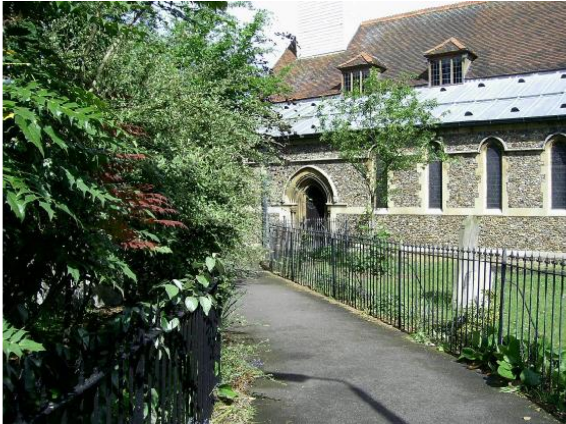
St Martin's Church, Site CG3

kept and offers good seating, with the only minor issue relating to the difficulty wheelchair and pushchair users may have using the footpaths.