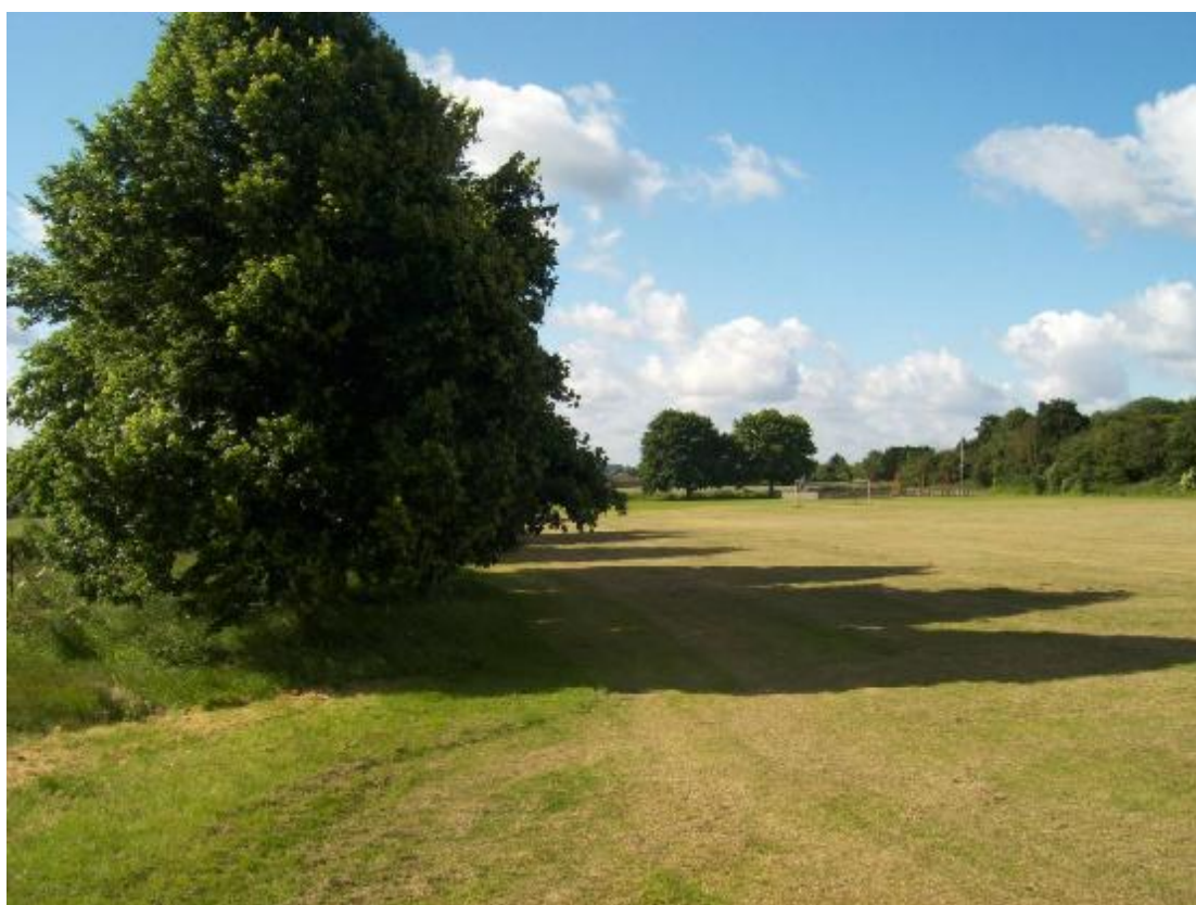
Love Lane Recreation Ground, Site RG1