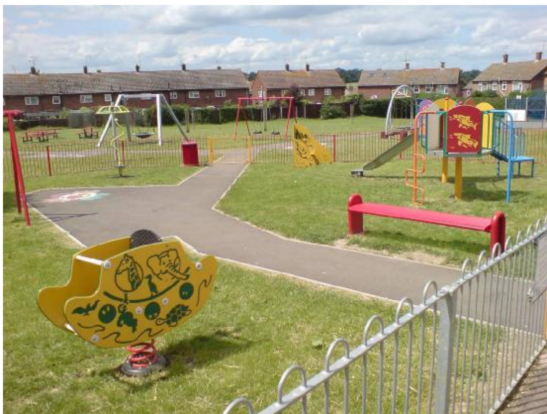
Shelley Park Playground, Site CY1