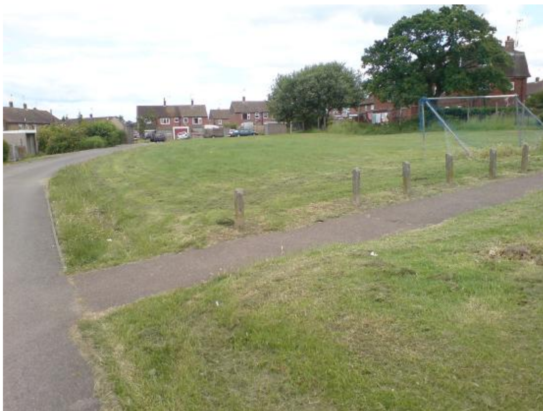
Land between Acres Avenue and Queensway, Site MO1