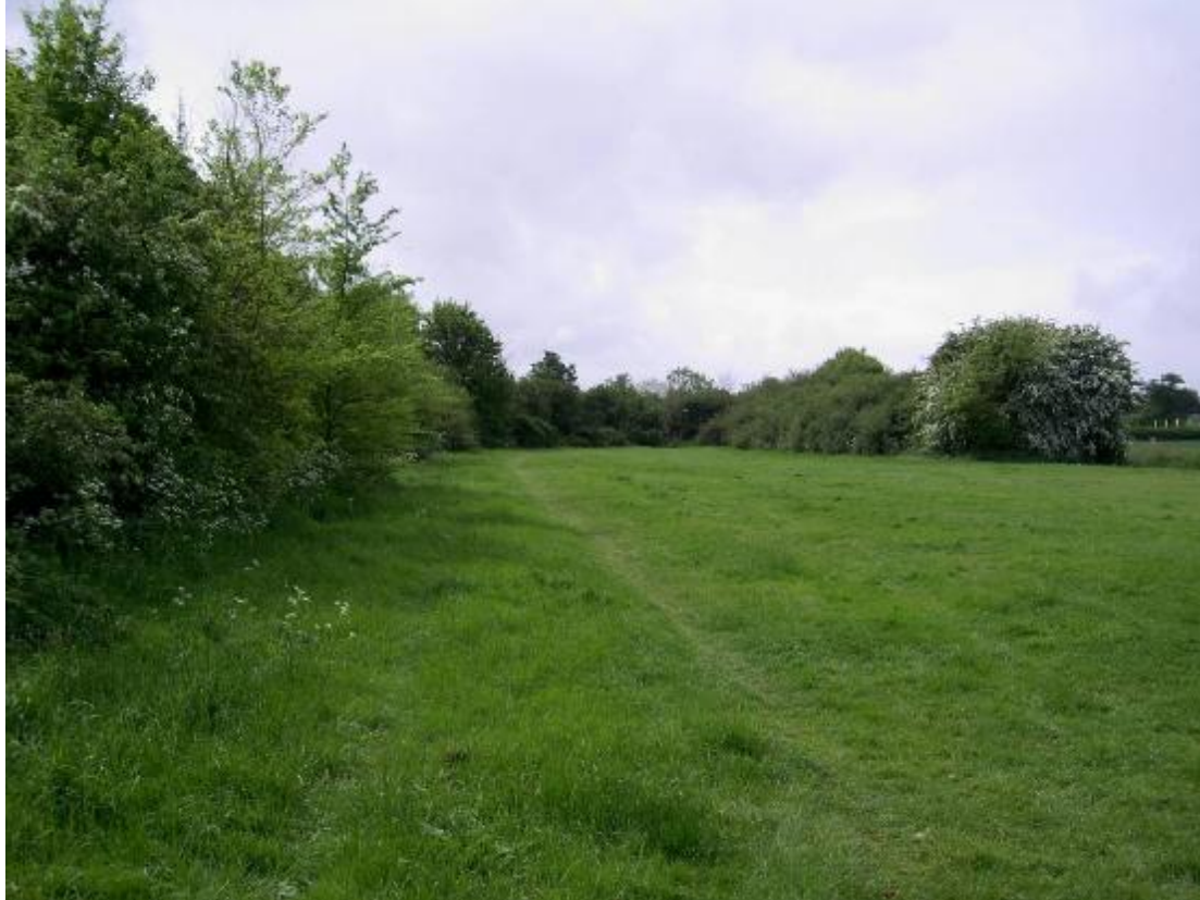
River Meadow, Site SO3

surface driveway runs directly along the south eastern side of the site allowing local residents access to the rears of their homes. As a result, locals and particularly children wishing to access this site must be vigilant when crossing this driveway and similarly when they reach Moreton Road where traffic speed limit increases from 30mph to 60mph.