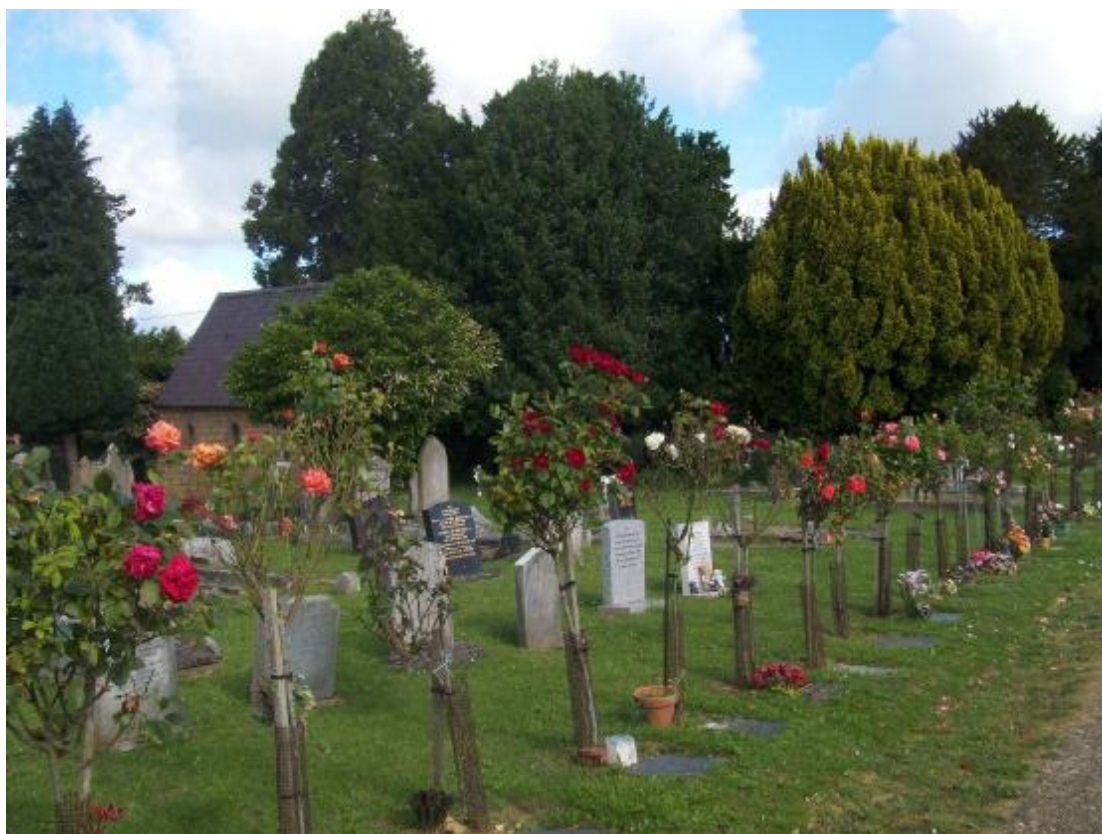
Ongar Cemetery, Site CG1