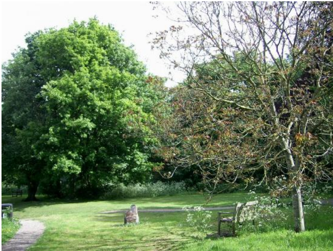
Cerizay Garden's, Site MO4

10.3 Situated to the east of the High Street, adjacent to Ongar Library this site is an area of informal green space which faces Pleasance Car Park and features Cerizay Gardens Playground, a petanque court, and a small area of informal green space which is well signed and offers a number of seats to enjoy the local surroundings. The site offers good access and allows visitors the opportunity to walk around the wooded area where the 12 th Century Ongar Castle once stood. The site is clearly well maintained and is clean, tidy and litter free.