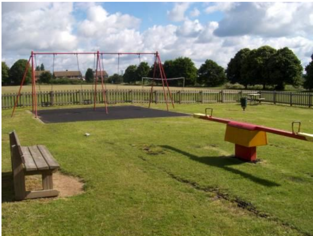
Love Lane Recreation Ground Playground (CY2)