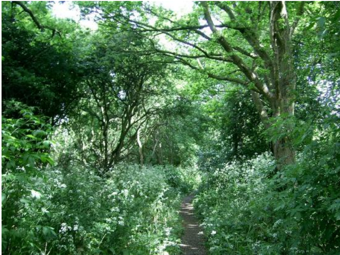
Land Between River Meadow and Moreton Road, Site SO4

creating a sense of enclosure. The addition of the car park as part of the nature reserve will obviously extend the site and create opportunities for additional wildlife habitat.