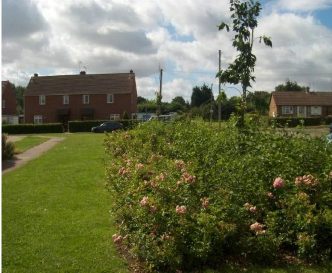
Land to the North West of Parkfields, Site MO2

green spaces found in residential areas, it is nonetheless still surrounded by roads and this therefore makes it unsuitable for anything more than dog walking or as a local visual amenity.