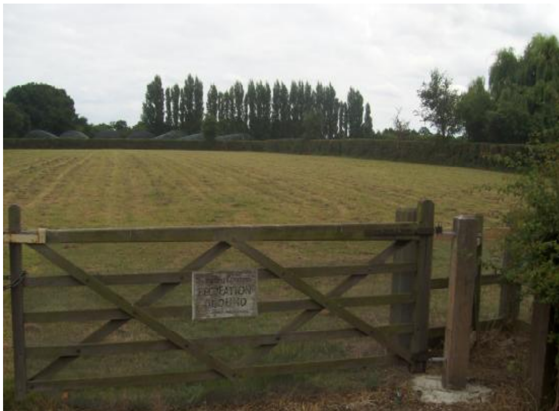
Broadley Common Recreation Ground, Site RG1