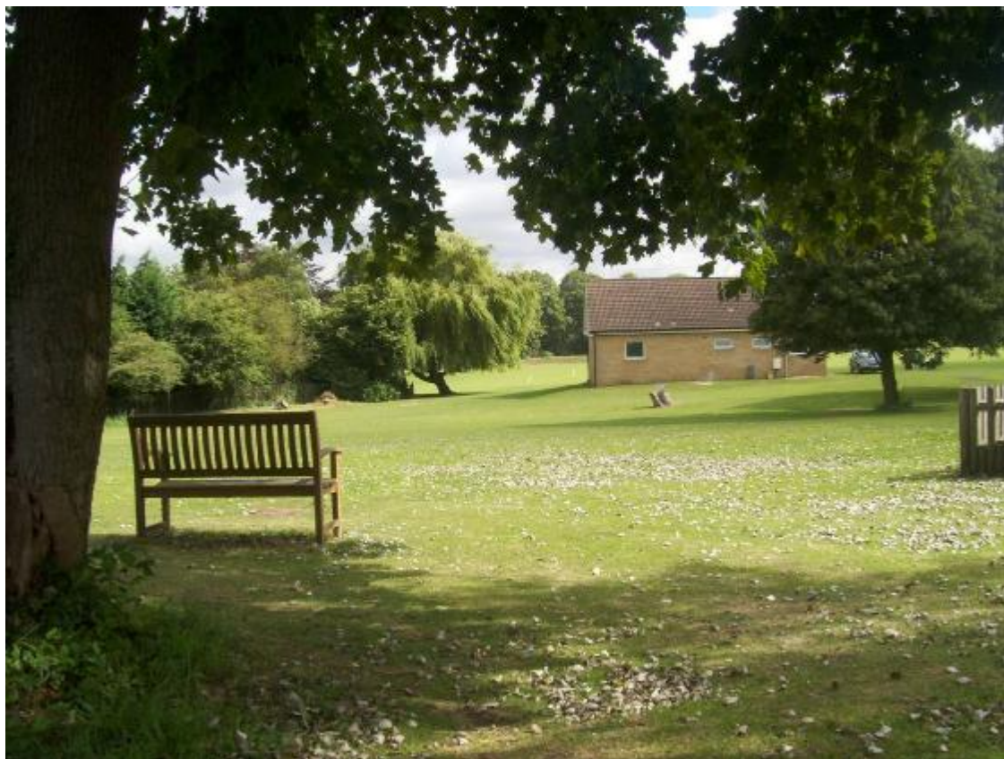
Roydon Playing Fields, Site FP1