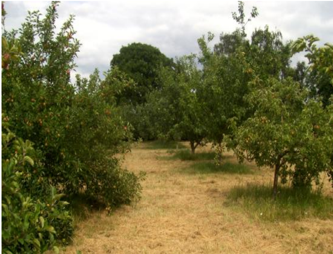
Roydon Community Orchard, Site MO5