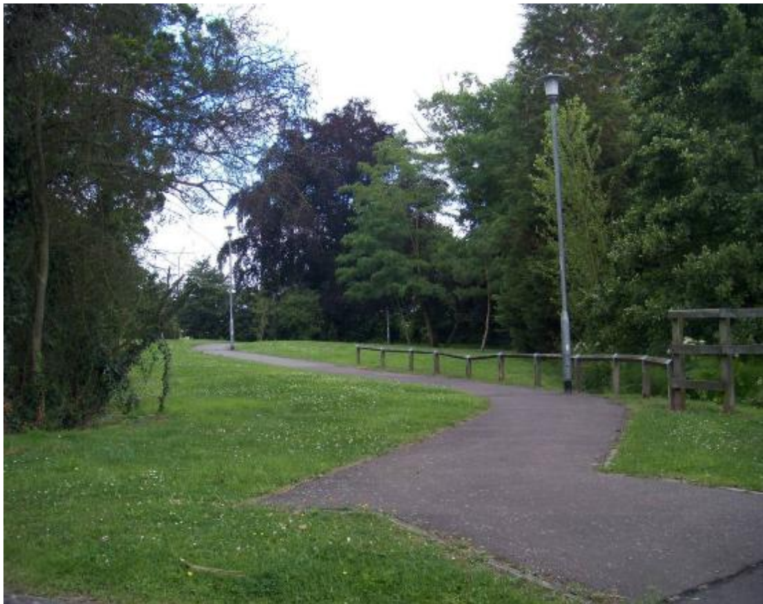
Land to the north of Little Brook Road, Site MO4