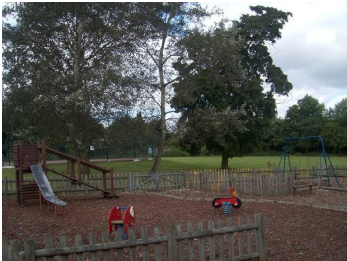
Roydon Playing Fields Playground, Site CY1