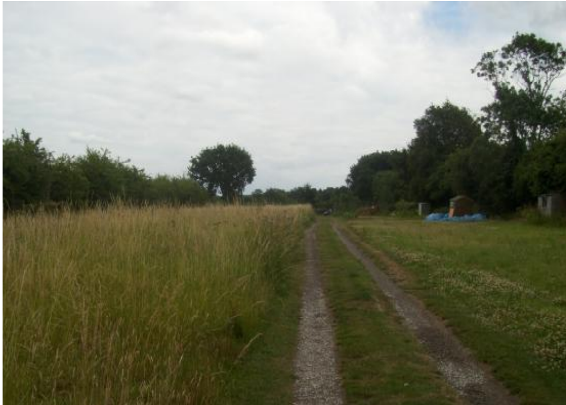
Broadley Common Allotment, Site AT2