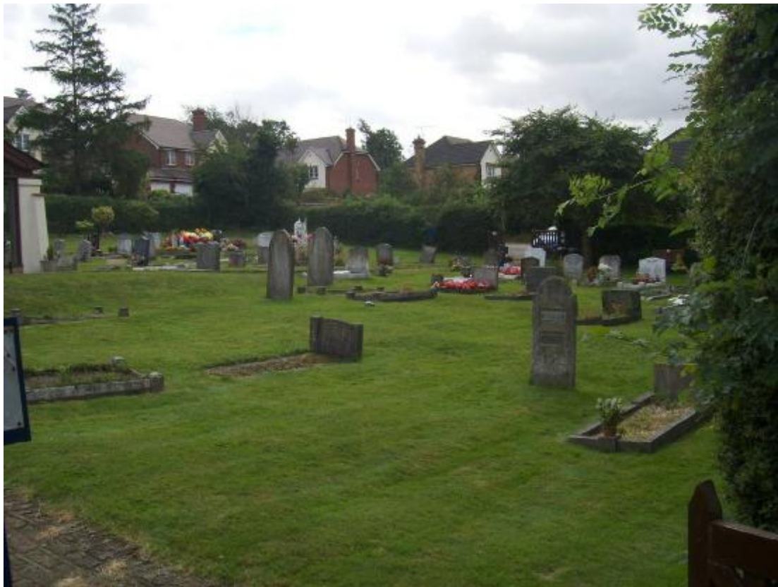
Roydon United Reformed Church, Site CG2