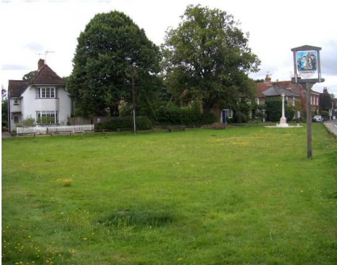
The Green, Site MO3