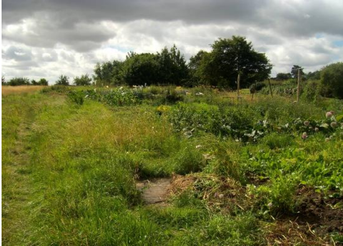
Roydon Village Allotment, Site AT1