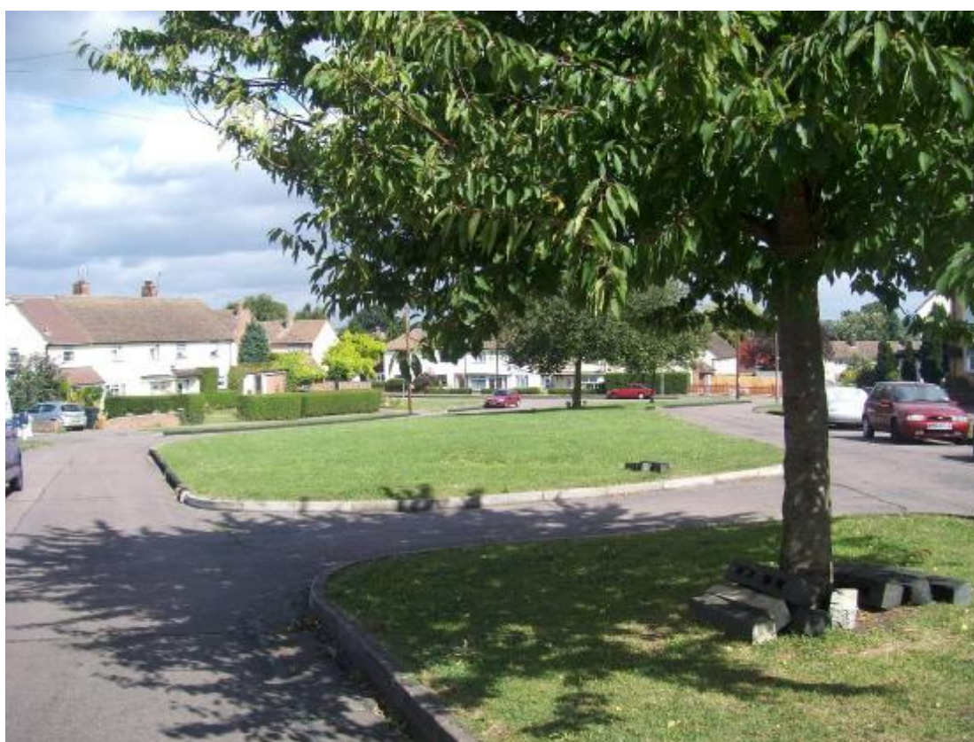
Land Surrounded by Parkfields, Site MO1