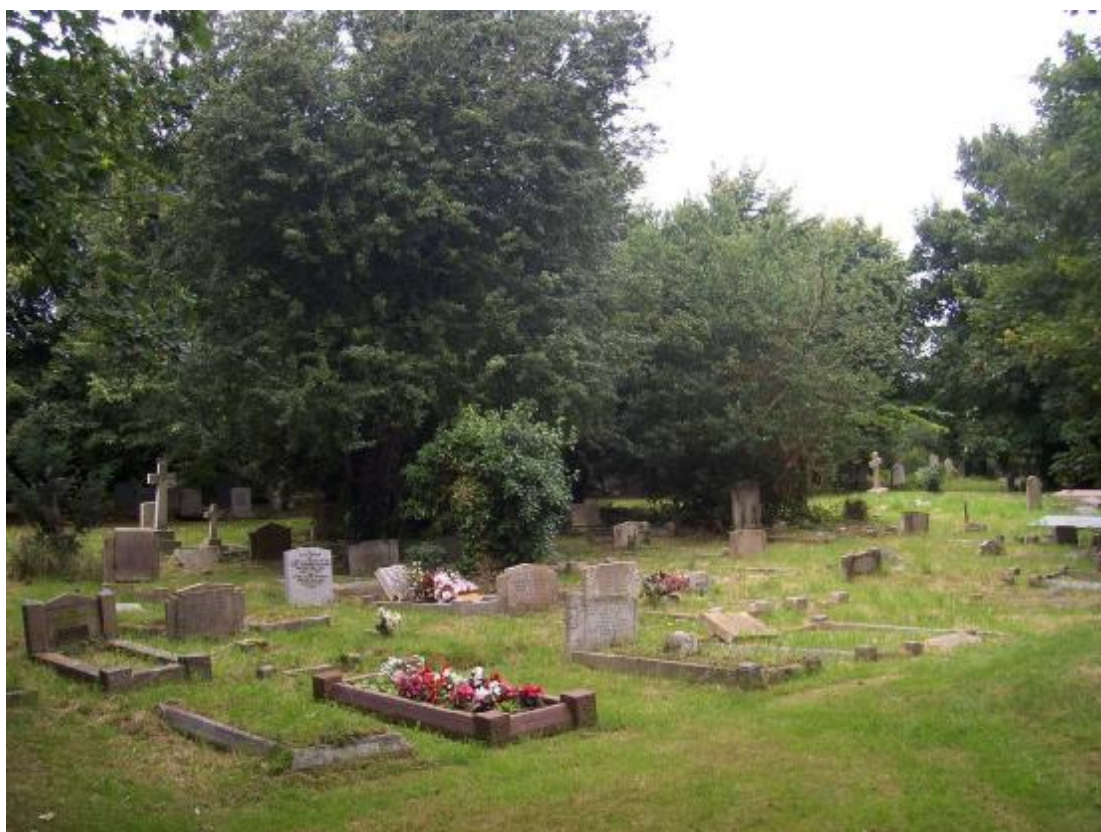
St Peter's Church, Site CG1