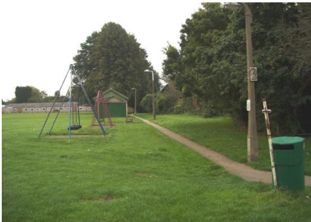
Upper Sheering Playing Fields, Site FP1