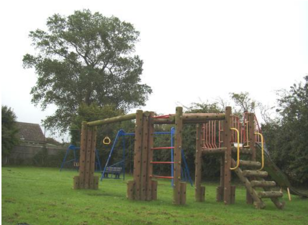
Lower Sheering Playing Field Playground, Site CY2