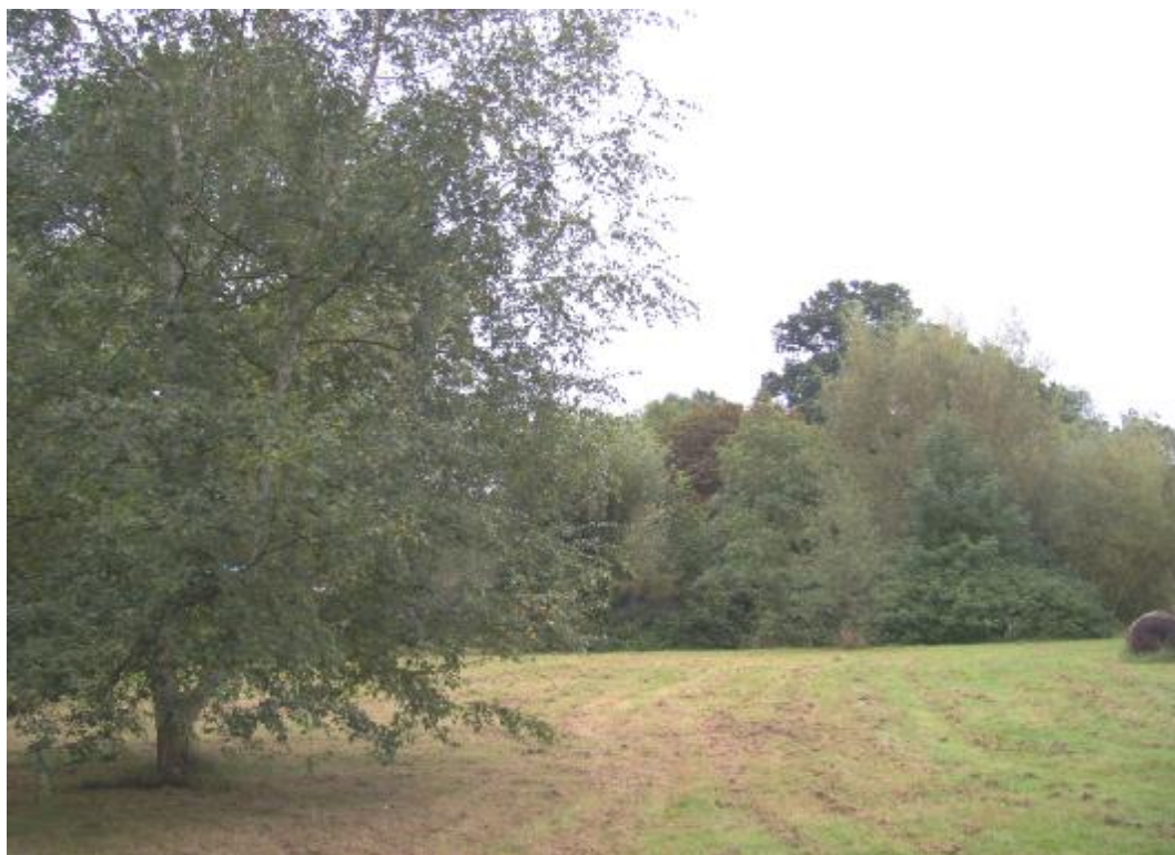
Land to the east of the River Stort, Site MO1