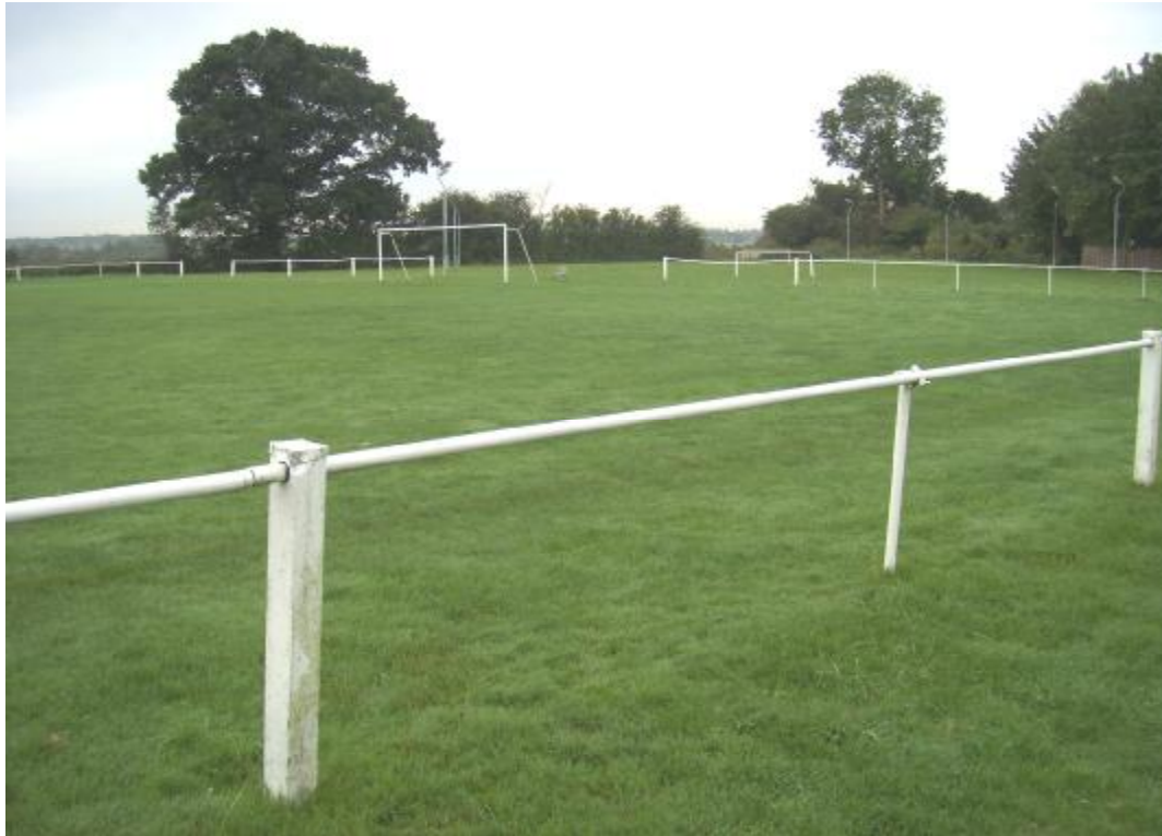
Sheering Football Ground, Site FP2