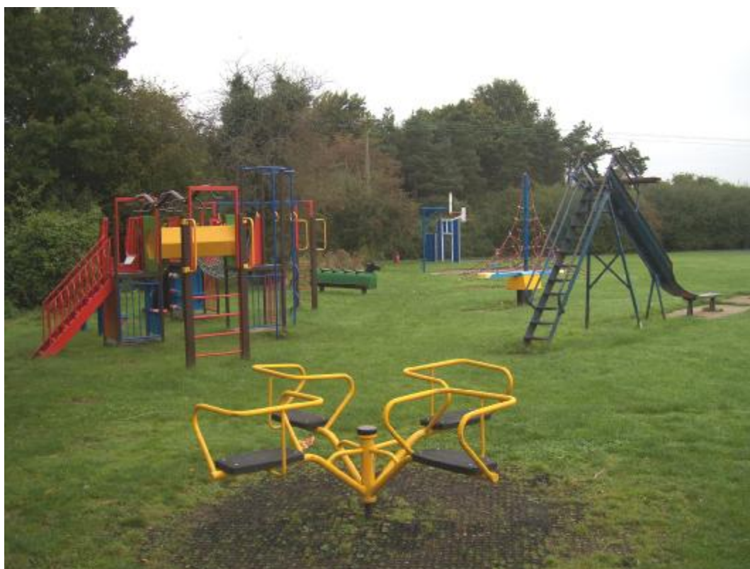
Upper Sheering Playing Field Playground, CY1