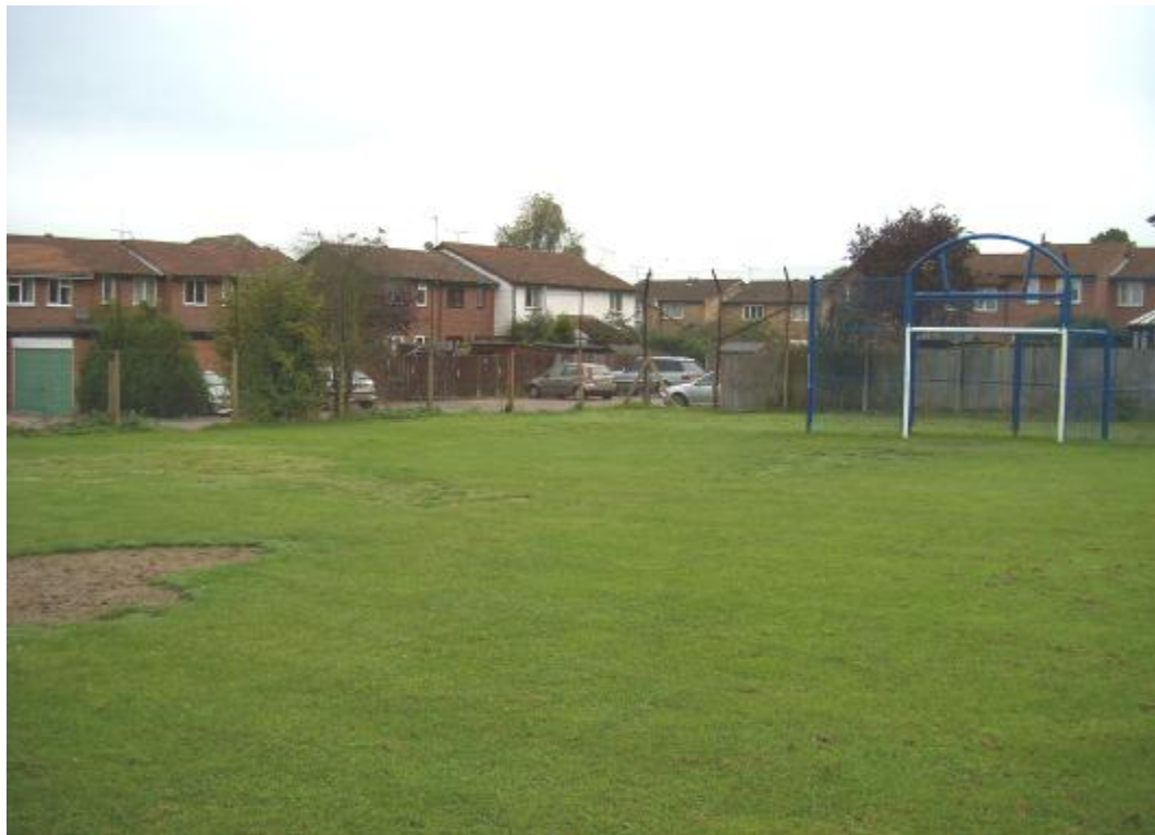
Lower Sheering Playing Fields, Site RG1