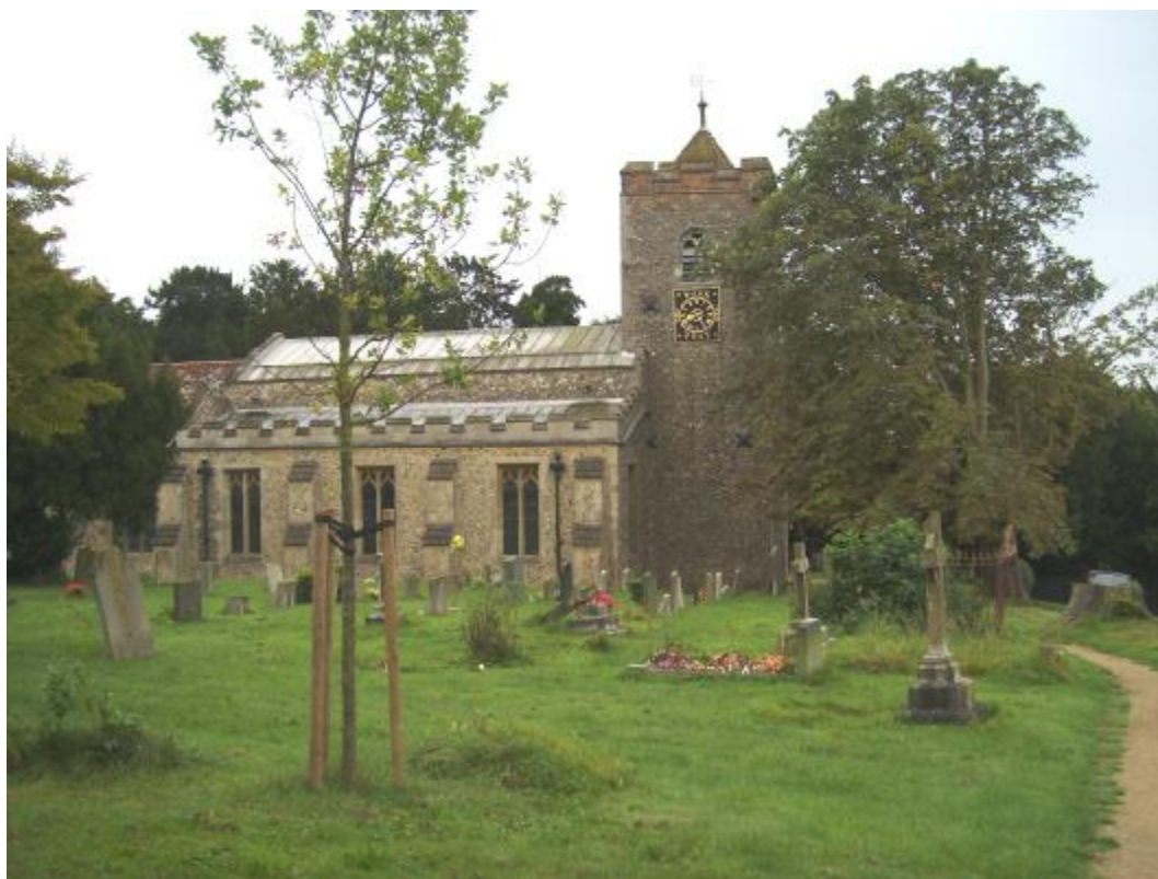
St Mary's Church, Site CG1