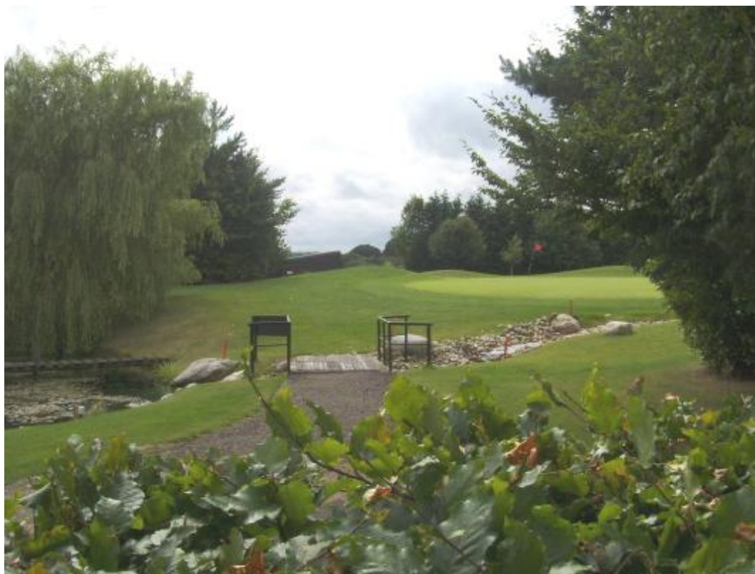
Toot Hill Golf Club, Site AS1