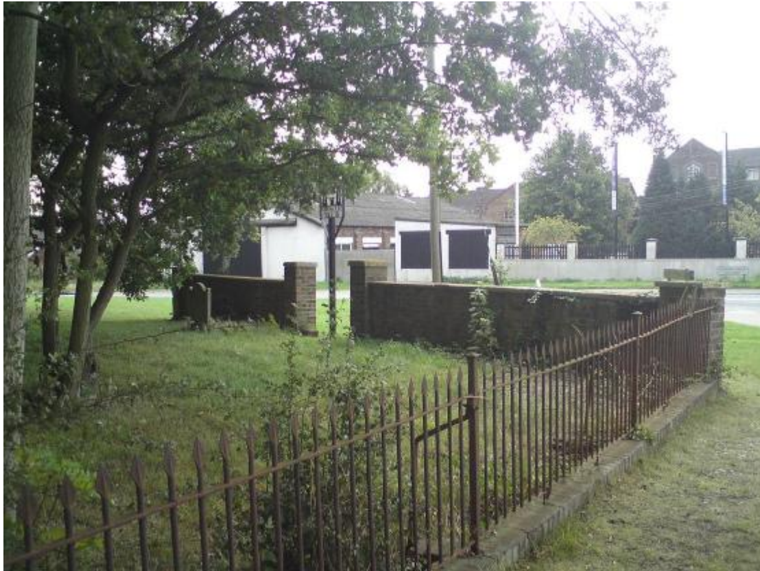
Jubilee Green, Site MO3