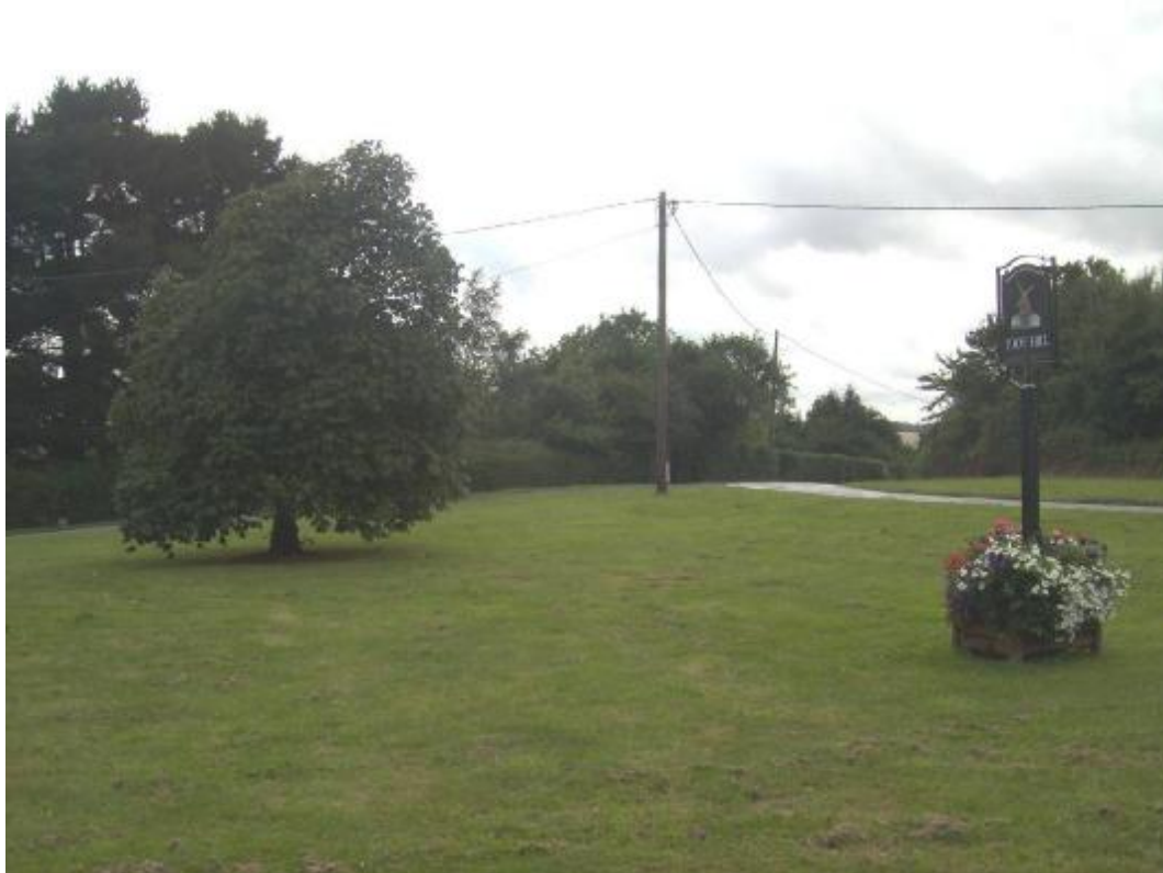
Toot Hill Common, Site MO2