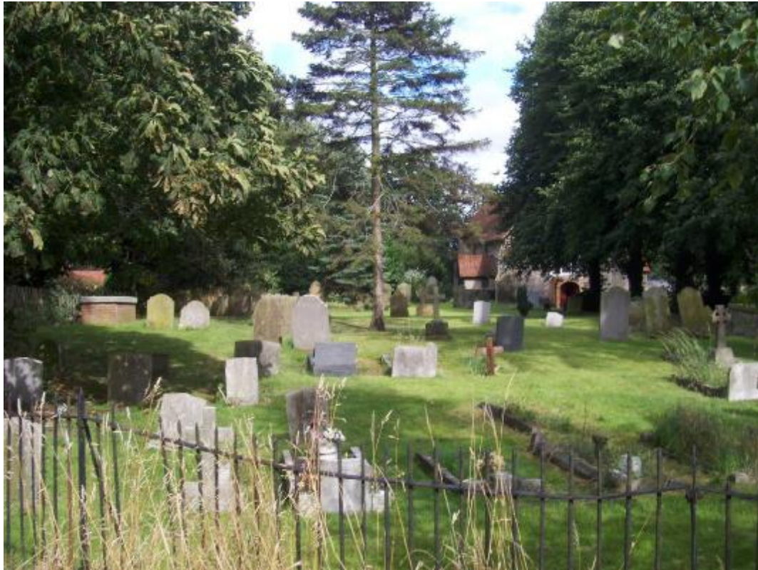
St Margaret's Church, Site CG1