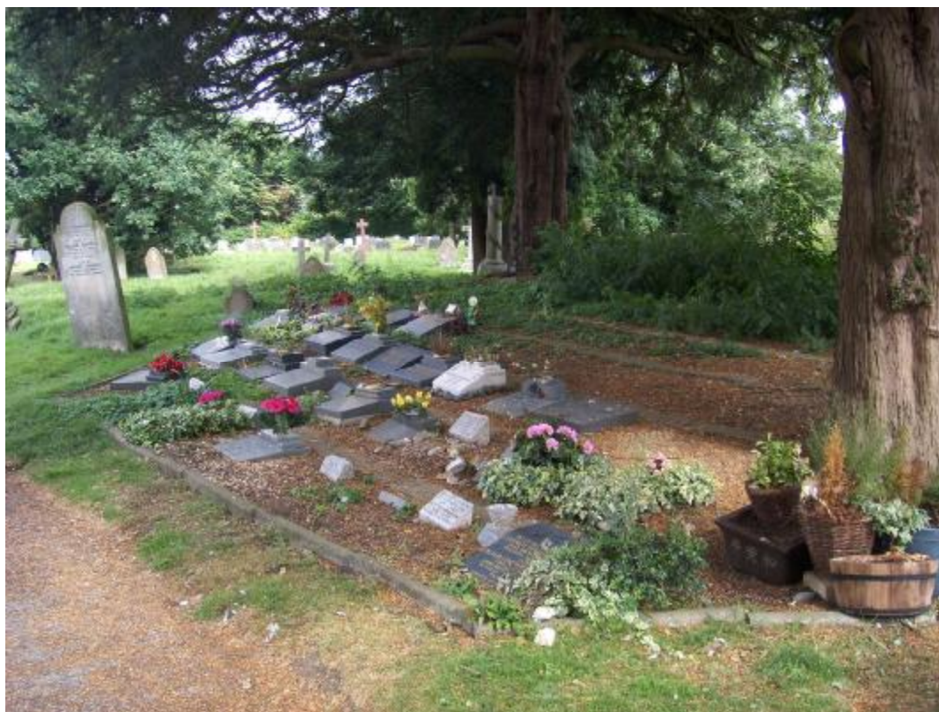
St Mary's Church, Site CG1