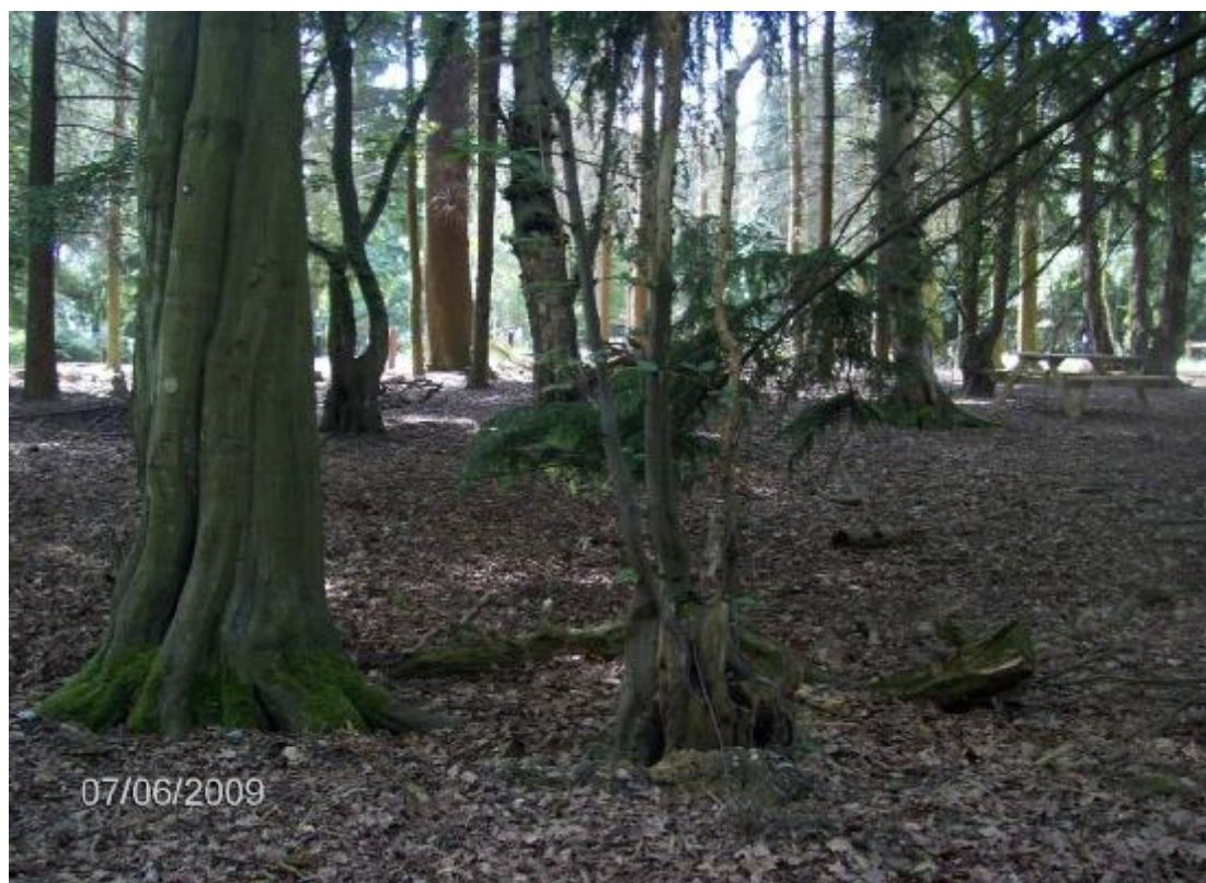
Epping Forest Burial Park, Site SO1