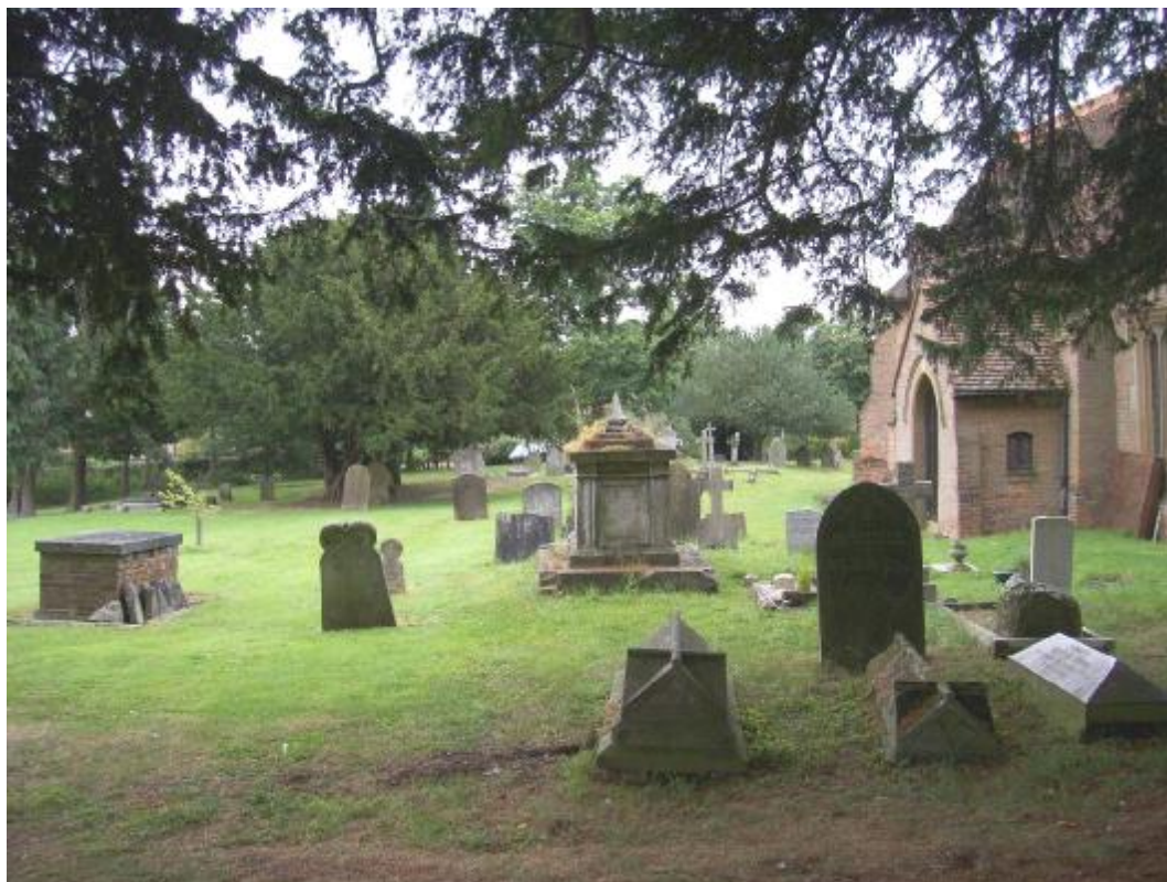
All Saints Church, Site CG1