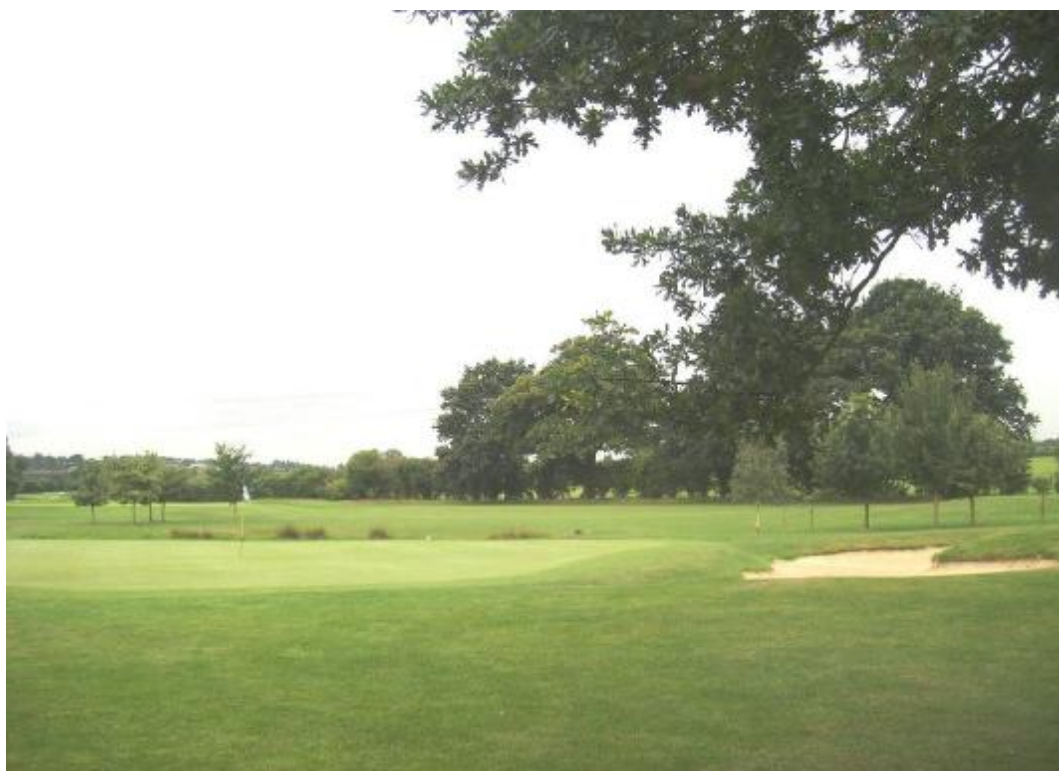
Hobbs Cross Golf Centre, Site AS1