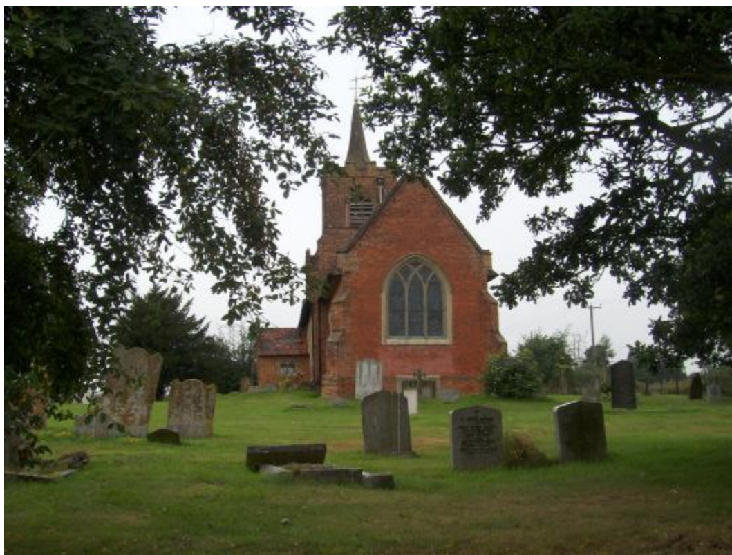
St Michael's Church, Site CG1