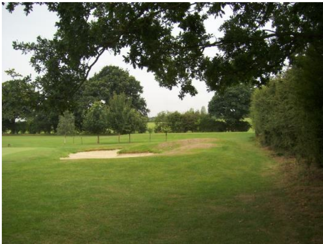
Hobbs Cross Golf Centre, Site AS1