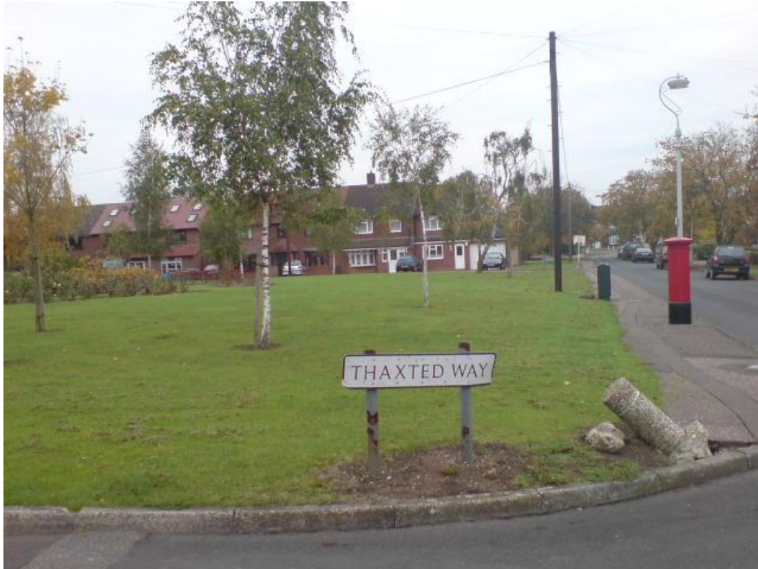
Land surrounded by Thaxted Way, MO4