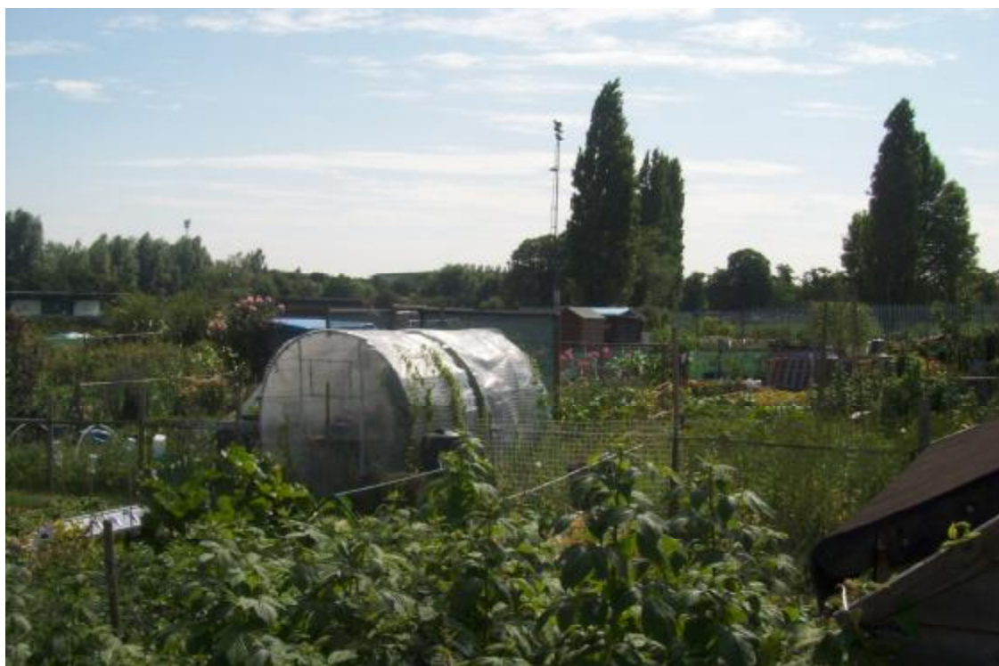
Denny Avenue Allotment, Site AT1