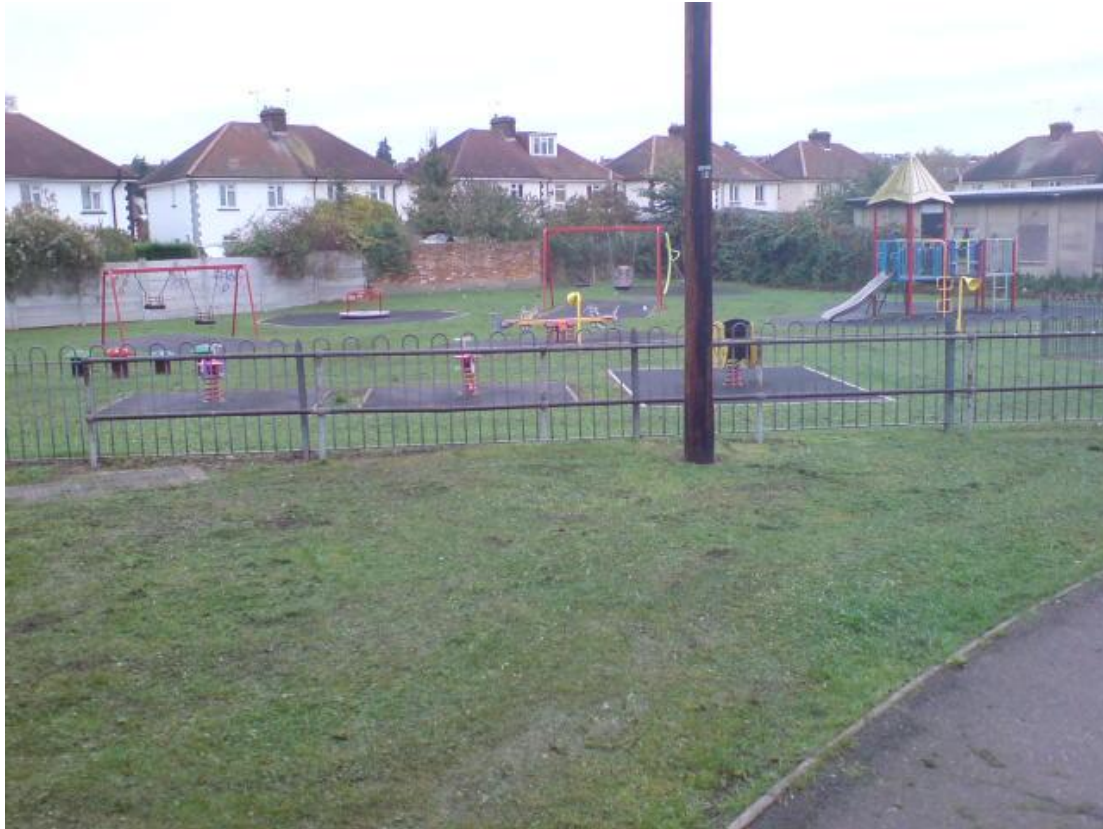
Poplar Shaw Playground, Site CY4