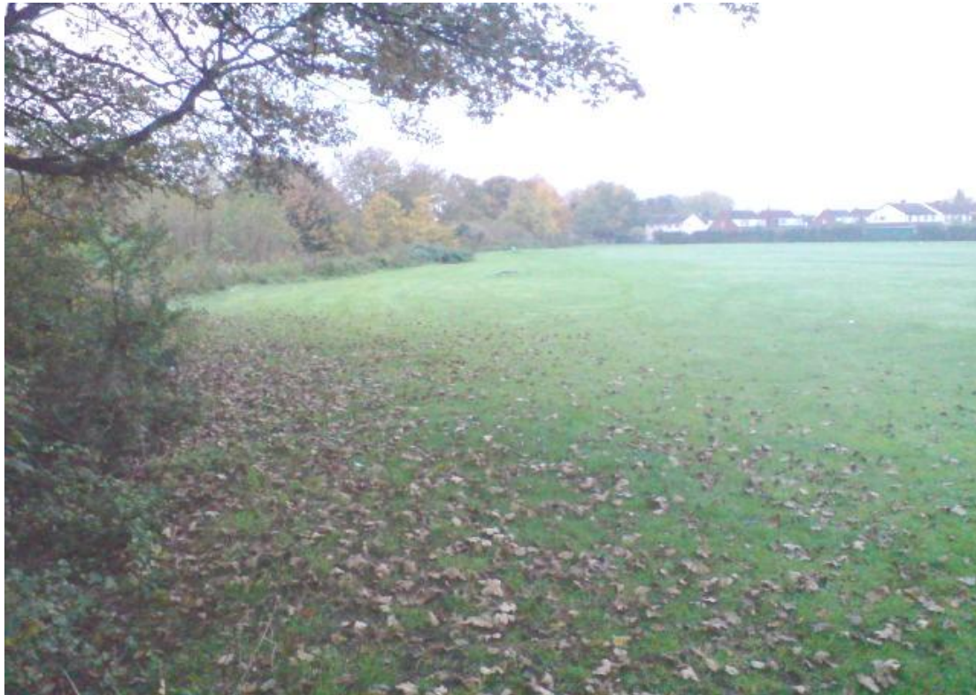
Larsen Recreation Ground, Site FP2

down the eastern perimeter. The football pitches located on the site are particularly close to the brook, and where the pitches and brook are at their closest, there is only a narrow strip of brambles preventing users from falling down the brook's steep verges. Sports equipment could easily be lost to the brook.