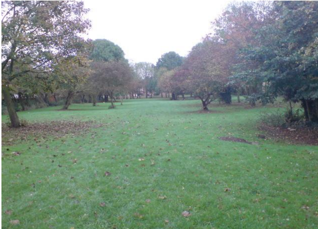
Land Surrounded by Winters Way, Site MO2