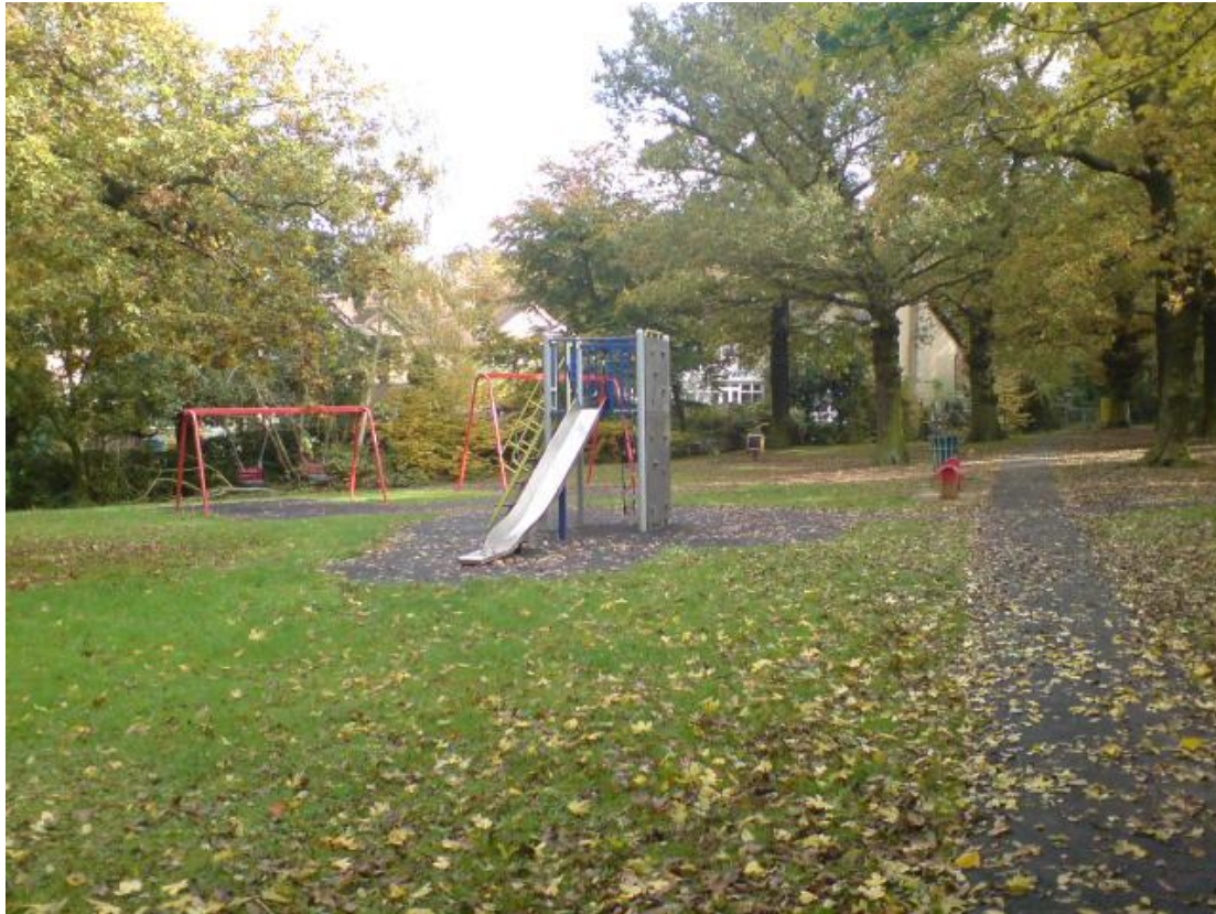
Pynest Green Lane Playground, Site CY6