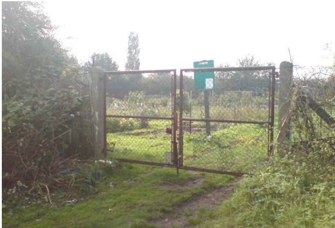
Capershotts Allotment, Site AT2