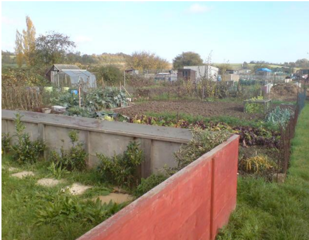
Crooked Mile Allotment, Site AT3