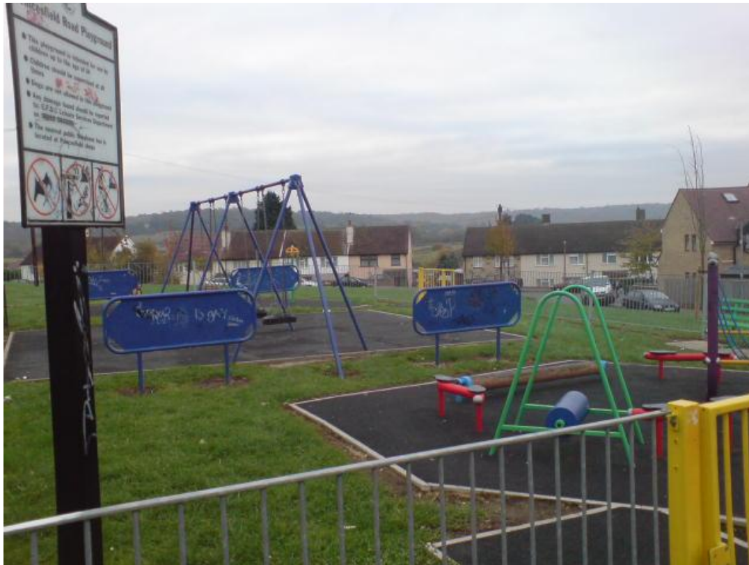
Princesfield Road Playground, Site CY3