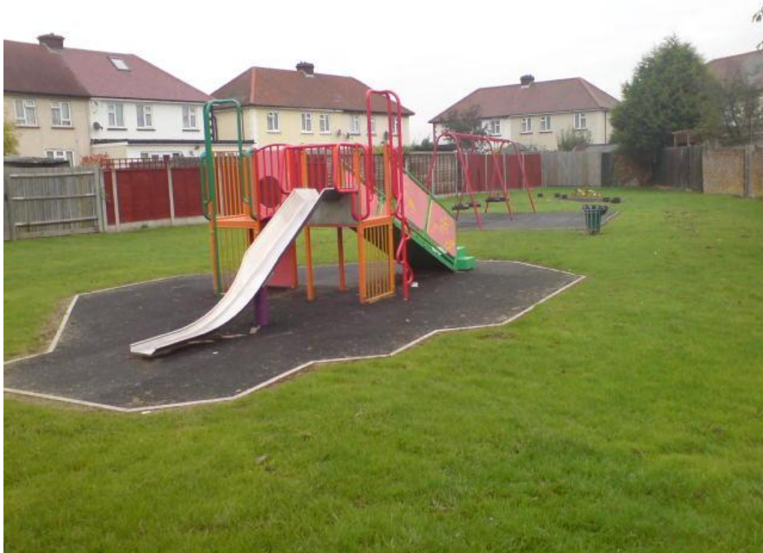
Harold Crescent Playground, Site CY5