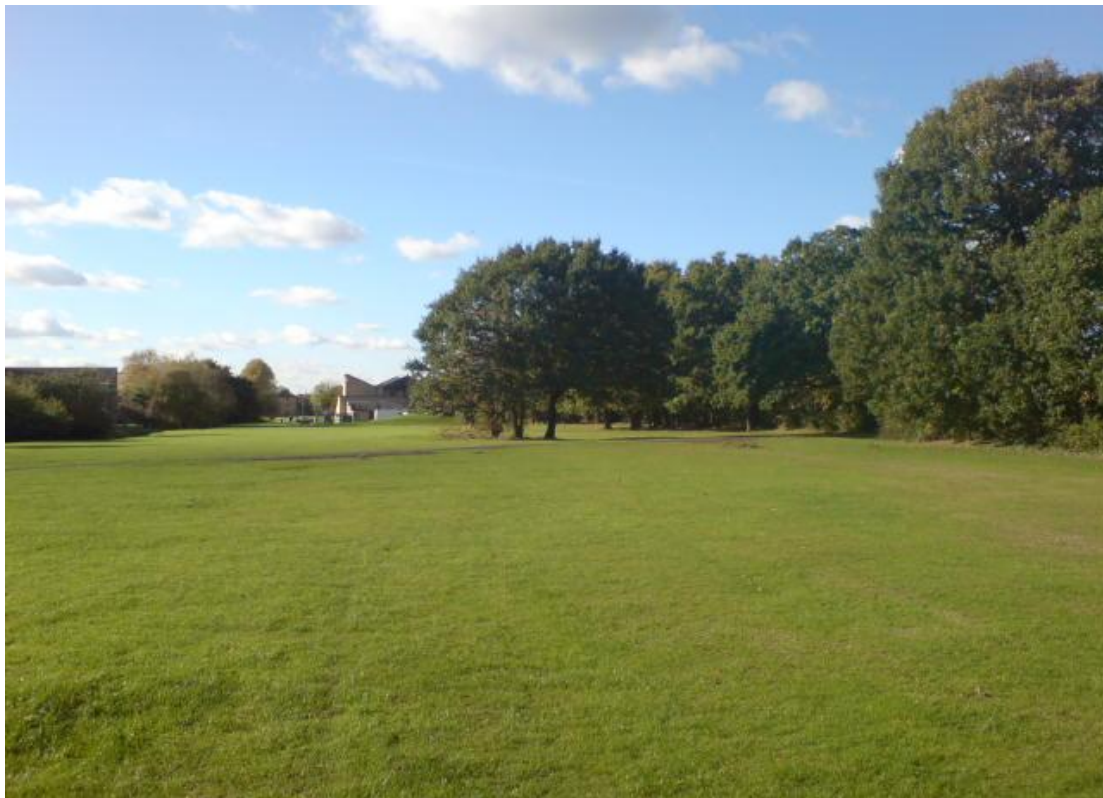
Land to the north of Shernbroke Road, Site MO1

east. Both of these playgrounds have been removed, although evidence of the eastern one is still noticeable, with some of its wood chipping and tarmac surfacing remaining. This is not particularly attractive, and detracts from the overall visual amenity of the site. Another issue is the fact the area is fairly large, it provides no seating, dog waste bins or litter bins. As a result, litter and dog excrement can be seen throughout, but particularly along the banks of the brook.