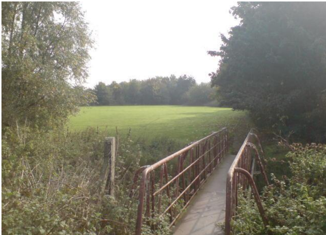
King George V Playing Field, Site FP5