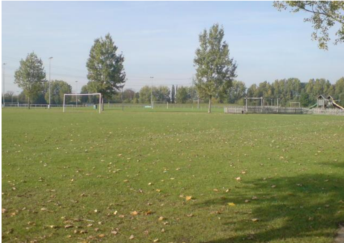
Town Mead Leisure Park, Site FP1