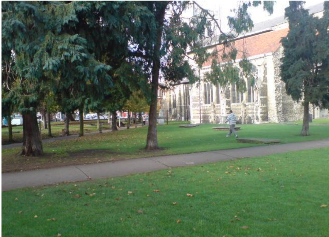
Waltham Abbey Closed Churchyard, Site CG4