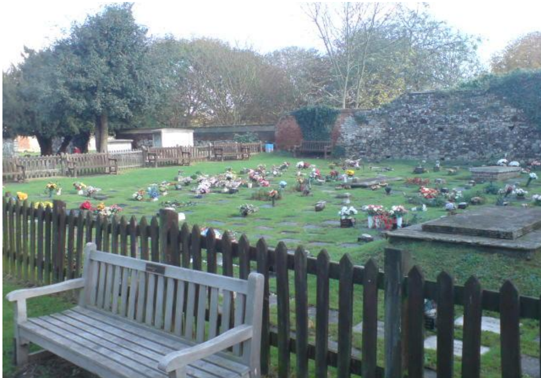
Waltham Abbey Garden Of Rest, Site CG3

to the entrance. These are very slippery when they are wet, and so caution must be taken when standing on these, particularly by those who are less mobile.