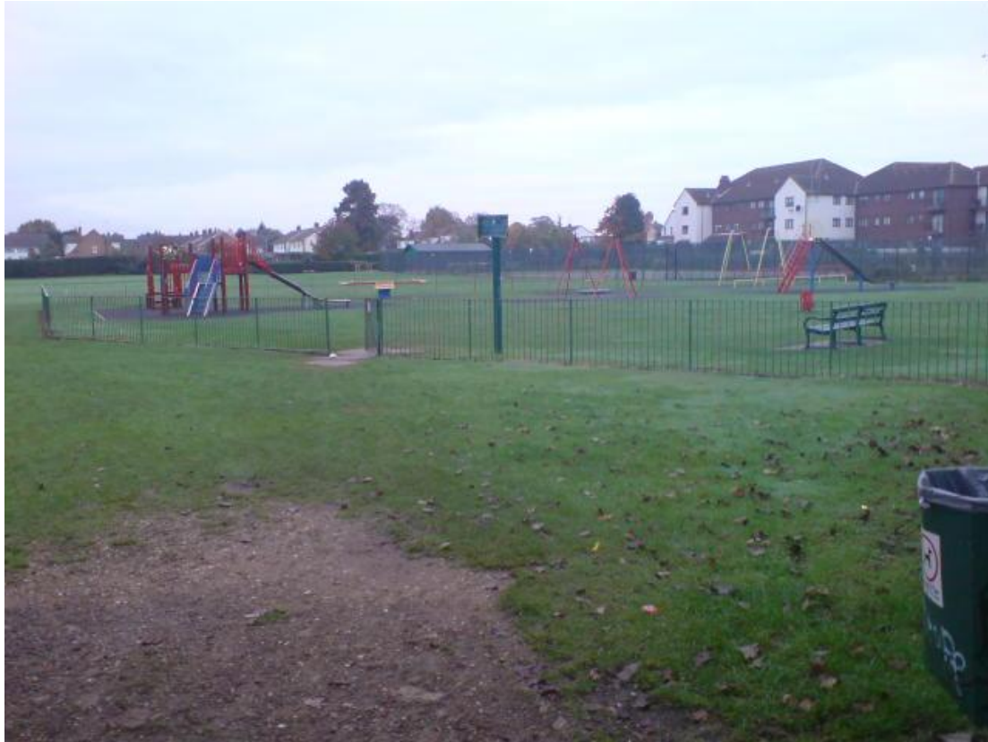
Larsen Recreation Ground Playground, Site CY2

the fact that although the surfaces around the equipment are made of rubber, the rest of the playground is grass, which potentially makes the site more inconvenient to use during the colder and wetter times of the year.