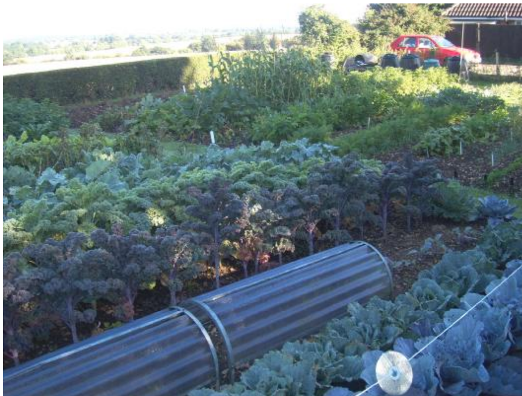
Willingale Parish Allotments, Site AT1