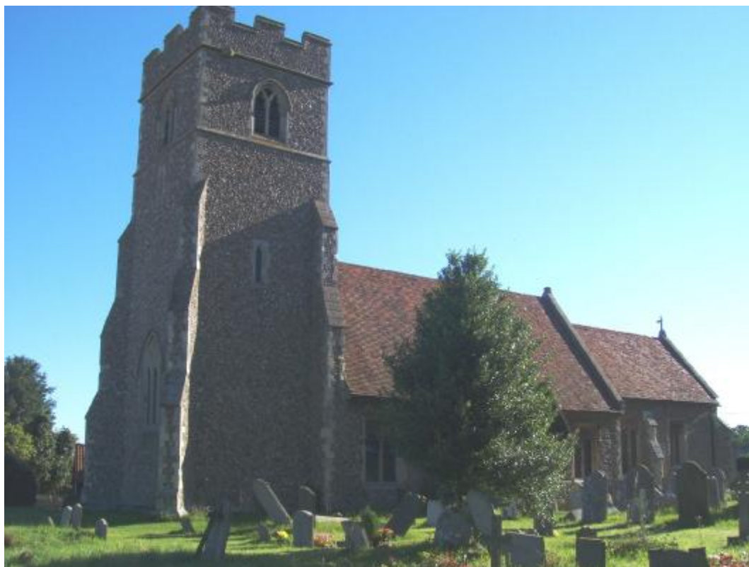
St Christopher's and St Andrew's and All Saints Churchyard, Site CG1