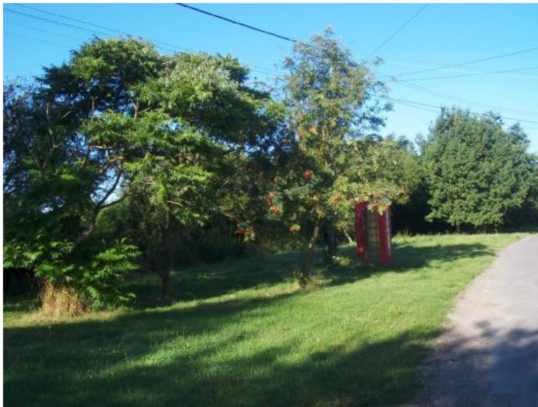
Wall's Green, MO1