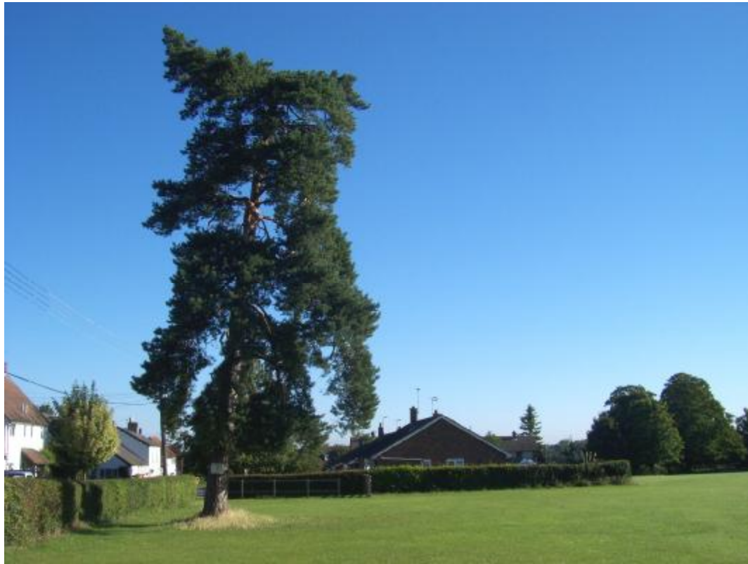
Willingale Playing Fields, Site FP1