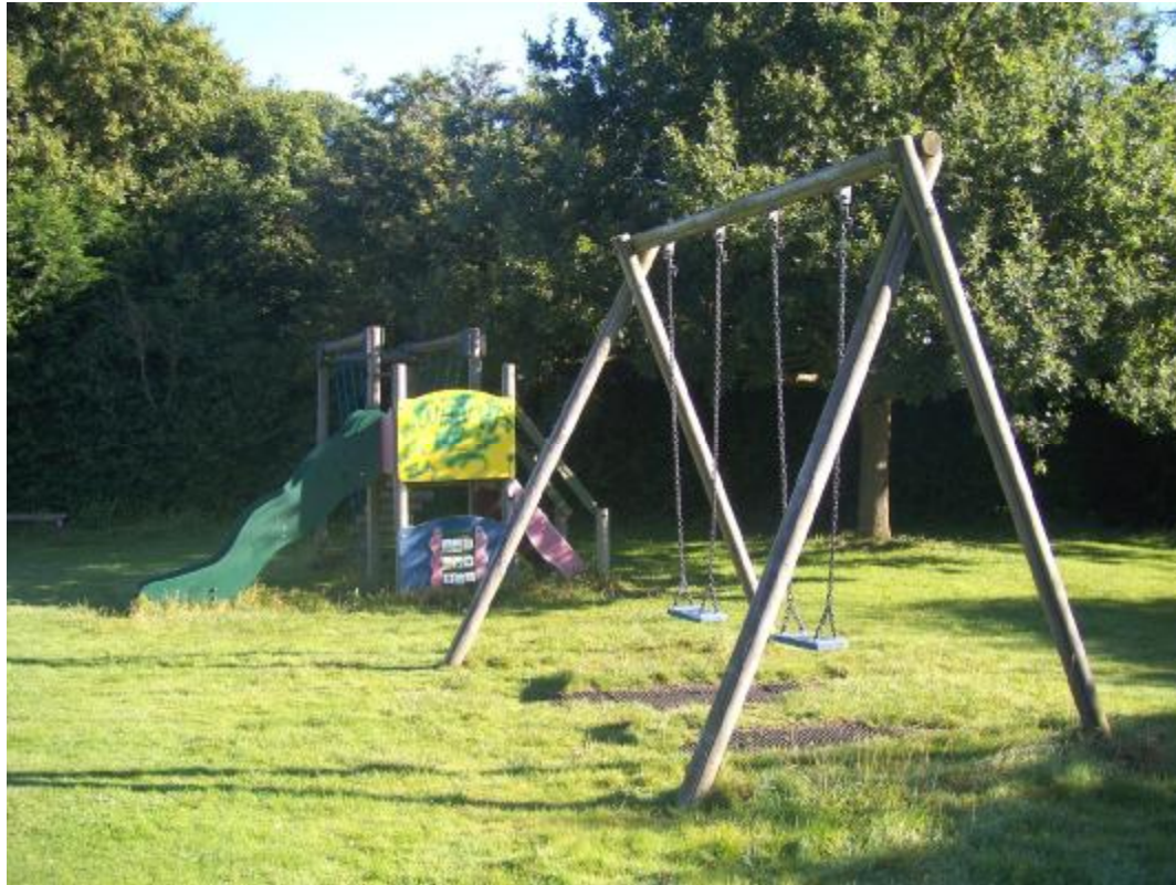
Willingale Playing Field Children’s Playground, Site CY1