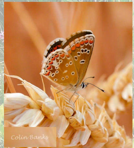
Brown Argus Butterfly

Site Description: Created primarily as a flood alleviation project in 1989 to protect the village of North Weald from flooding. The banks surrounding the large stream fed pond at the centre of the site can hold a massive 35 million litres of water in the event of a flood. These banks and areas of water also provide great habitat for wildlife such as amphibians, dragonflies, butterflies and birds as well as the wide variety of flowers and grasses that can now be found here.